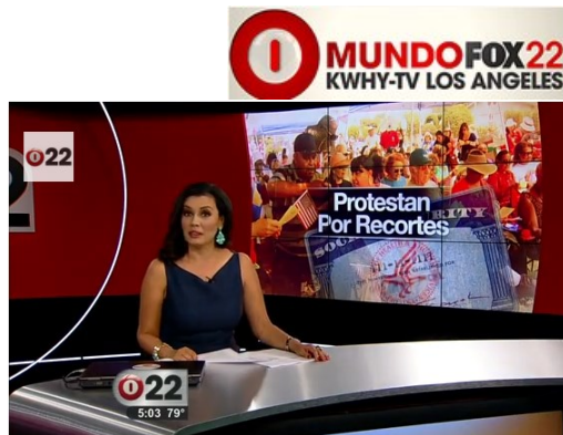
HUMAN CHAIN: Retirees Protest Inflation Changes Des Moines