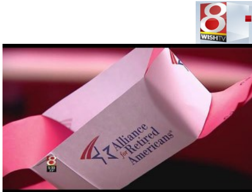
Retirees demonstrate against proposed Social Security reductions