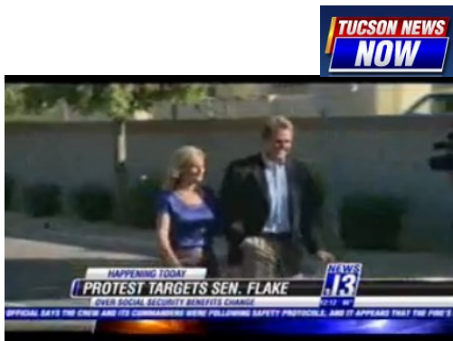
Seniors protest proposed social security cut New Haven, CT