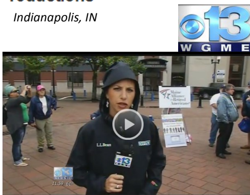
Seniors Worried About Change In Social Security Benefits Lewiston, ME