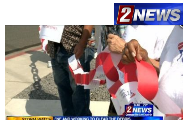
Protestors Upset Over Proposed Social Security Cuts Reno, NV