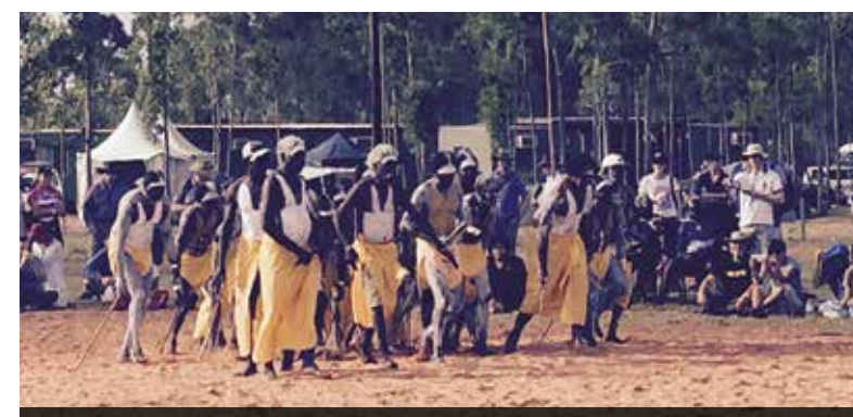
Ceramonial bunggul performance to open the Garma Festival at Nhulunbuy early this month

The AMA President said that although Government efforts to improve school attendance, encourage young people to get a job and to make communities safer, were laudable, by themselves they would not bridge the big gap in wellbeing between Indigenous Australians and the rest of the community.