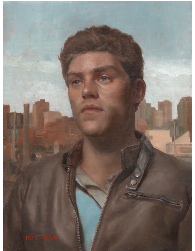
Vancouver in November, 12 x 9 inches, Oil on linen

Learn more about Gregory at: www.gregorymortenson.com