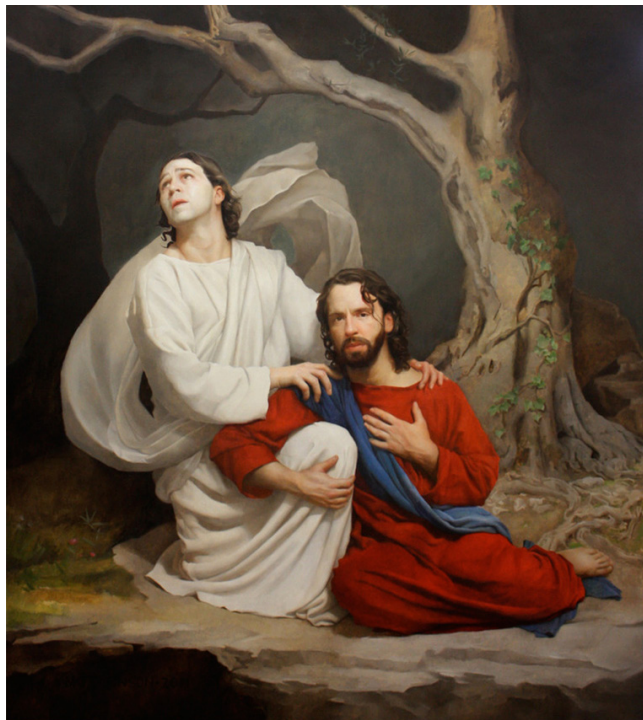
Gethsemane , 50 x 40 inches, Oil on linen

study of the Christ figure, I hired a bearded model for the portrait study. After working with him for about four hours, I realized he just wasn't the right fit for a Jesus character. He was handsome and bearded but looked more like a Viking or knight than a religious figure.