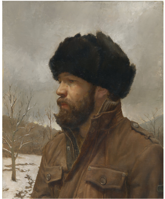
Self-Portrait in Russian Hat , 16 x 14 inches, Oil on linen