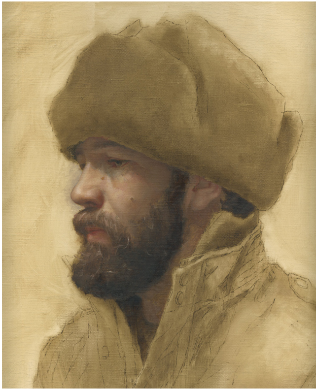
Beginning stage of Self-Portrait in Russian Hat