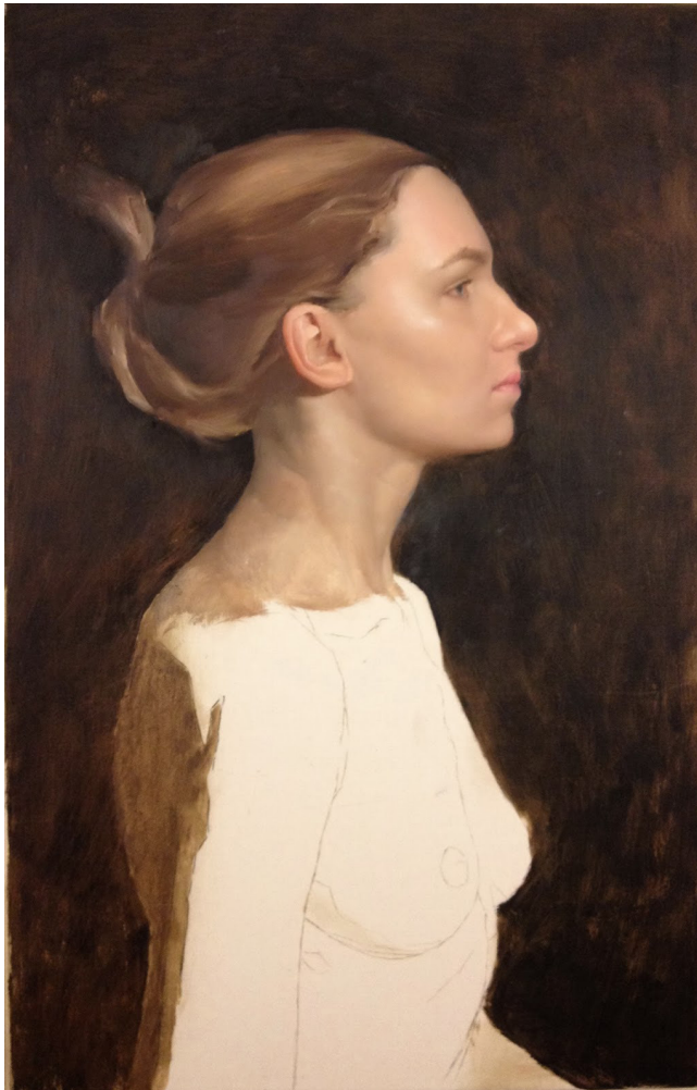
Beginning stage of Irena with Pearl Earring