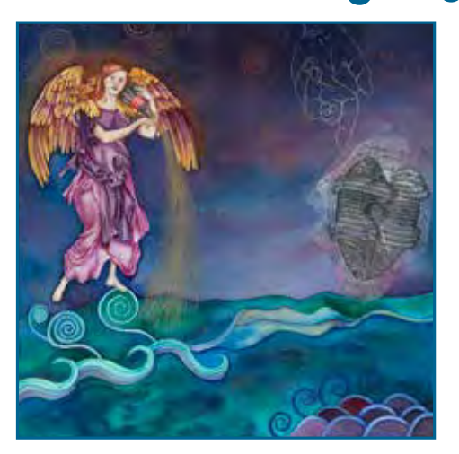
A national exhibition of works that are 24" maximum on each side, but that create a big impact through content or through visual elements