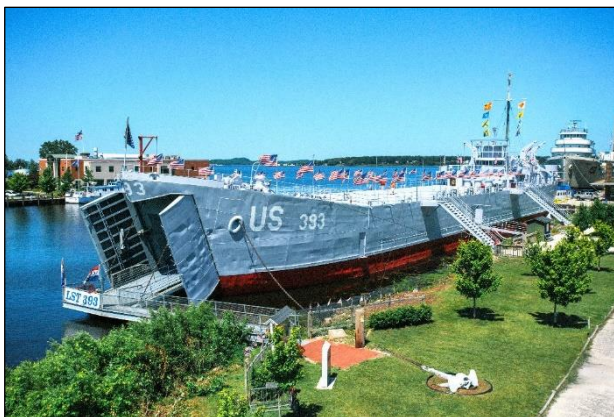
LST 393