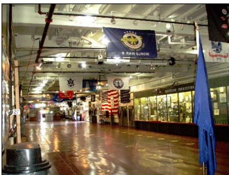
INSIDE THE USS LST393 VETERANS MUSEUM

In the event of inclement weather, showings will be moved inside the ship, and will begin at 10 pm.