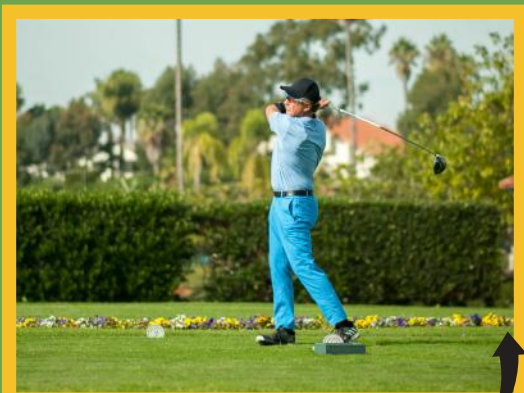
VIP Guest MLB Legend Fred Lynn

TO REGISTER: EVENTS@FACE4PETS.ORG | 858-450-3223