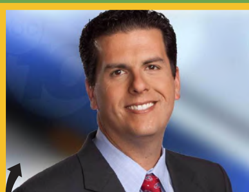
Celebrity Auctioneer Ben Higgins