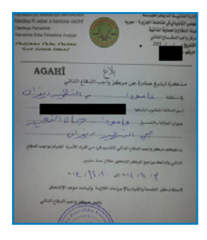
Picture of the statement that was issued by PYD about what it called "Civil Defense Duty"