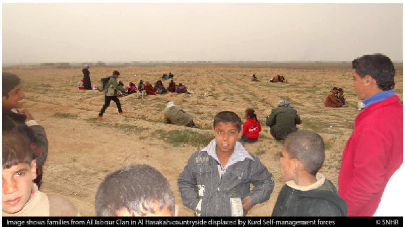
Image shows families from Al Jabour Clan in Al Hasakah countryside displaced by Kurd Self-management forces