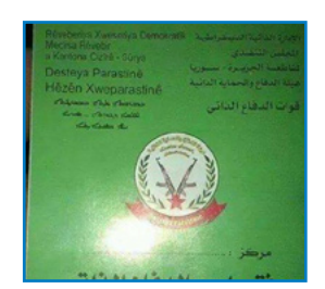
Pictures of the statement that was distributed among young men who were included in the conscription resolution:

With the beginning of 2014, YPG forces started carrying out raiding and arresting young men in Al-Hassaka, Al-Qameshli, and Efreen in Aleppo suburbs for conscription purposes. The arrest rates increased after the self-protection law or "the conscription" law was issued. The arrests included widely women and girls. The women in the Kurdish areas are in danger of being pursuit, arrested, and forcibly taken to the training camps which are held by YPG.