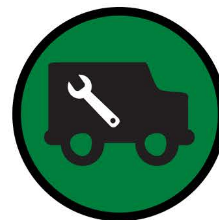
RDO Equipment Service Support/ Technical Advice

For more information about AgriSync, visit: www.agrisync.com .