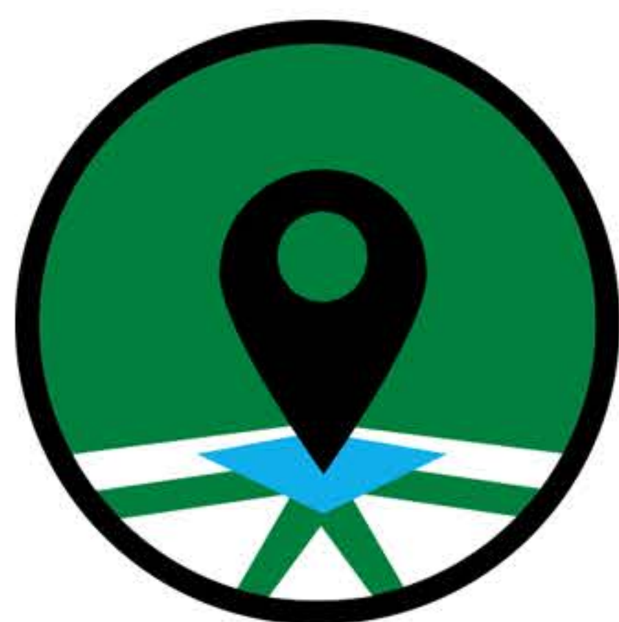
RDO Precision Ag Team