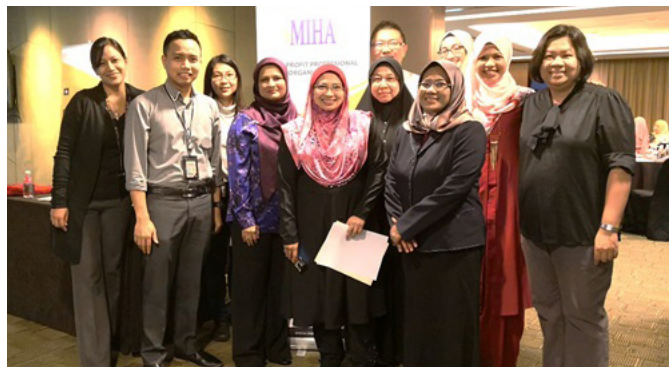
New committee members for 2018-19 elected during the 16 th MIHA AGM

After the knowledge café, MIHA's 16th annual general meeting (AGM) took place on the same day. Discussions there included past activities during the year 2017-18 and the association's current financial status. Tokens of appreciation were given to the past committee members for their relentless effort to steer MIHA for the past year. The new committee members have been elected and will continue to serve and bring MIHA to a greater height for the next term.