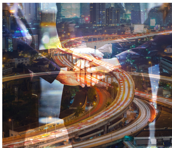
IOHA plans multiple collaborations with other industry associations

A call for proposals about a new website had been issued in April but the response had been poor due to the short timescale. Following extensive discussion, a consensus was agreed to go ahead with a second call for web proposals but to keep the request realistic and simple.