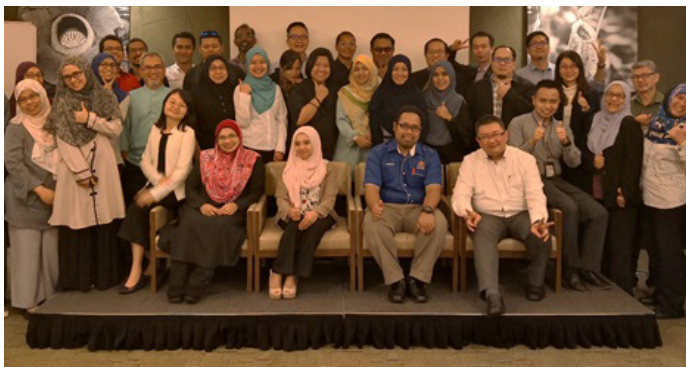
Speakers and participants at MIHA's IH knowledge café

With the rise of musculoskeletal disorders cases reported in Malaysia, she highlighted the fact that the guidelines are expected to help the industry resolve issues arising from the workplace.