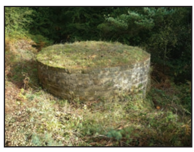
The base of one of the two colliery chimneys at New Fancy