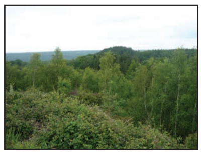
The Viewpoint offers 360 degree views over the surrounding Forest