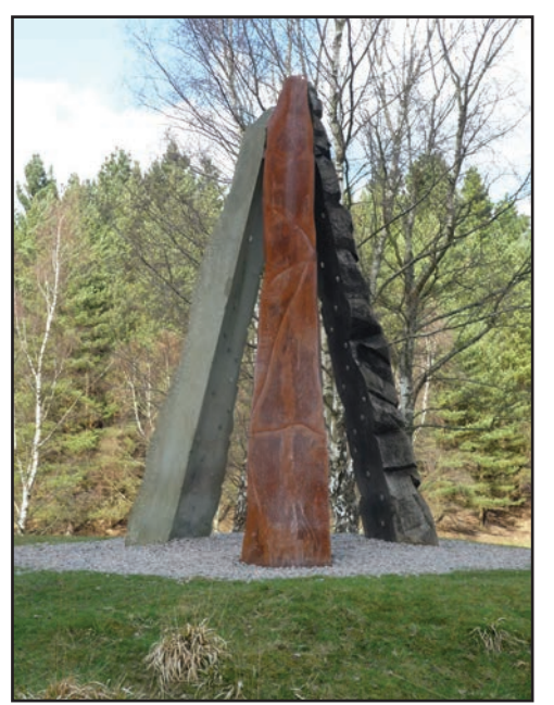
Pictured left, the 'Roll of Honour' sculpture, better known as the Miners' Memorial