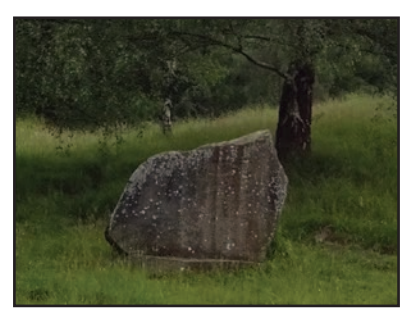
Forestry Commission commemorative stone installed in 1976 when New Fancy became an amenity site