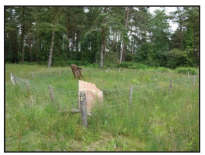
The top of the main shaft at New Fancy with commemorative stone