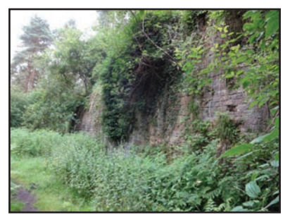
The remains of the colliery screens, where the mined coal was loaded into railway wagons