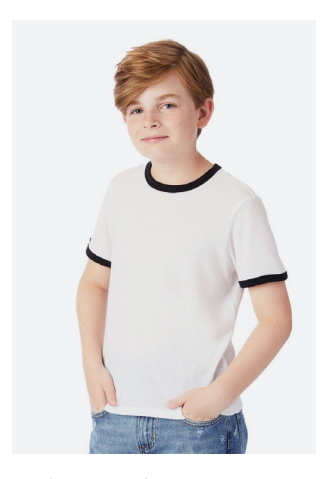
K5103BP Youth Keeper Ringer