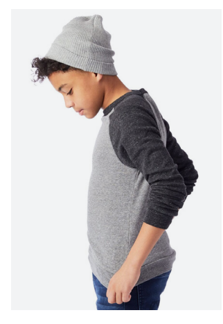
K9575GF Youth Champ