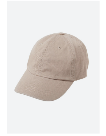
H0070C1 Dad Cap