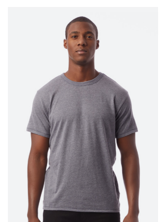
5050BP The Keeper