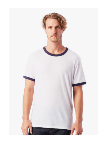
5103BP Keeper Ringer

We can't blame you for wanting to give everyone you know the softest basics around. Now you can with these must-have styles that fit any budget.