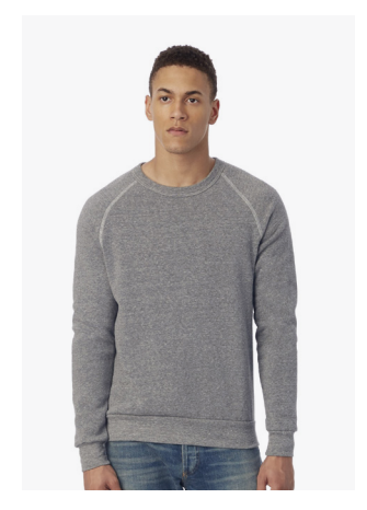
9575F2/FB The Champ

Wrap up the gift of year-round comfort. Our Eco-Fleece collection, inspired by classic gym wear, is made with a blend of sustainable materials for unmatched softness.