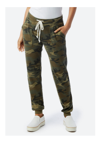
8632FH/FJ Long Weekend Pants 8625FH/FJ Campus Jogger