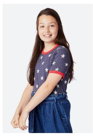
K5103EA Youth Eco Ringer