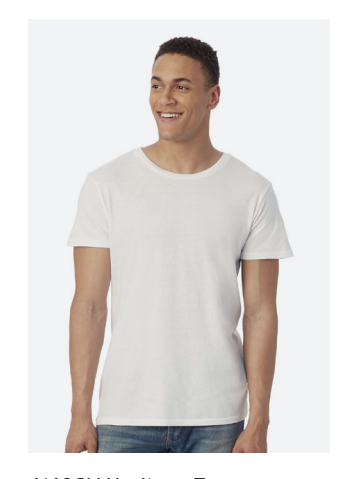
4162CV Heritage Tee