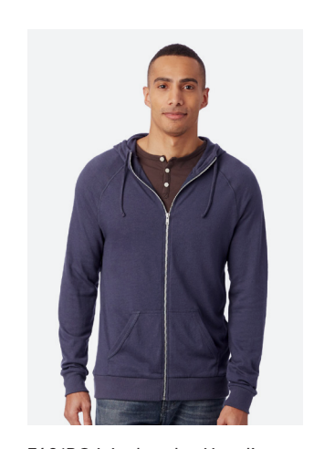
7601BQ Weekender Hoodie