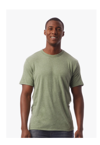
5050BP The Keeper

We have the perfect T-shirt for everyone on your list, at every price point and comfort level, from soft to softer. Try our unisex styles, perfectly tailored for him and her.