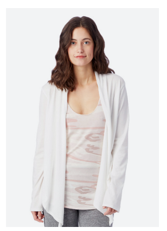
2922MR Stevie Wrap