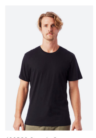
6005C2 Organic Crew