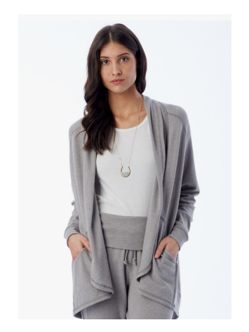
7598BQ Zen Wrap

A comfy wrap is the perfect layering piece that transitions easily from season to season. Pull together every fashion-forward look with one of our stylish wraps.