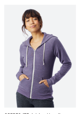
9573F2/FB Adrian Hoodie