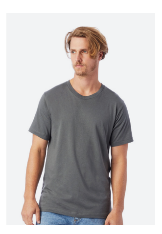
1070C1 Basic Crew