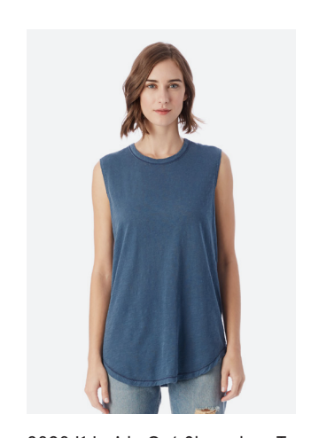
2898J1 Inside Out Sleeveless Tee 2835E1 Warm Up Wrap