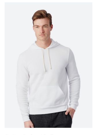
9595F2 The Challenger