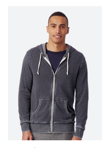
8636FH/FJ Laid Back Zip Hoodie