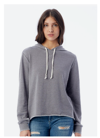
8628FH/FJ Day Off Hoodie