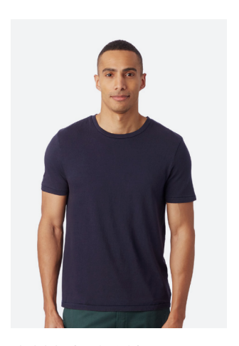
1010CG The Outsider