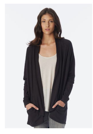
7598BQ Zen Wrap