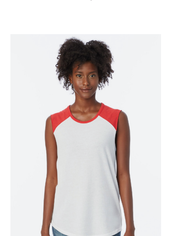
5104BP Team Player Tee