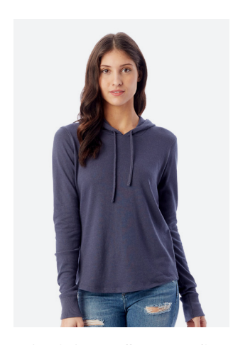
7594BQ Cozy Pullover Hoodie