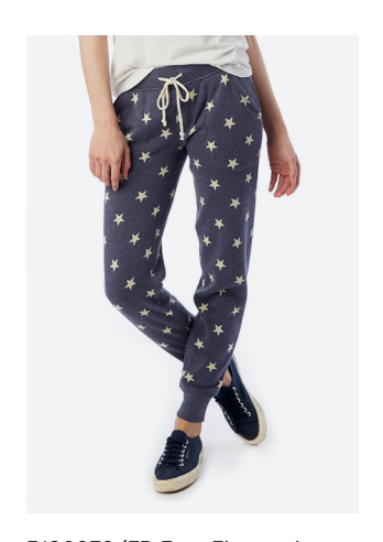
31082F2/FB Eco-Fleece Jogger