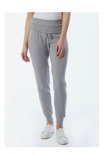
7600BQ Slow Jogger