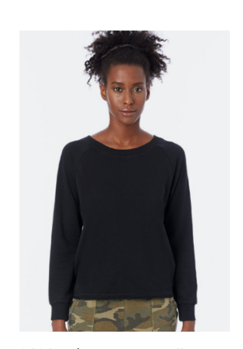
8626FH/FJ Lazy Day Pullover