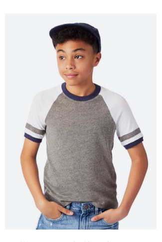
K5093BP Youth Slapshot