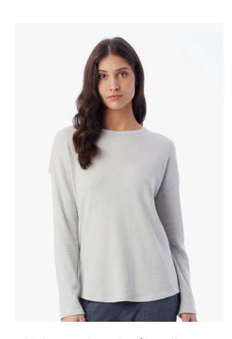
7606BQ Relaxed L/S Pullover

With knit-sweater softness, our Vintage Heavy Knit collection includes pieces perfect for year-round layering. If you've always wanted a cashmere sweater, try on our version. It'll be hard to take off.