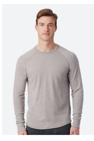
7597BQ Kick Back Pullover