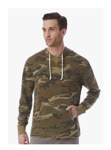
8629FH/FJ Schoolyard Hoodie

Made from our Burnout French Terry, your favorite styles are unbeatably soft with an authentically worn-in look. And since two (or three or four) are better than one, mix and match these basics for a fashion-forward look.