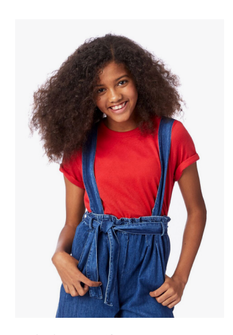
K5050BP Youth Keeper

We've shrunk our best-selling styles to fun-size silhouettes so you can give your Mini Me your favorite look, too. Everyone deserves to grow up in style.