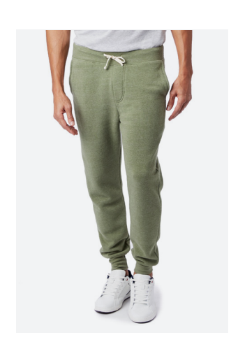
9881F2/FB The Dodgeball Pant