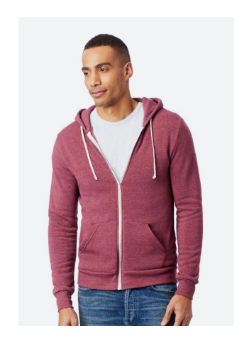
9590F2/FB Rocky Hoodie