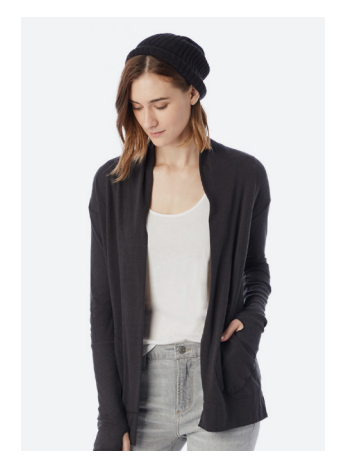
12529E1 Rib Sleeve Wrap