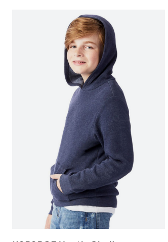
K9595GF Youth Challenger