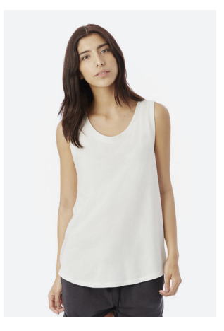
2830MR Muscle Tee