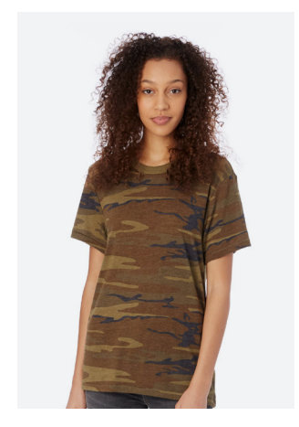
1973E1/EA/EJ Eco Crew