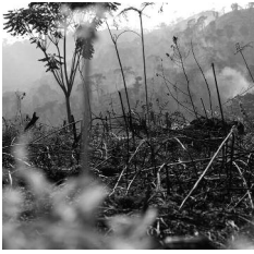
Burn scar and burnt home after a major attack targeting Batwa villages in Kahuzi-Biega National Park.