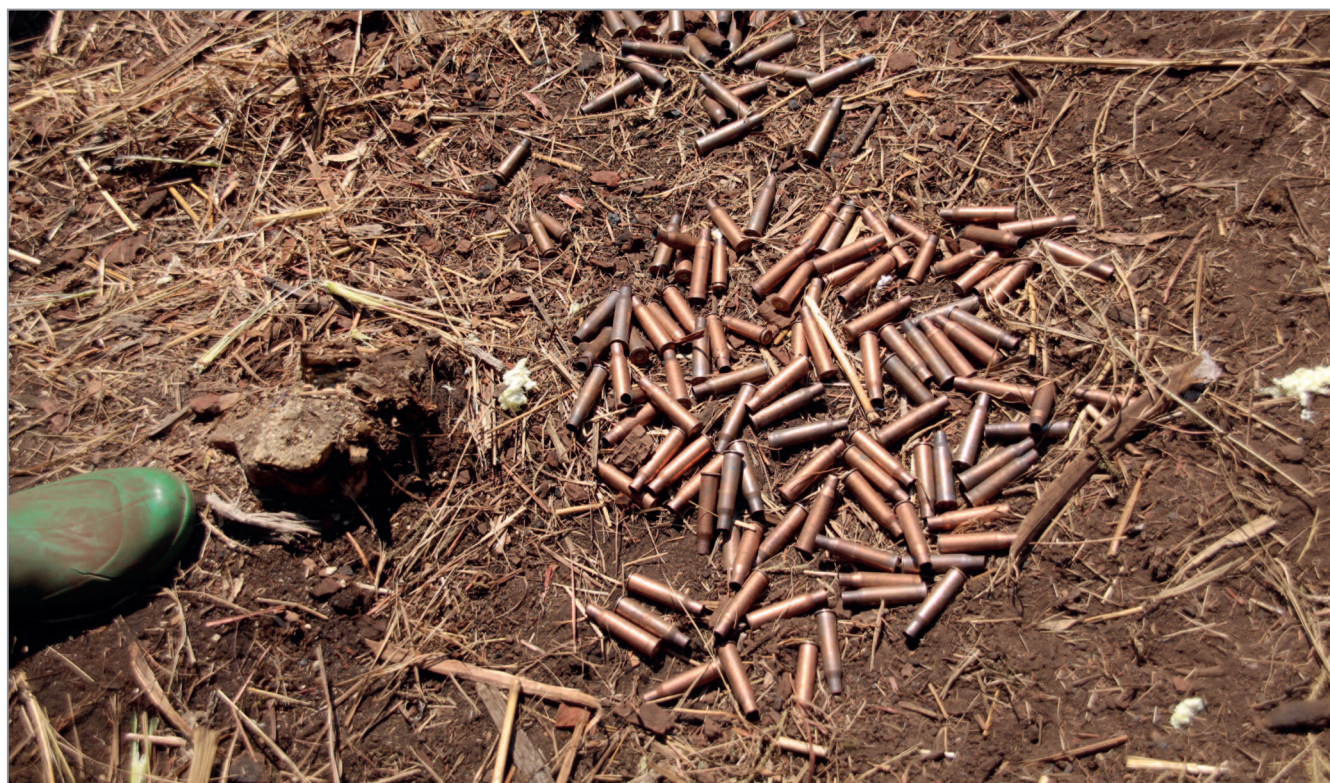
Figure 8: AK and PKM shell casings left on the ground.

As evidence was being gathered in the immediate aftermath of the 23 July 2021 attack, Batwa leaders remained concerned about the movements of park guards and soldiers in areas adjacent to Buhoyi and Bugamanda, major Batwa villages that had been spared in the more recent assault. 286 Scattered reports circulated about plans for follow-up waves of attacks.