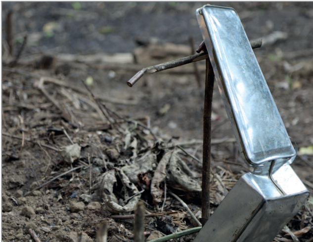
Figure 9: A makeshift headstone holding an open munitions box.

On 29 July 2021, a letter—not made public—was co-signed by 12 Congolese and international advocacy organizations and sent to the PNKB and ICCN leadership. The correspondence was forwarded by email to representatives of key international backers, including the Wildlife Conservation Society, KfW, GIZ, GFA Consulting Group, USAID, and the US Fish and Wildlife Service. 287 Every major international park supporter was made explicitly aware of the serious