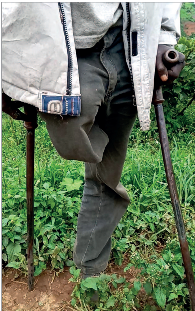
Figure 2: A man with a dismembered leg, reportedly from mortar blasts.

Importantly, according to park guards who participated in the training, 127 the use of mortars in Bugamanda came weeks after specific training conducted by foreign private military contractors, including instruction in the use of heavy weapons, was given to the Rapid Intervention Unit, which led the offensive on Bugamanda (as further detailed in below).