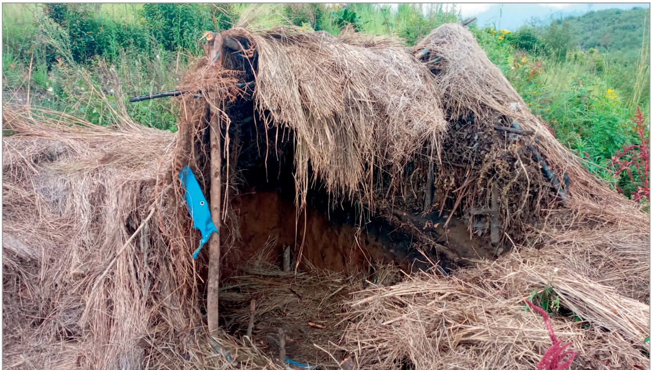
Figure 3: Remnants of a home that was burnt down in Buhoyi.

The research team also interviewed two community members who had inhabited some of the structures that were burned down and never rebuilt. One of them 141 told the research team that before the original eviction of the Batwa in the 1970s, his parents lived at the location in the