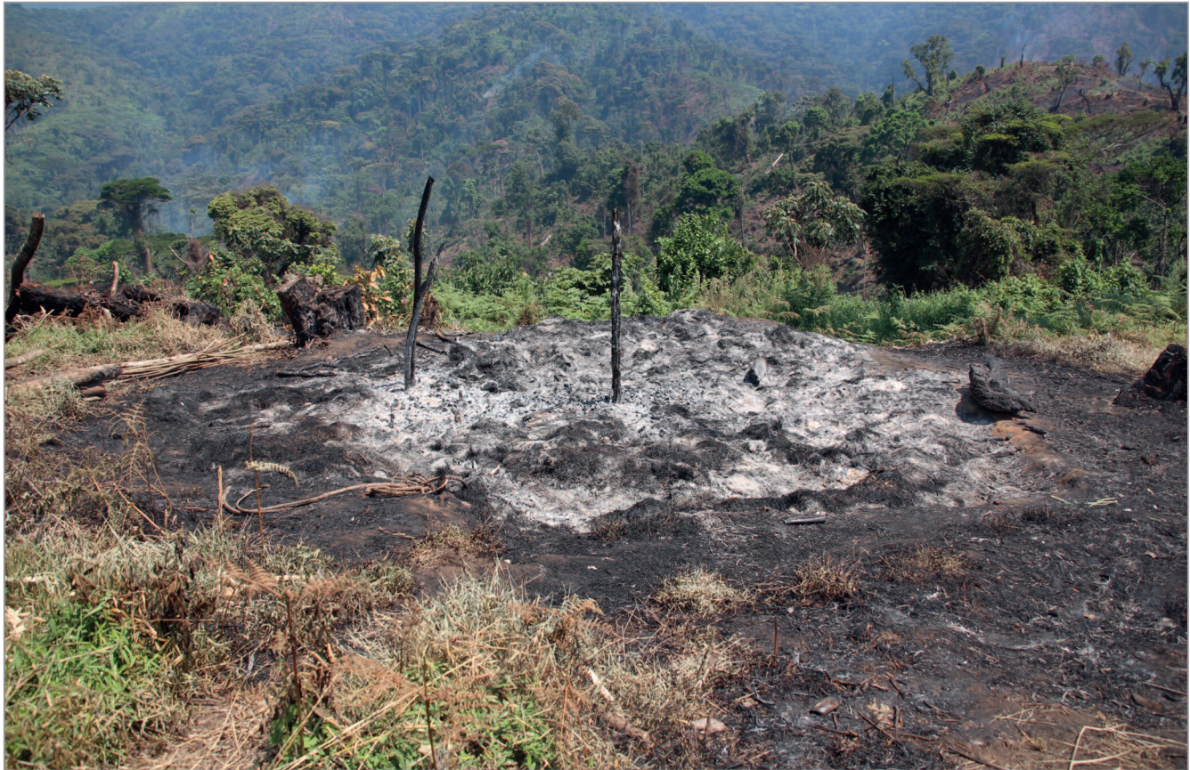
Figure 11: One of many homes burnt and destroyed in a major attack targeting Batwa villages in July 2021.

and corroborated by this report. They also did not alter their support of the PNKB.