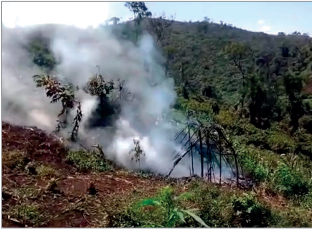
Figure 12: Screenshot from a video taken by a Mutwa community member in which Batwa homes were burnt by park guards in the wake of the July 2021 operation targeting Batwa villages.

25 August, park guards burned down a small number of homes on the rims of the village of Buhoyi (no more than five homes), threatening to return the following day to burn down the rest, although the threat did not immediately materialize. The isolated destruction of these homes was documented by a Batwa leader who photographed the burning homes. 294 Commenting on isolated acts of destruction and the park's broader strategy, the leader stated, 'It's clear. Their objective is to expel us just like they expelled our ancestors'. 295