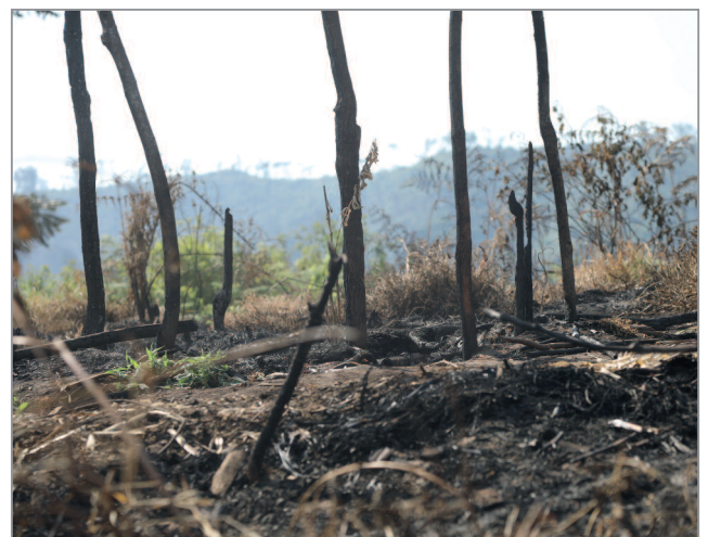
Figure 5: Burn scar and burnt home.

In total, 14 Batwa eyewitnesses and survivors of the attack on Muyange were interviewed. These interviews took place in Buhoyi, among displaced Batwa outside the park, and in the uninhabited forest surrounding the hill where Muyange formerly sat. Batwa community members interviewed during the course of this investigation recounted the 23 July 2021 violence with remarkable consistency.