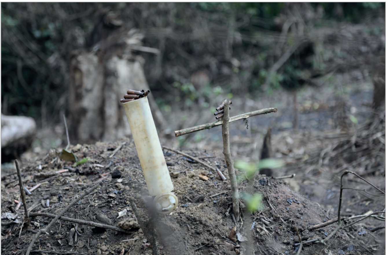
Figure 10: A headstone adorned with shell casings and an RPG propelling charge canister.

None of the PNKB’s international supporters publicly condemned the violence, nor conducted the independent investigation into the allegations called for in the letter