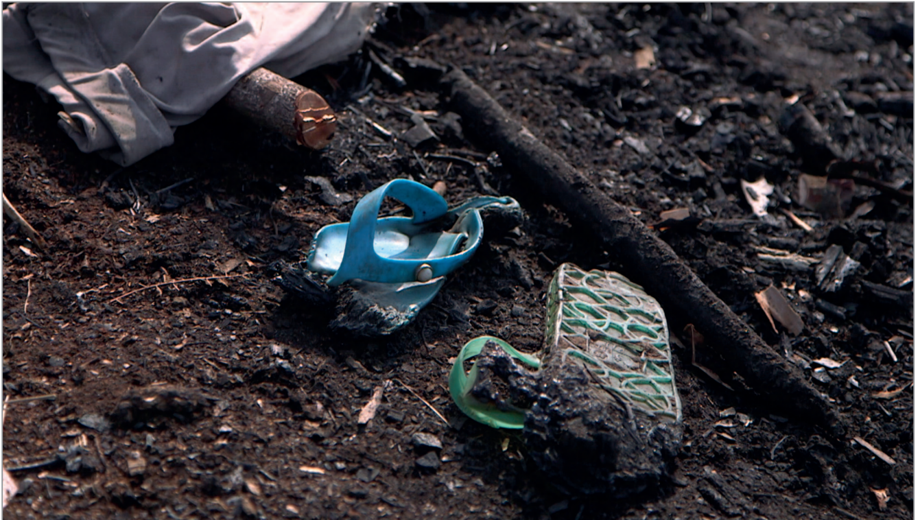
Figure 4: Sandals warped by fire lying among the ashes.

When asked whether elements of the population, especially those who were shot, were armed, the Mutwa man stated ‘We’re all civilians! We don’t have weapons, we are farmers and common people!’