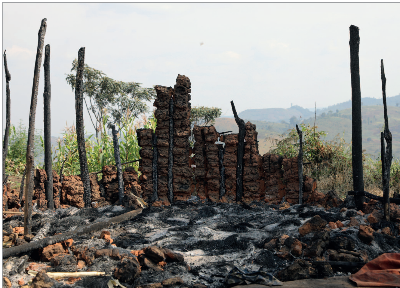
Figure 6: Ruins of a destroyed home.

The man's 15-year-old nephew told the team that 'after I watched him die, I fled out of the park. I lay down on the ground and I could hear the bomb blasts and rifle fire. I said to myself, weeping, 'Oh my god, everyone in Muyange has been killed!' 267 The teenage boy's father was the other man killed in the attack. Two days later, he returned to Muyange to discover the village destroyed and the corpse of his father. 'My father's corpse was there decaying. All I could do was weep. [...] I wanted to give him an honorable burial, but we were terrified because we heard there were still park guards and soldiers in the forest. So we quickly dug the hole and threw his body into the dirt'. 268