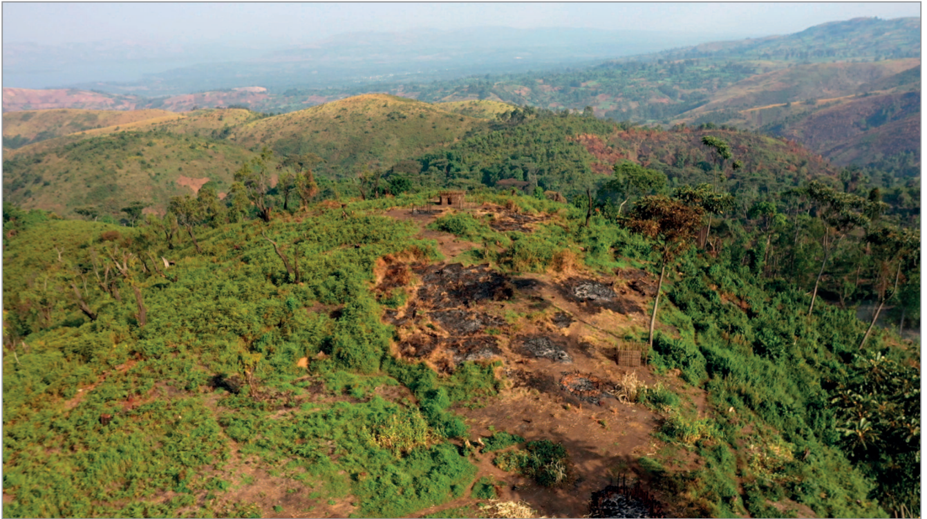
Figure 7: An aerial photo of Muyange, reduced to long patches of scorched earth.

Holding back tears, the 15-year-old boy stated: