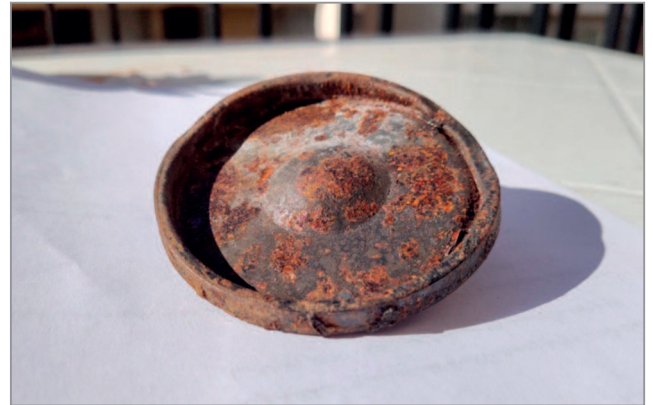
Figure 1: A metal object later identified as a 60mm mortar bomb canister cap that was recovered by the research team on a hill from which park guards reportedly shelled a Batwa village.