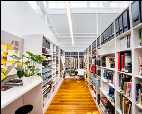
CROMWELL ST CAMPUS