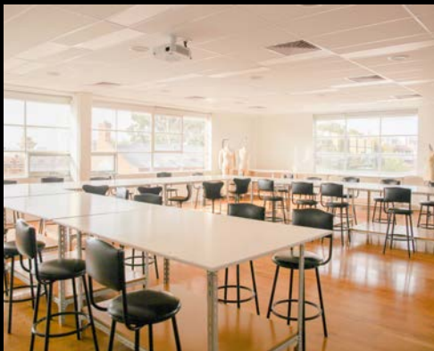
GEORGE ST CAMPUS