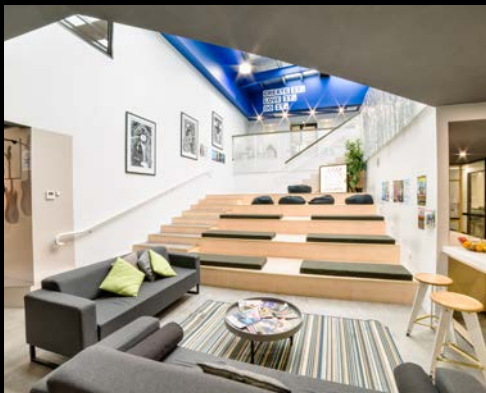
WELLINGTON ST CAMPUS