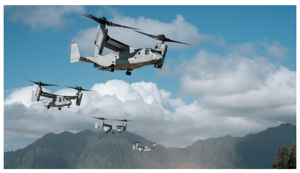
U.S. Navy MV-22 Ospreys take-off on Aug. 1, 2022 during an amphibious raid for a multinational littoral operations exercise as part of Rim of the Pacific (RIMPAC) 2022.

The National Security Strategy is finally out, 22 months into the Biden administration. But what does it actually say?