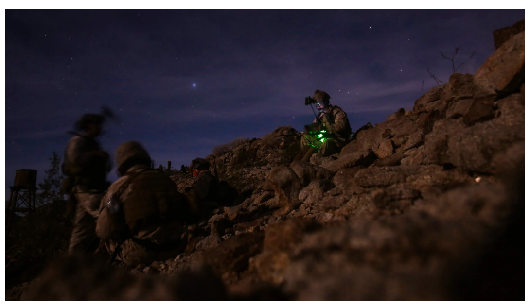
U.S. Marines with 2nd Marine Raider Battalion, Marine Raider Regiment set up communication during a night raid exercise at landing zone Dodo, Ariz., April 21, 2016.

"If it's this huge encompassing of all things, I think that actually sort of makes it harder to have an explicit and credible deterrent threat that allies and adversaries understand," she said.