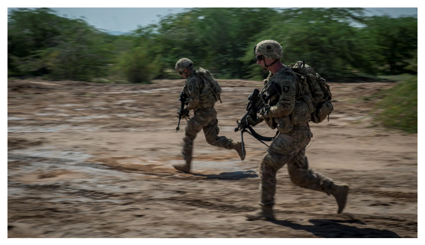
The US National Defense Strategy has finally been released, with China the focus.

The 2018 strategy "said we are worried about Russia and we're worried about [China]. And I think one of the things we did as we were going through our assessment of the security environment was actually see that those needed to be looked at a little bit differently," a Pentagon official said.