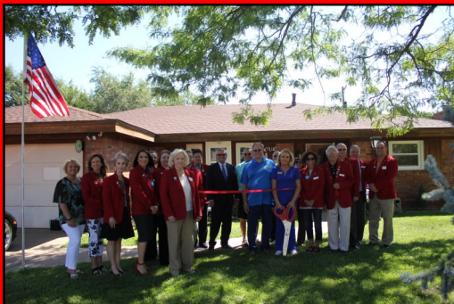
Native Spirit Spa 3415 Wayne