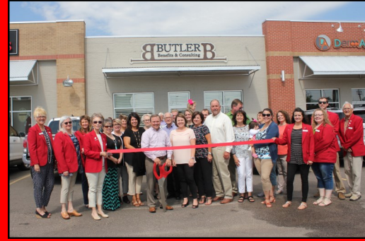
Butler Benefits & Consulting 2800 Civic Circle, Suite 200