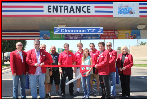
Cascades Car Wash 4650 Bell