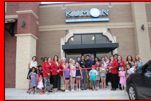
Kumon Math & Reading 8801 Buccola, Suite 400