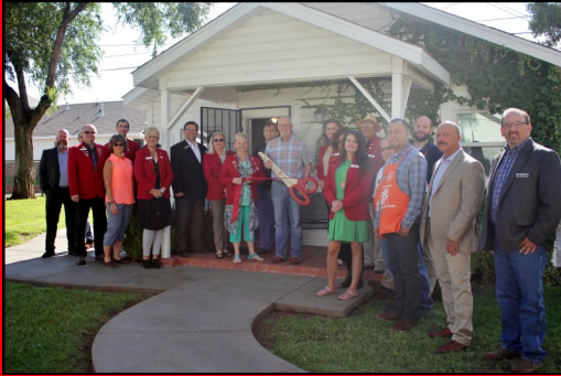
Another Chance House 205 S Jackson

Click on http://bit.ly/RibbonCuttingsAug2017 to download these pictures.