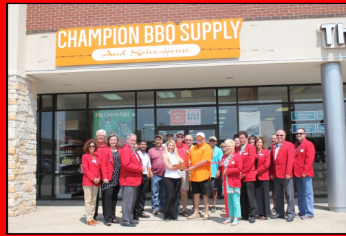
Champion BBQ Supply & Spice House 7306 SW 34th, Suite 2