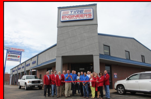
Tire Engineers 2805 Virginia Circle

Be sure to look for our Ribbon Cutting photos in the Business section of the Sunday Amarillo Globe-News.