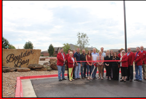
Boulder Bay Apartments 3101 SW 58th