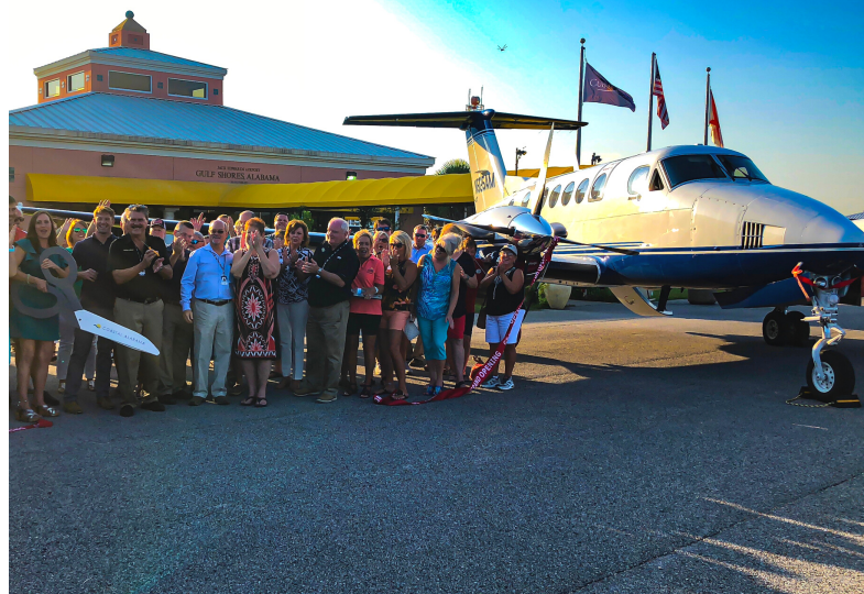
CHARTER AIR & INTENSIVE AIR CARE RIBBON CUTTING

For more details, visit our Facebook page, or contact me at penny@mygulfcoastchamber.com