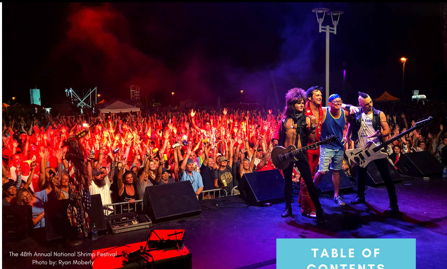
The 48th Annual National Shrimp Festival

VOLUME II • NOVEMBER 2019 SHRIMP FEST RECAP & MORE!