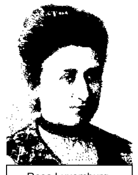
Rosa Luxemburg, socialist leader

In What Is To Be Done, Lenin claimed that trade union activity would produce only a reformist desire for "more" economic goods rather than revolutionary consciousness. Lenin may not have inaccurately predicted the nature of predominant working class consciousness during "normal" periods of capitalist development. Workers under capitalism have more to lose than just their chains. But Lenin's belief in the privilege of the "vanguard" party—that it can do whatever it wants once it takes power because it represents the workers' "true" interests—contradicts Marx's belief in working-class selfemancipation. Though an effective strategy for clandestine organization in repressive societies, Leninism's track record in democratic capitalist societies is dismal, perhaps because self-described Leninist parties are usually thoroughly authoritarian.