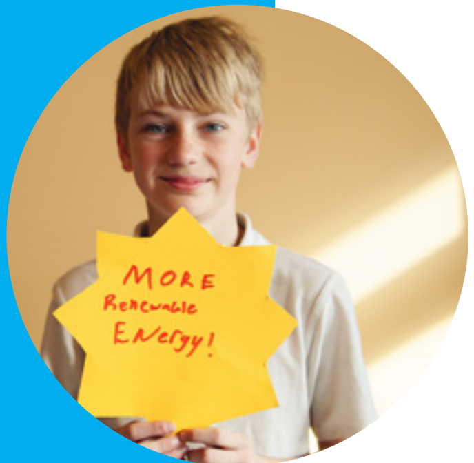
Cover image by Mik Aidt, Geelong Sustainability Location , South Geelong Primary School