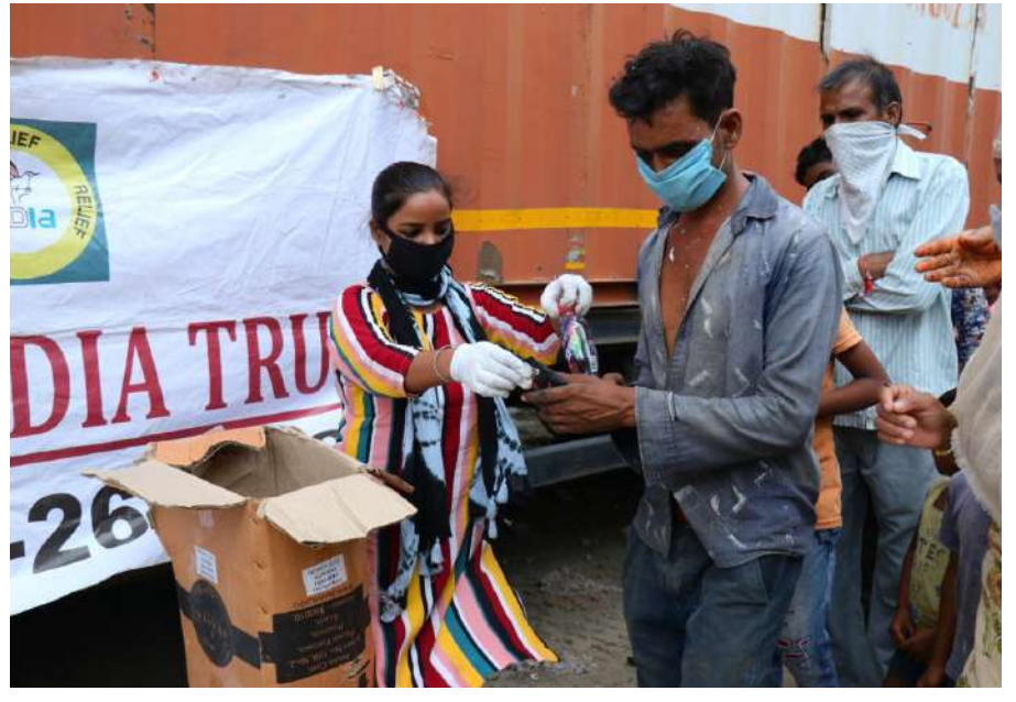
Feed a maximum number of people, Serve mankind.