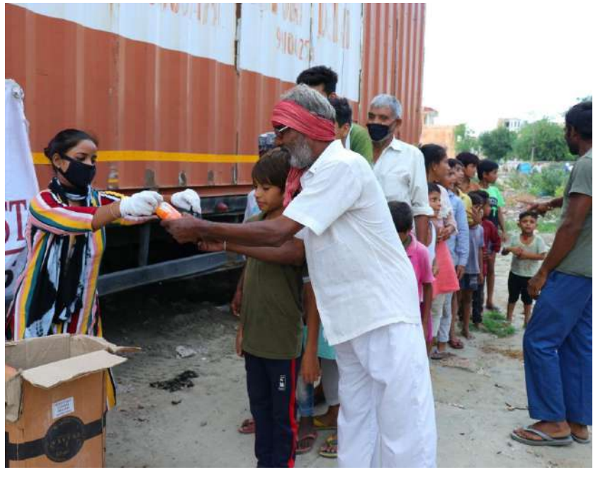
With our support, there would be no hunger in your life