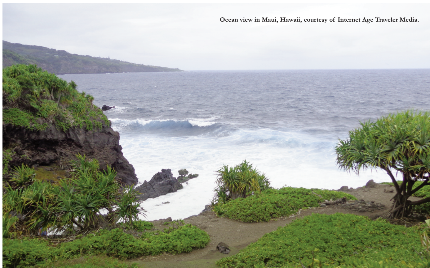
Ocean view in Maui, Hawaii, courtesy of Internet Age Traveler Media.

In April, the U.S. Supreme Court held that the federal Clean Water Act (CWA) requires the federal government to regulate some groundwater pollutants that discharge into navigable waters. 1 The CWA prohibits the addition of any pollutant from a point source to navigable waters without the appropriate permit. In this case, the Supreme Court had to determine “whether the Act ‘requires a permit when pollutants originate from a point source but are conveyed to navigable waters by a nonpoint source, here, ‘groundwater.’” 2