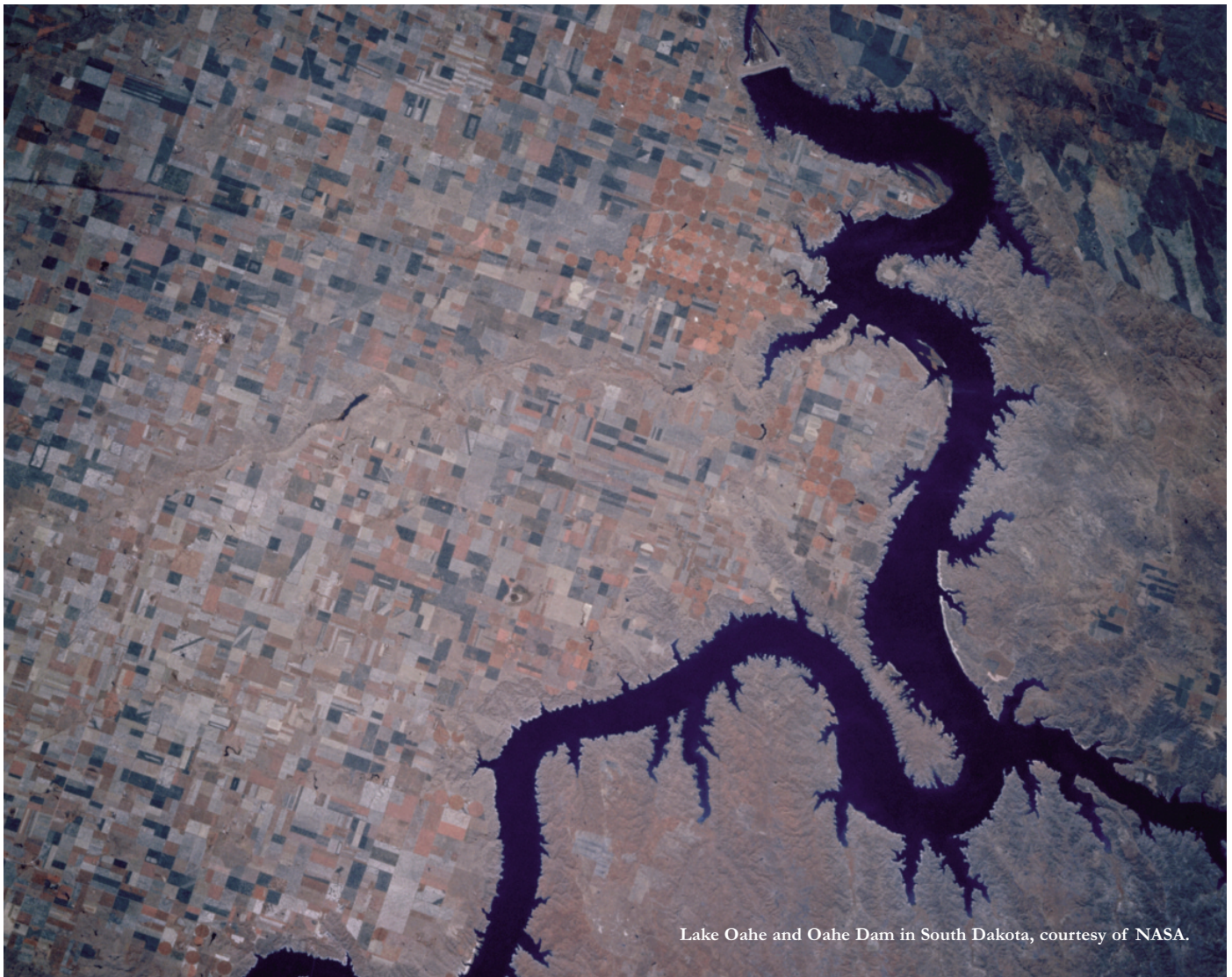
Lake Oahe and Oahe Dam in South Dakota, courtesy of NASA.