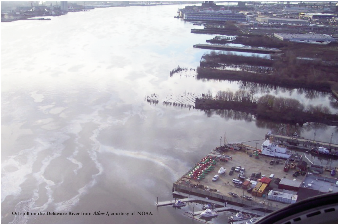
Oil spill on the Delaware River from Athos I , courtesy of NOAA.

In the home stretch of a nearly 2,000-mile journey, the oil tanker Athos I struck an abandoned anchor resting in the riverbed, causing 264,000 gallons of crude oil to flood the Delaware River. 2 The U.S. Supreme Court recently ruled on liability for the 2004 oil spill, providing some clarity to maritime contract law. In a 7-2 opinion, the Court held that the plain language of the parties' contract created a guarantee that the tanker would safely dock in New Jersey. The Court ruled that one of the parties in the case, CITGO Asphalt Refining Co. (CARCO), breached its contract when the oil tanker crashed into the anchor, preventing it from safely reaching the docking site, and, therefore, must pay the cleanup costs associated with the spill.