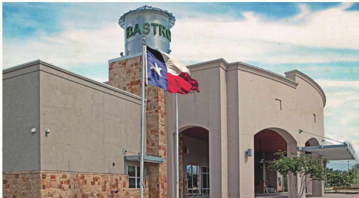
Pictured Above: Bastrop Convention & Exhibit Center