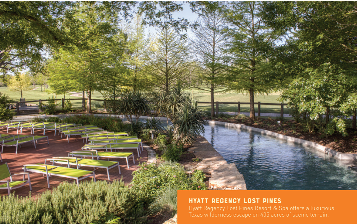
HYATT REGENCY LOST PINES Hyatt Regency Lost Pines Resort & Spa offers a luxurious Texas wilderness escape on 405 acres of scenic terrain.

The Reserve at Greenleaf 408 Laura Lane Bastrop, TX 78602 512-988-9928