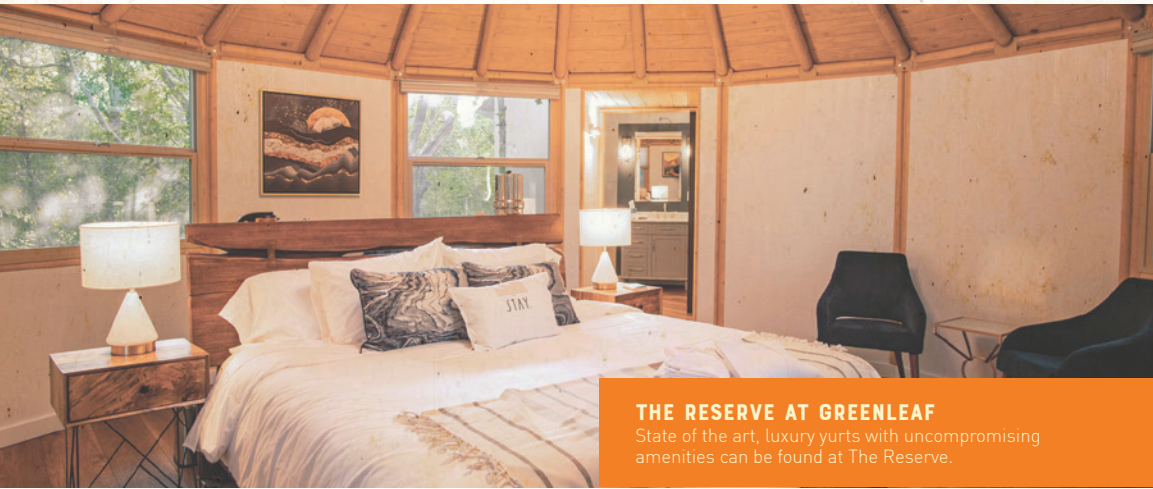
THE RESERVE AT GREENLEAF State of the art, luxury yurts with uncompromising amenities can be found at The Reserve.