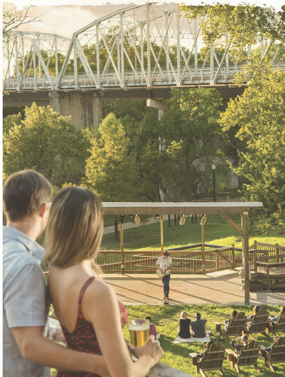
Pictured Above: Bastrop Music Festival

Help us honor America's heroes at Bastrop's Veterans Day Cruise-in & Car Show in Downtown Bastrop. We'll start with a "cruise-in" on Friday night and a Saturday car show with music and a Veterans Tribute ceremony honoring our military heroes.