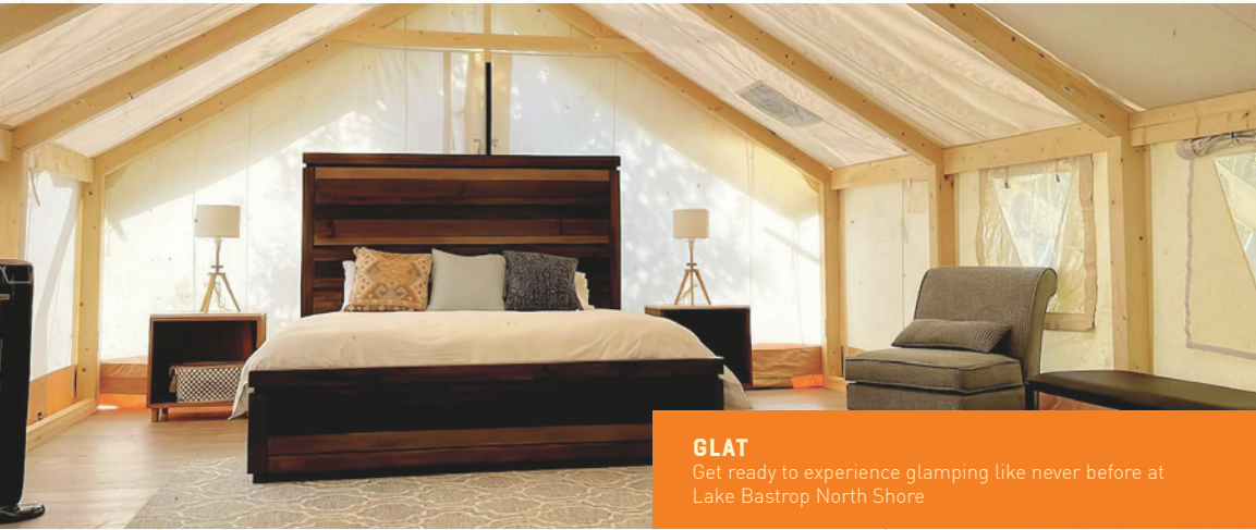
GLAT Get ready to experience glamping like never before at Lake Bastrop North Shore