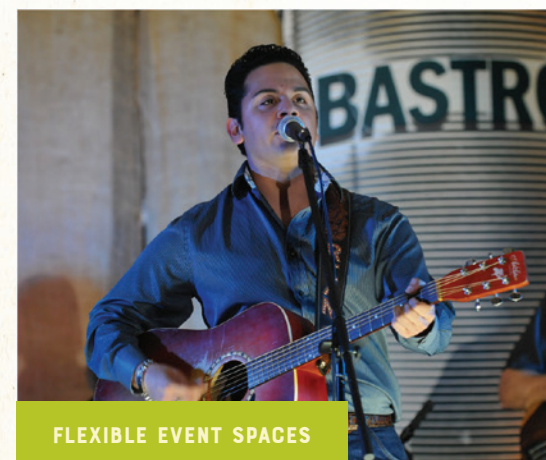
FLEXIBLE EVENT SPACES