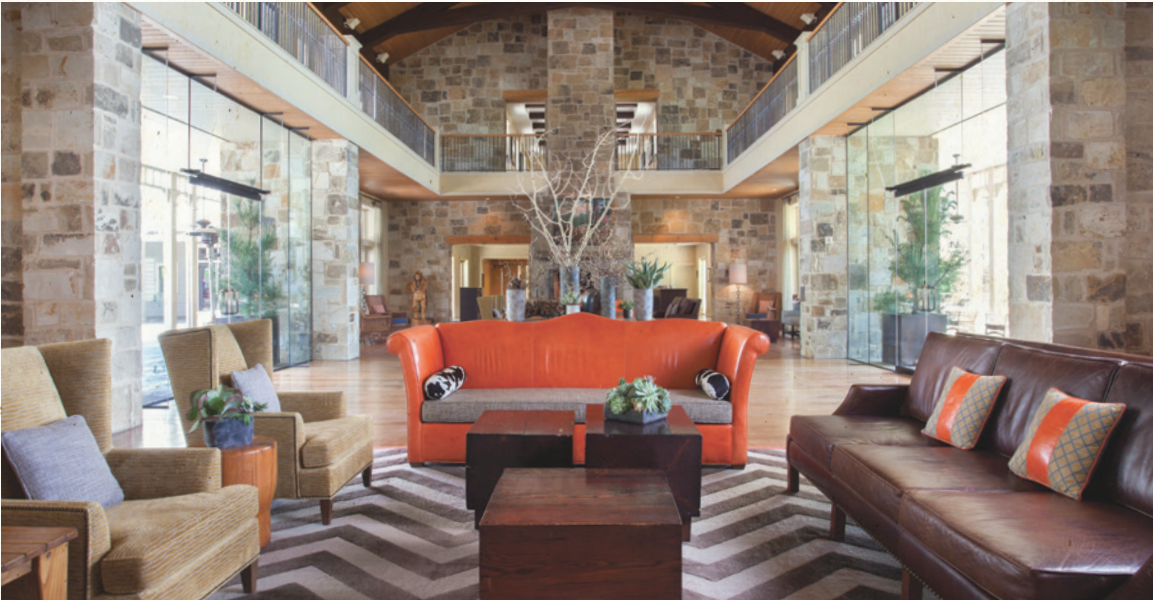
Pictured Above: Hyatt Regency Lost Pines

At the end of the day, your team will love all the ways to play in Bastrop. It checks off all the other boxes, too - huge event spaces and tons of accommodations ranging from luxurious to rustic. Really the only thing bigger cities have on Bastrop is a bigger name.