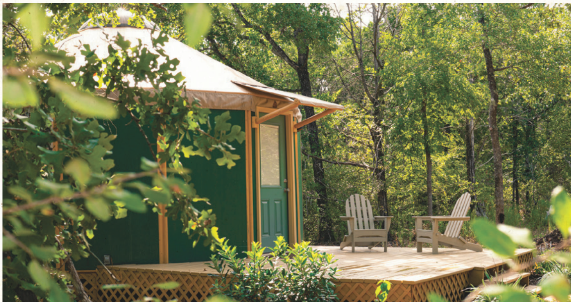
Pictured Above: The Reserve at Greenleaf