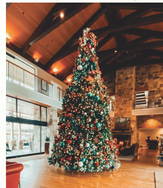
Pictured Above: Hyatt Regency Lost Pines

Ring in the new year at the Hyatt Regency Lost Pines Resort & Spa with a huge family-friendly celebration. Stay at the resort and enjoy a festive buffet, tractor rides, games and prizes, a family dance club with a DJ and, of course, fireworks.