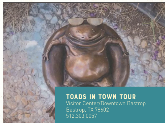
TOADS IN TOWN TOUR Visitor Center/Downtown Bastrop Bastrop, TX 78602 512.303.0057

One thing to remember, be sure to give yourself enough time to take it all in. Our listings here will help point you in the right direction.