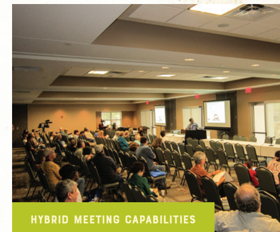
HYBRID MEETING CAPABILITIES