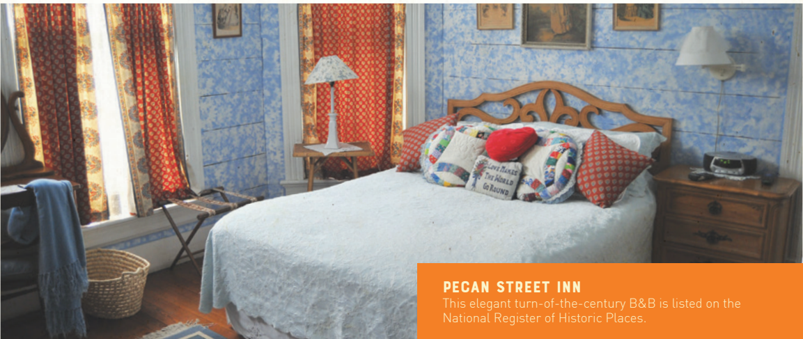
PECAN STREET INN This elegant turn-of-the-century B&B is listed on the National Register of Historic Places.