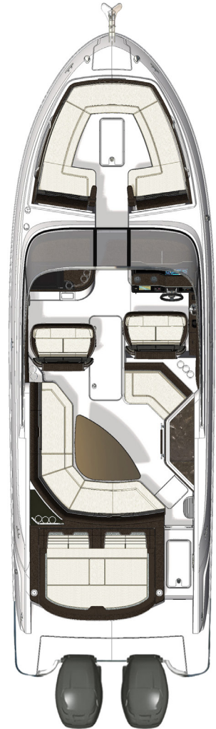
Standard Seating Plan