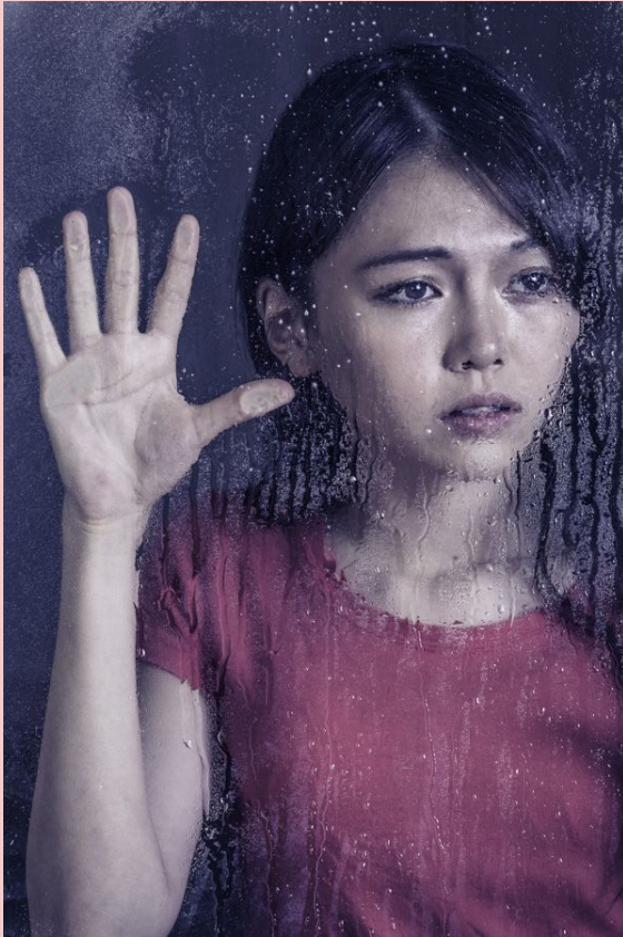
Woman Behind a Window

Short Description of Photo: Woman behind a window on a rainy day, Taipei – 2015.