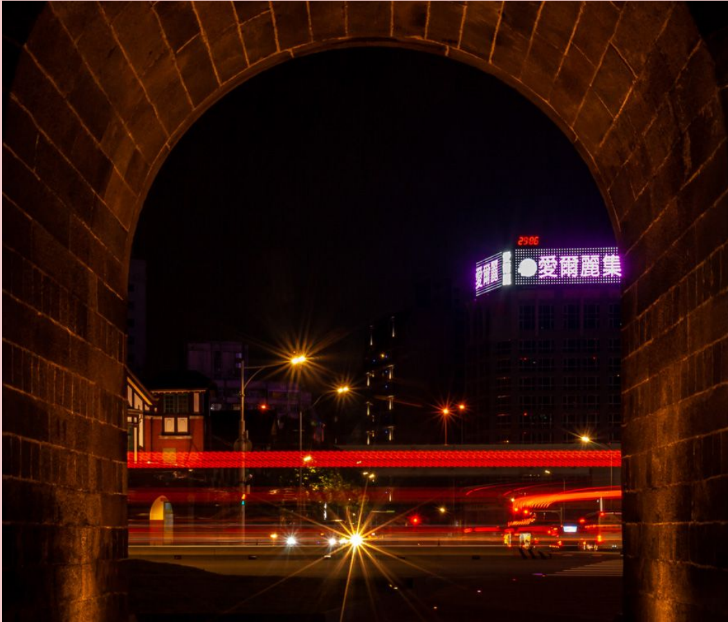
North Gate, Taipei

Short Description of Photo: Taken at night, looking through the North Gate towards Yenping North Road, Taipei - 2018.