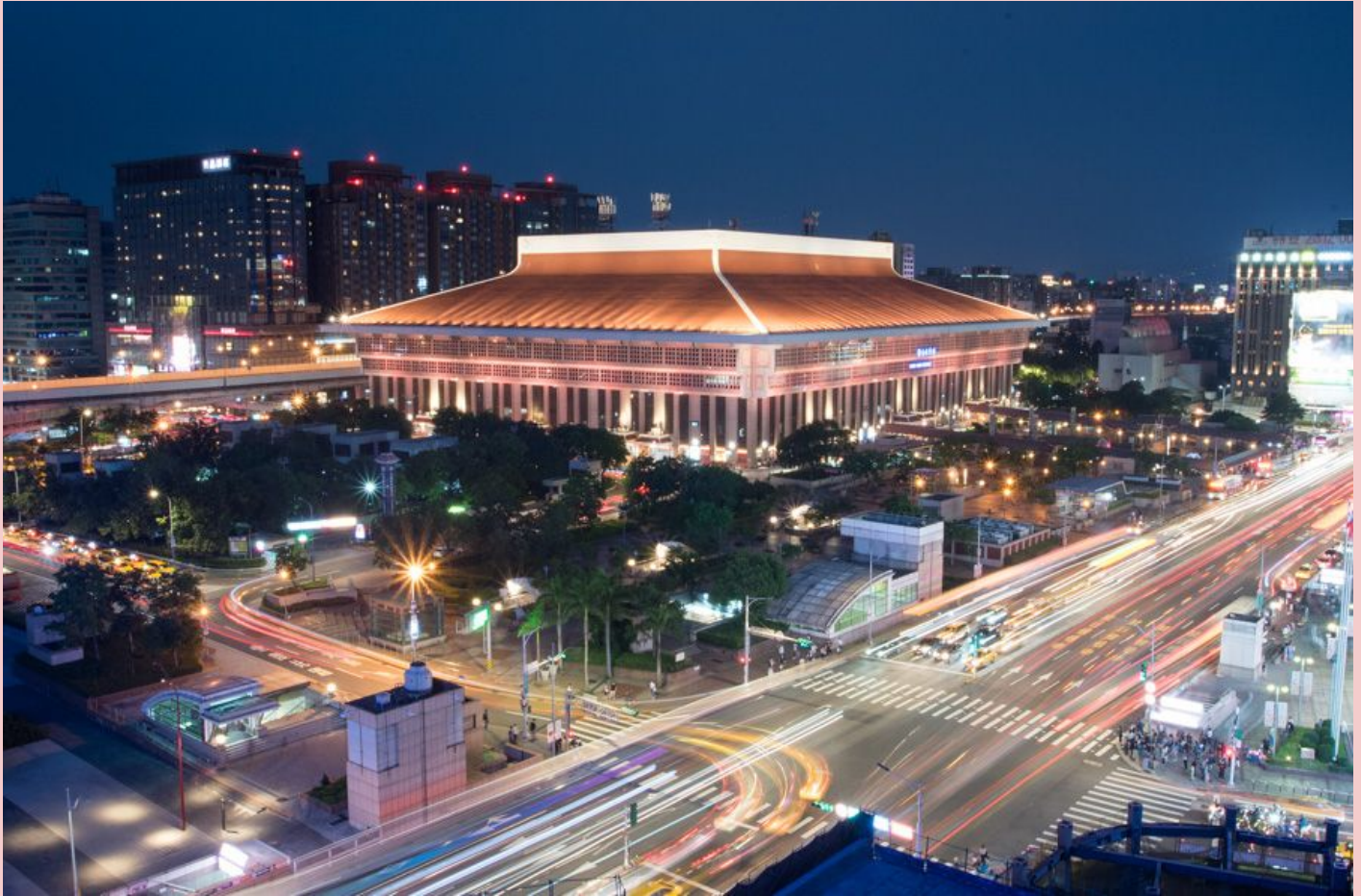
The Qi of Taipei

Short Description of Photo: Long exposure overlooking Main Station, Taipei - 2018.