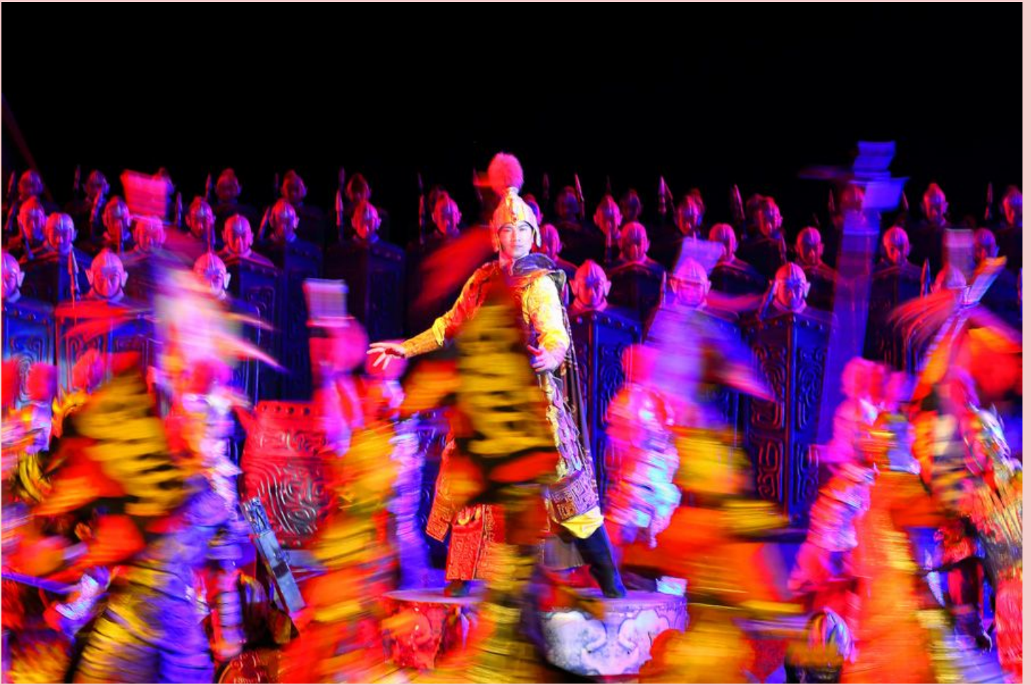
General Red performed at Xi'an

Short Description of Photo: Long exposure at Tang Paradise show, Xi'an, China - 2015.