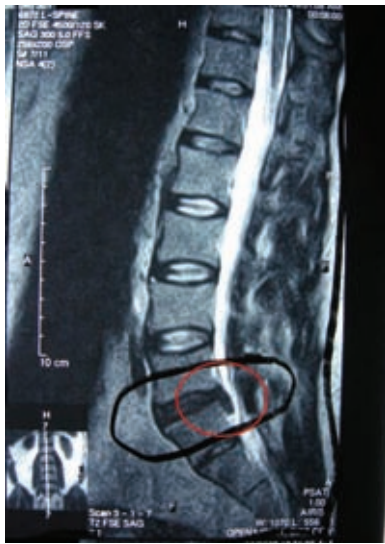
Figure 1a: Pre-treatment MRI (02/02/05)