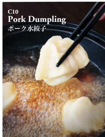
C10 Pork Dumpling ポーク水餃子