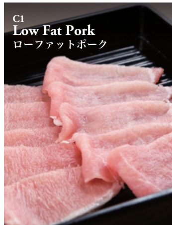
C1 Low Fat Pork ローファットポーク