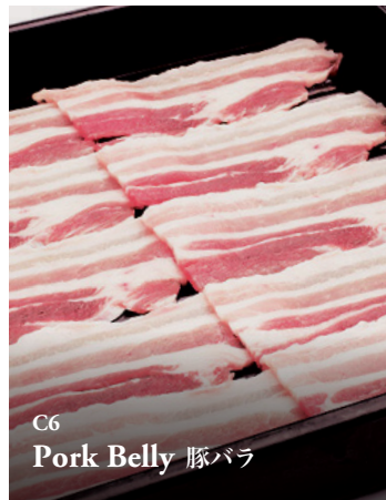
C6 Pork Belly 豚バラ