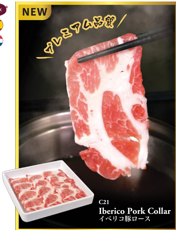
C21 Iberico Pork Collar イベリコ豚ロース