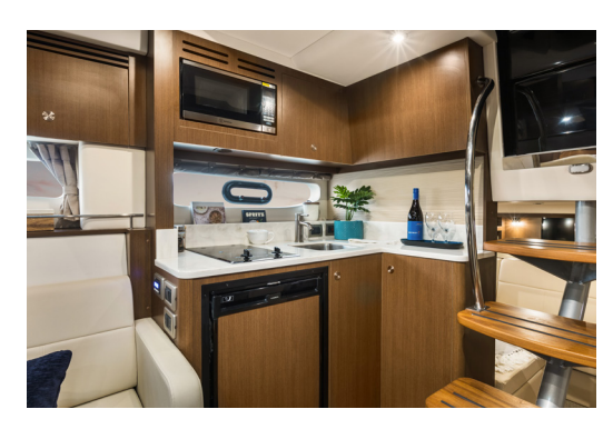
From the deluxe galley with ample storage to the solid-surface counter tops and recessed stove, the Sundancer 350 Coupe is fit for a top chef.