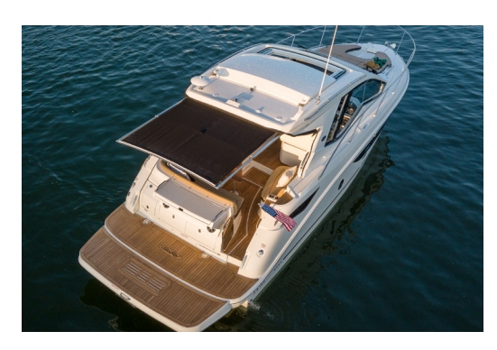
An optional cockpit retractable sunshade and transom Gourmet Station make for an inviting and comfortable social zone.