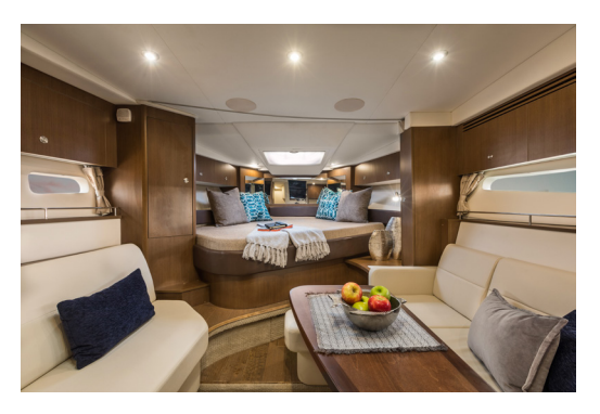
The 350's V-berth comes fully equipped so you can rest easy. The double bed is outfitted with neutral sheets as well as a luxurious memory-foam mattress.