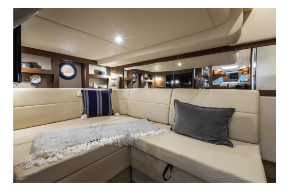
The luxurious, wood-trimmed mid-berth includes convertible twin beds that convert to a double berth w/slide-out base & dedicated filler cushions. (Shown with optional mid-stateroom L-shaped seating layout.)