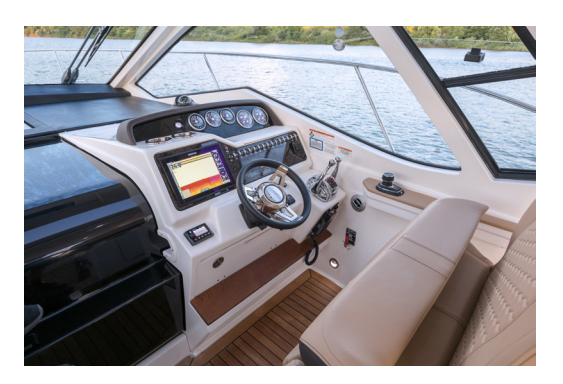
The well-designed, tiered helm station features standard SmartCraft® diagnostics and VHF Radio plus plenty of room for an optional Digital Dash w/ 9" or 12" Simrad® 4G Radar/Chartplotter.