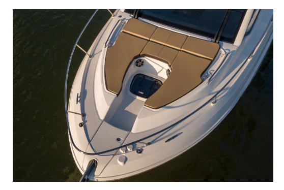
The Coupe foredeck features an enhanced bow seating configuration, adjustable & articulating backrest, cupholders and integral speakers.

Regardless of your destination, this spirited performer will get you there with enough class and fashionable flair to satisfy the most demanding guest. The 350 delivers refined luxury with a contoured Coupe fiberglass hardtop, ingenious Coupe foredeck seating, ample cockpit seating and amenities galore. The helm is designed to seamlessly integrate a range of standard and optional navigational gear, and eases control of the MerCruiser® engines or the optional Axius® propulsion system