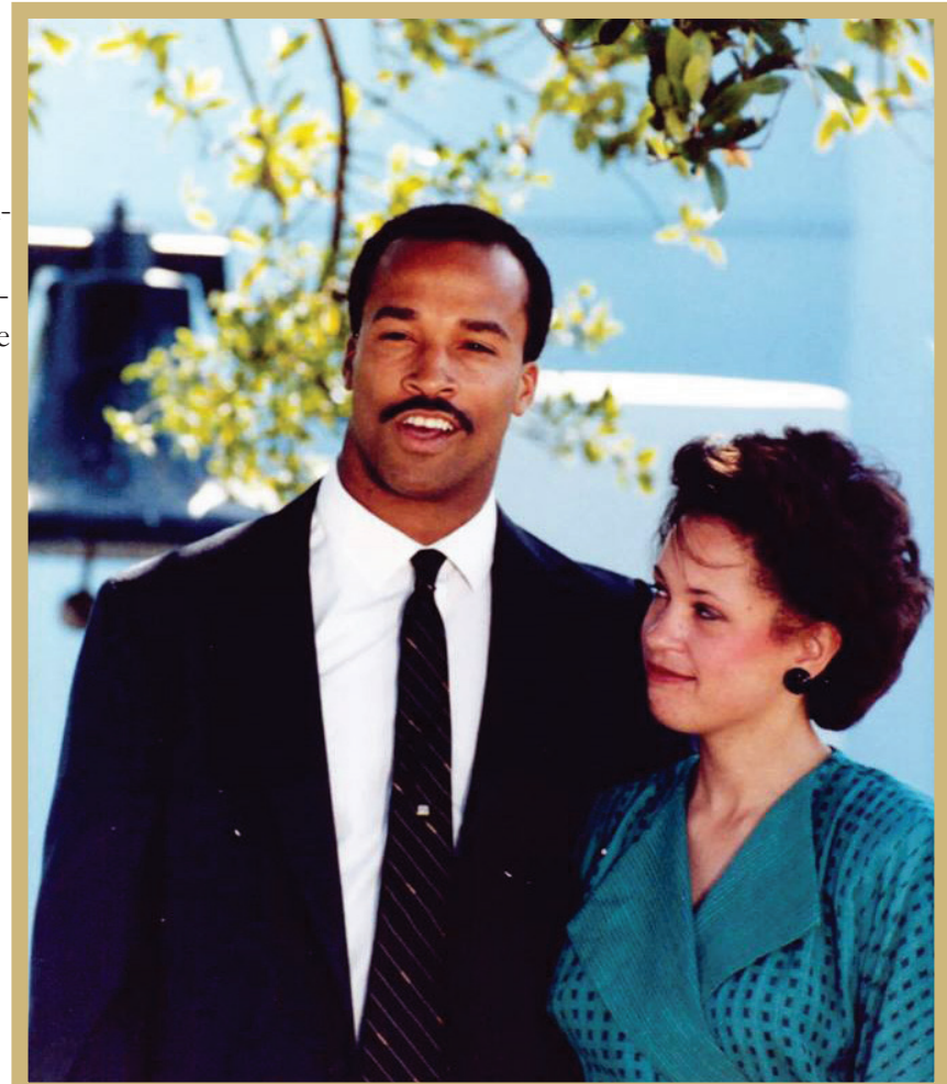
The Bells through the years – a 30th anniversary dinner in 2014, and a scene from the United Way commercial in 1984