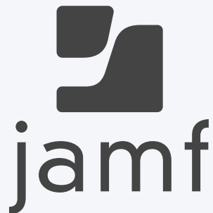
ONE COLOR STACKED CORPORATE LOGO