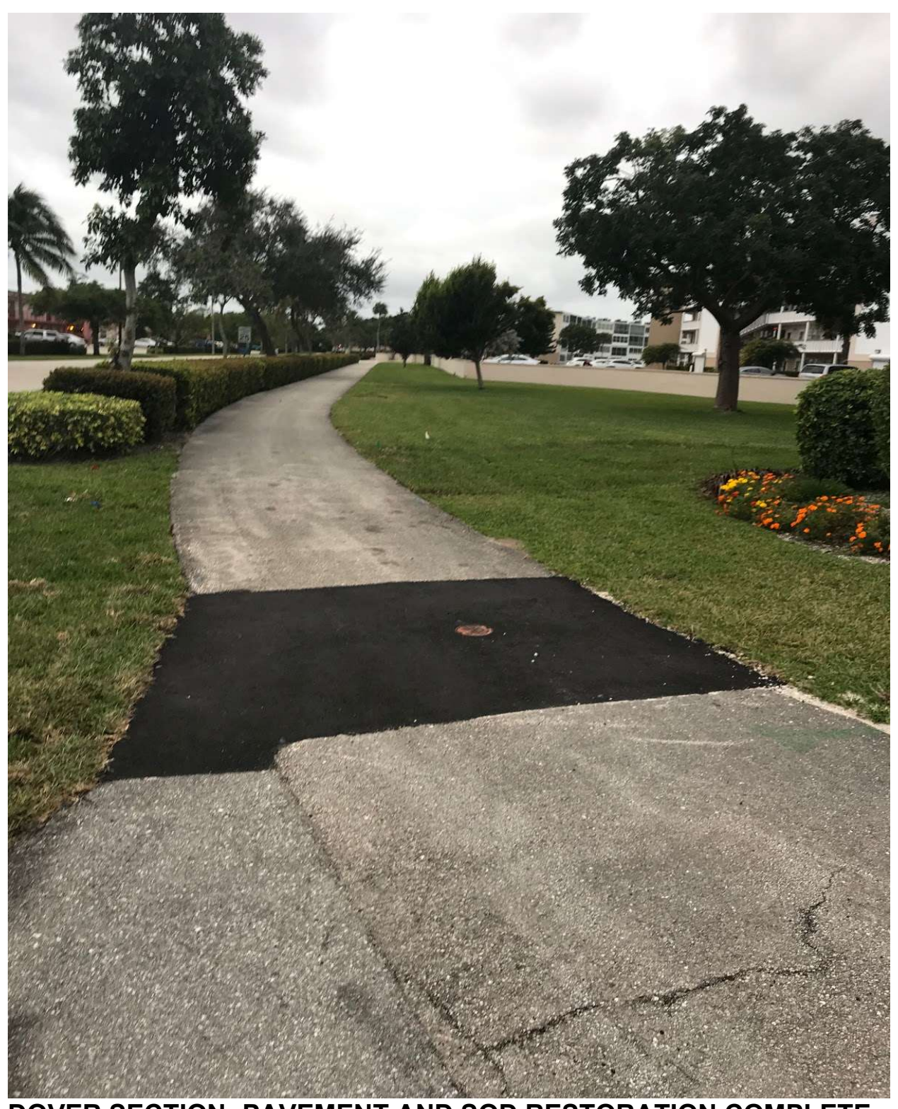
DOVER SECTION- PAVEMENT AND SOD RESTORATION COMPLETE.