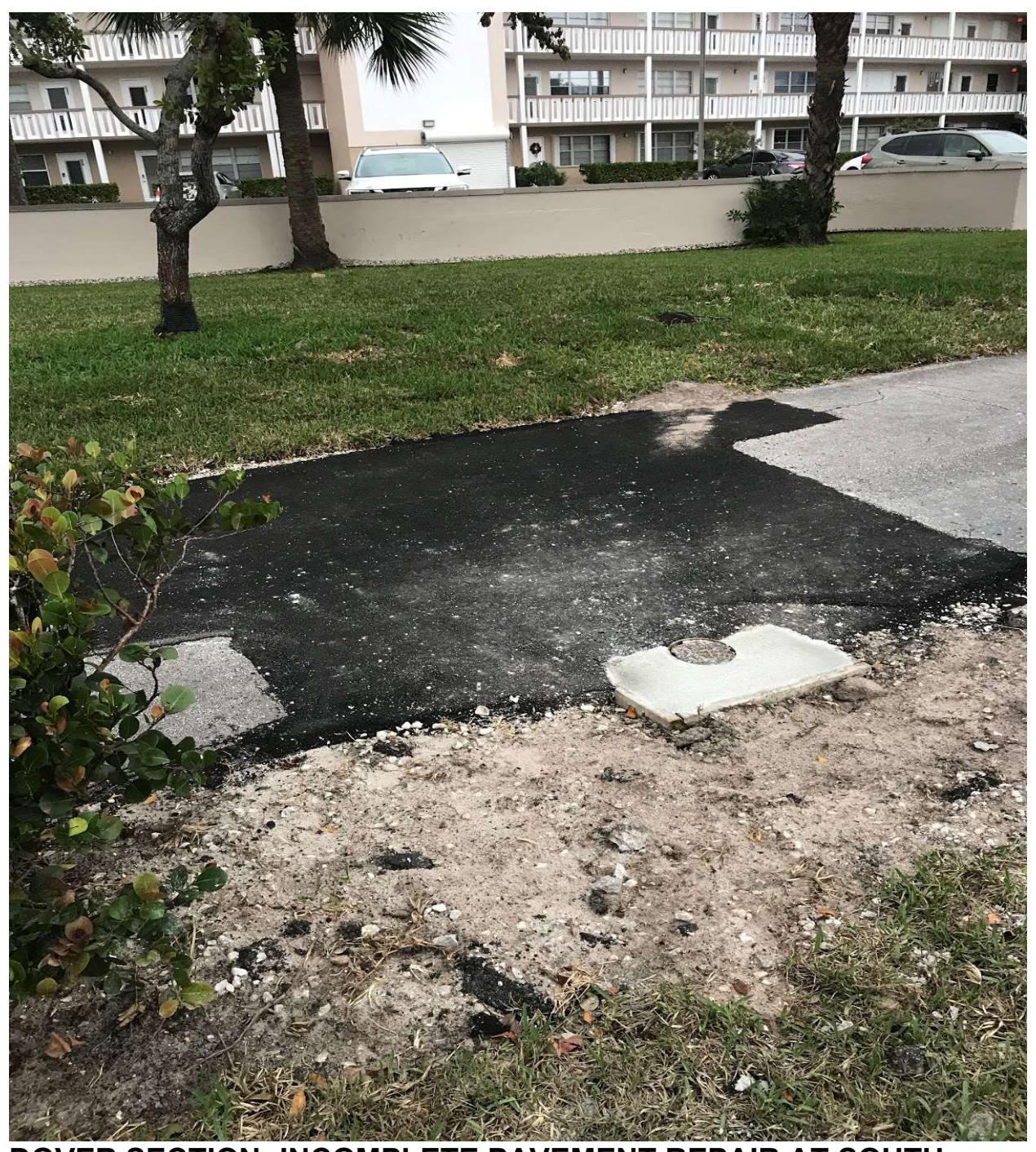
DOVER SECTION- INCOMPLETE PAVEMENT REPAIR AT SOUTH DRIVE WALKWAY. ADDED TO PUNCH LIST.