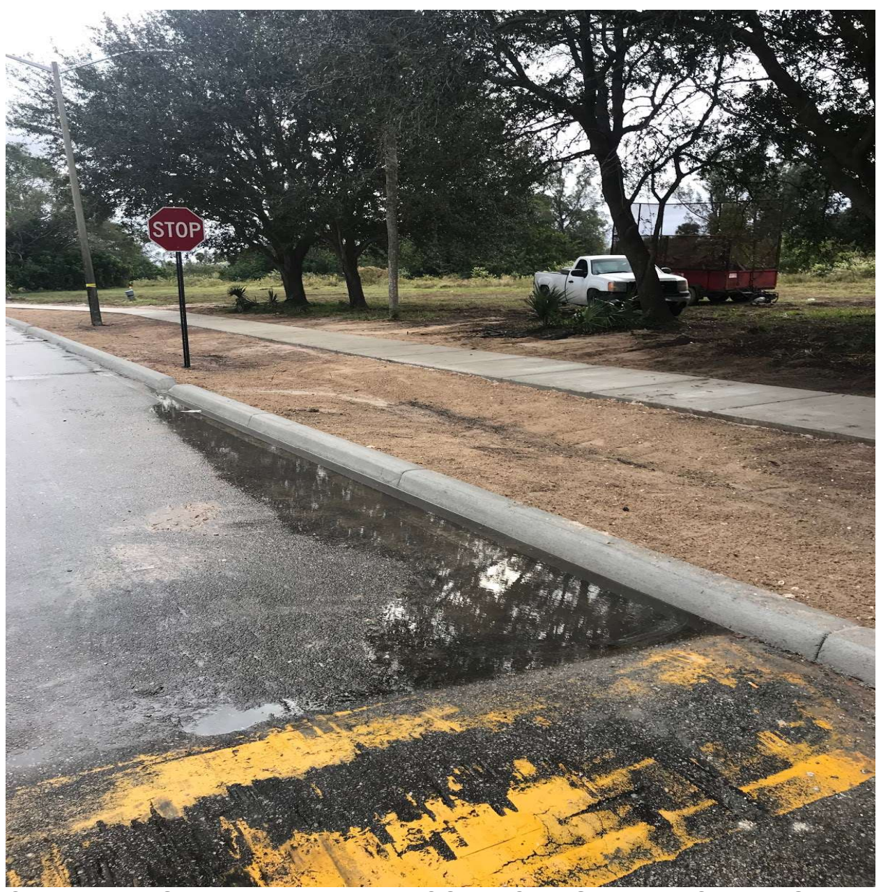
CENTURY BOULEVARD- WATER COLLECTING AT JUNCTURE OF NEW CURB AND SPEED BUMP. THIS WILL BE ADDRESSED BY AN ADDITIONAL CURB CUT. ROADWAY STRIPING AND SPEED BUMPS WILL BE PAINTED AFTER PROJECT IS COMPLETE.