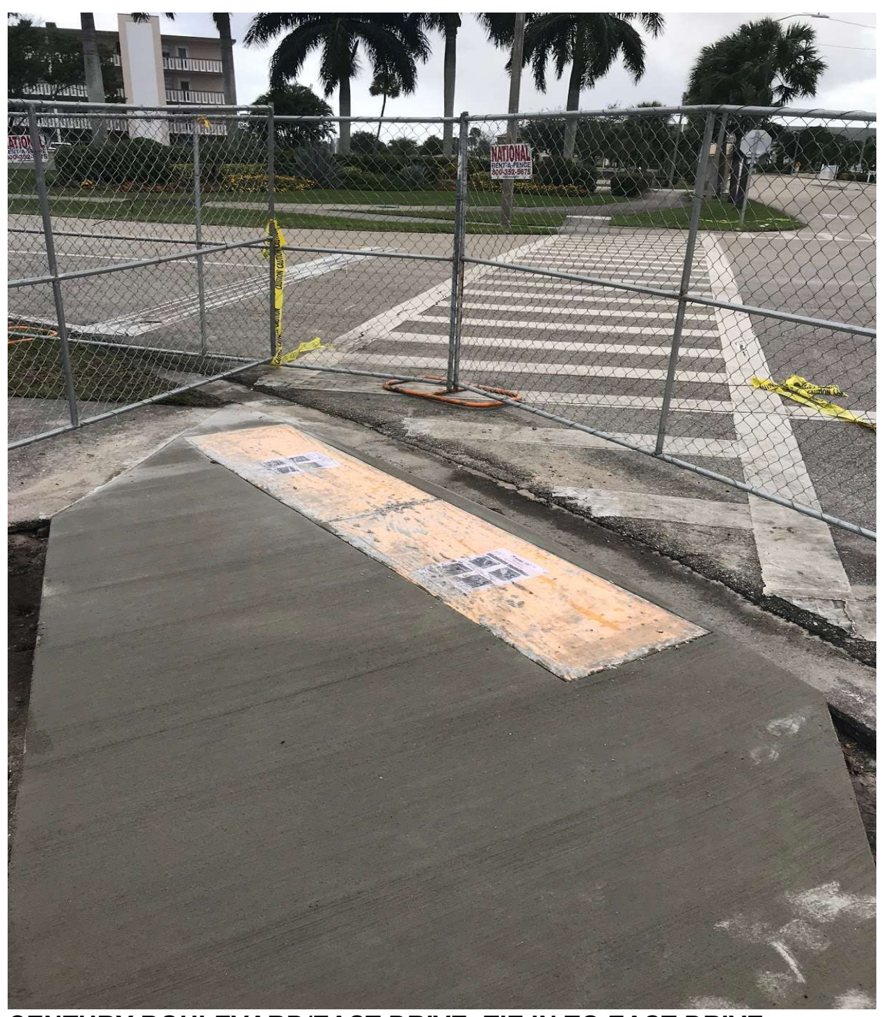
CENTURY BOULEVARD/EAST DRIVE- TIE IN TO EAST DRIVE WALKWAY AND CROSSWALK COMPLETE.