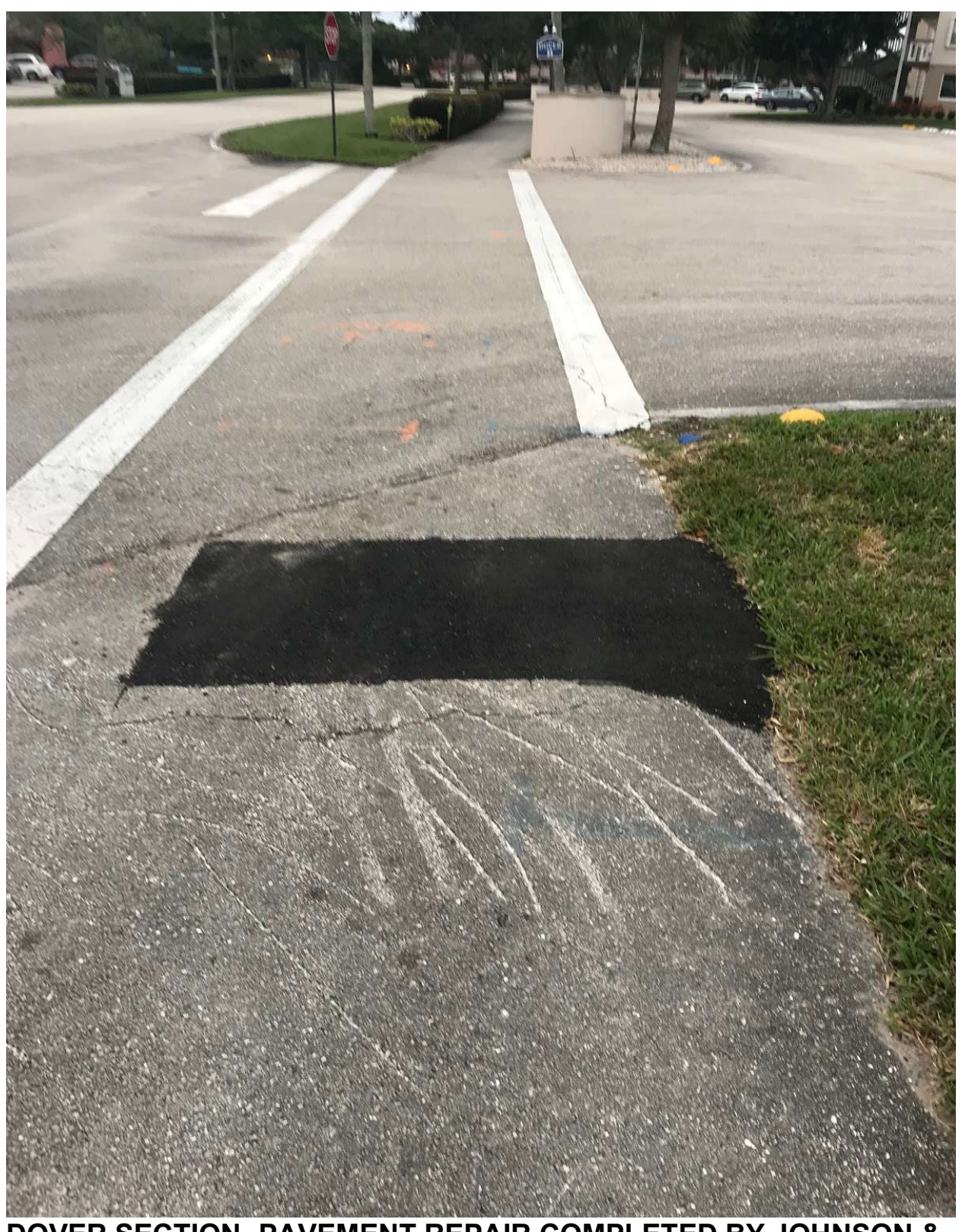
DOVER SECTION- PAVEMENT REPAIR COMPLETED BY JOHNSON & DAVIS AT SOUTH DRIVE WALKWAY.