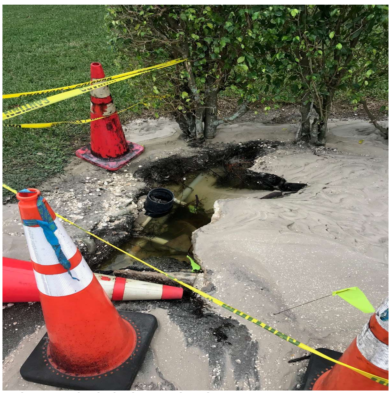
EASTHAMPTON SECTION- IRRIGATION LEAK WILL BE REPAIRED BY SEACREST SERVICES TODAY.