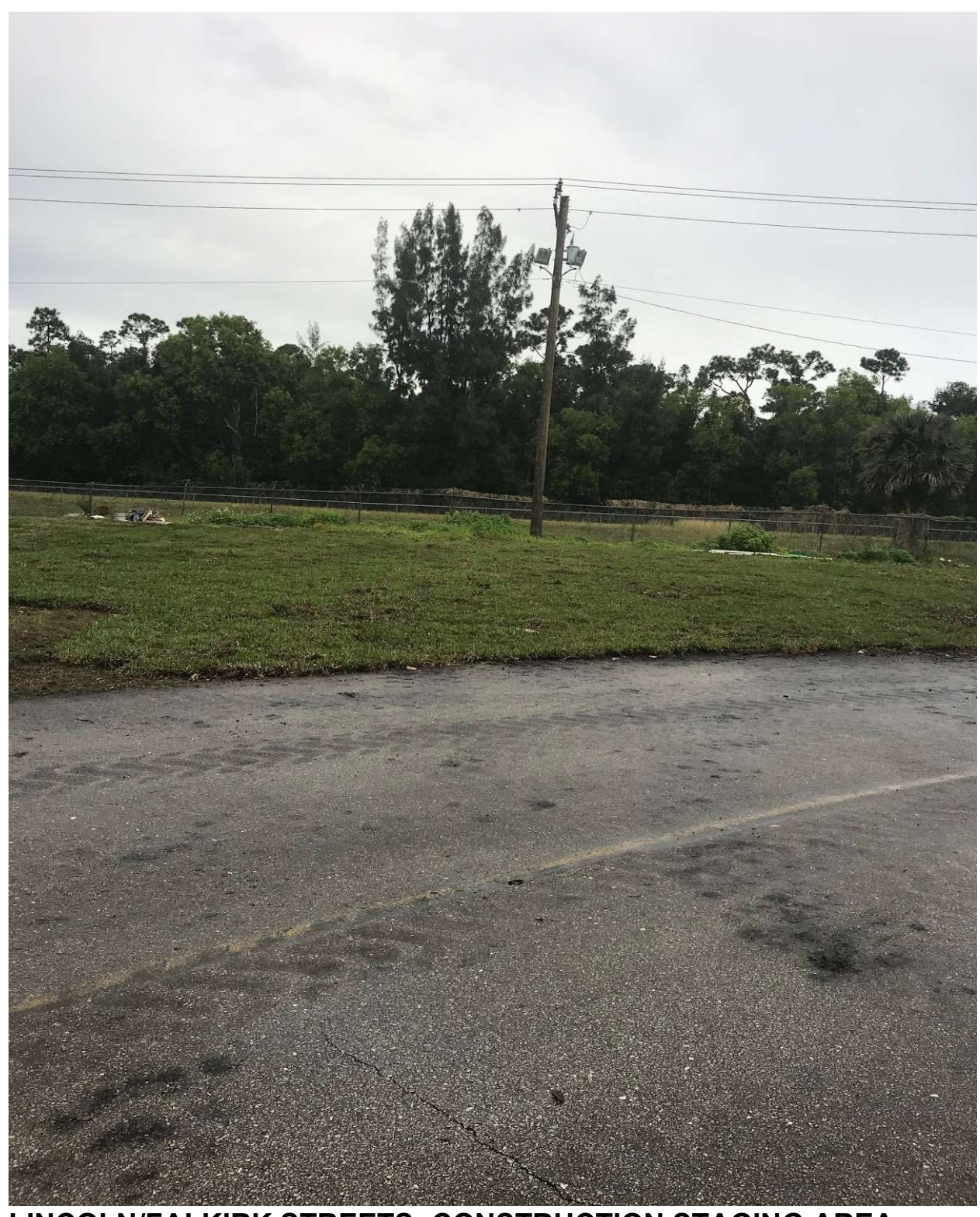
LINCOLN/FALKIRK STREETS- CONSTRUCTION STAGING AREA VACATED AND RE-SODDED BY JOHNSON & DAVIS CONSTRUCTION.