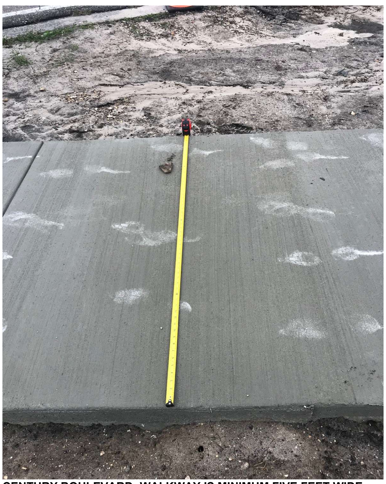
CENTURY BOULEVARD- WALKWAY IS MINIMUM FIVE FEET WIDE, AS PER ENGINEER'S SPECIFICATIONS.