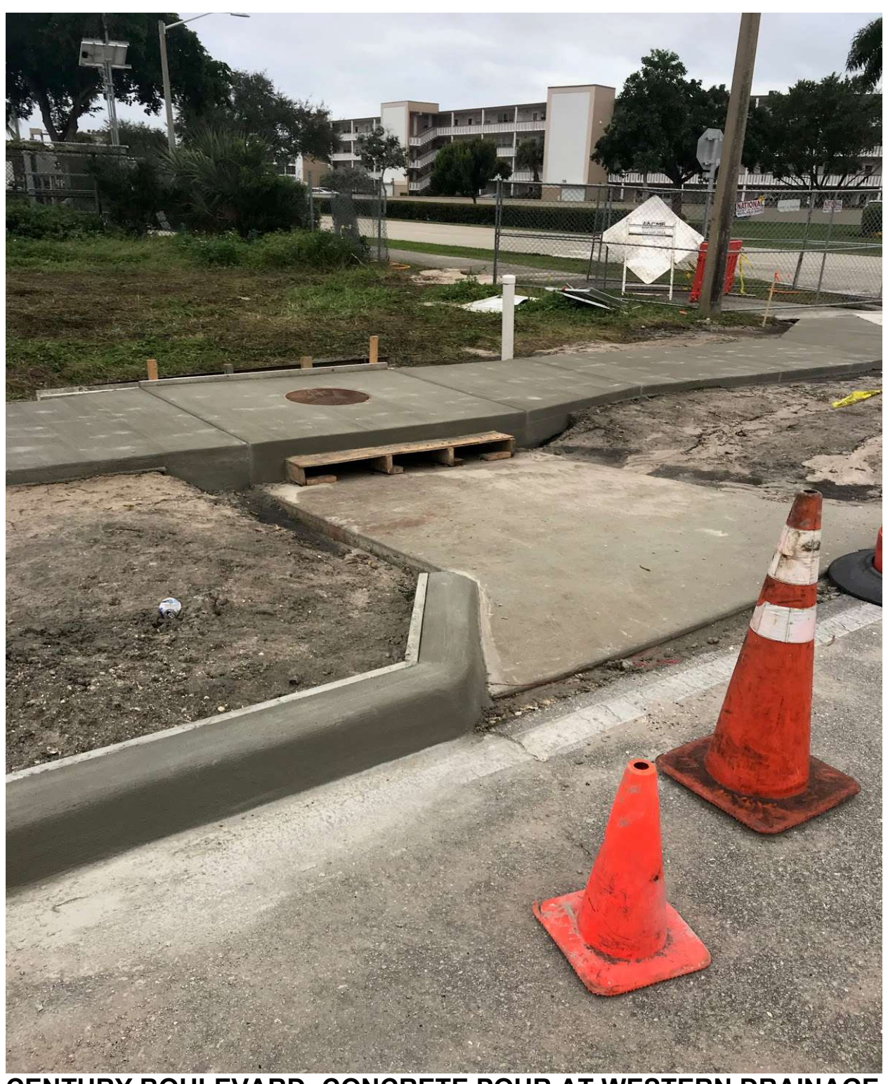
CENTURY BOULEVARD- CONCRETE POUR AT WESTERN DRAINAGE FLUME COMPLETE.