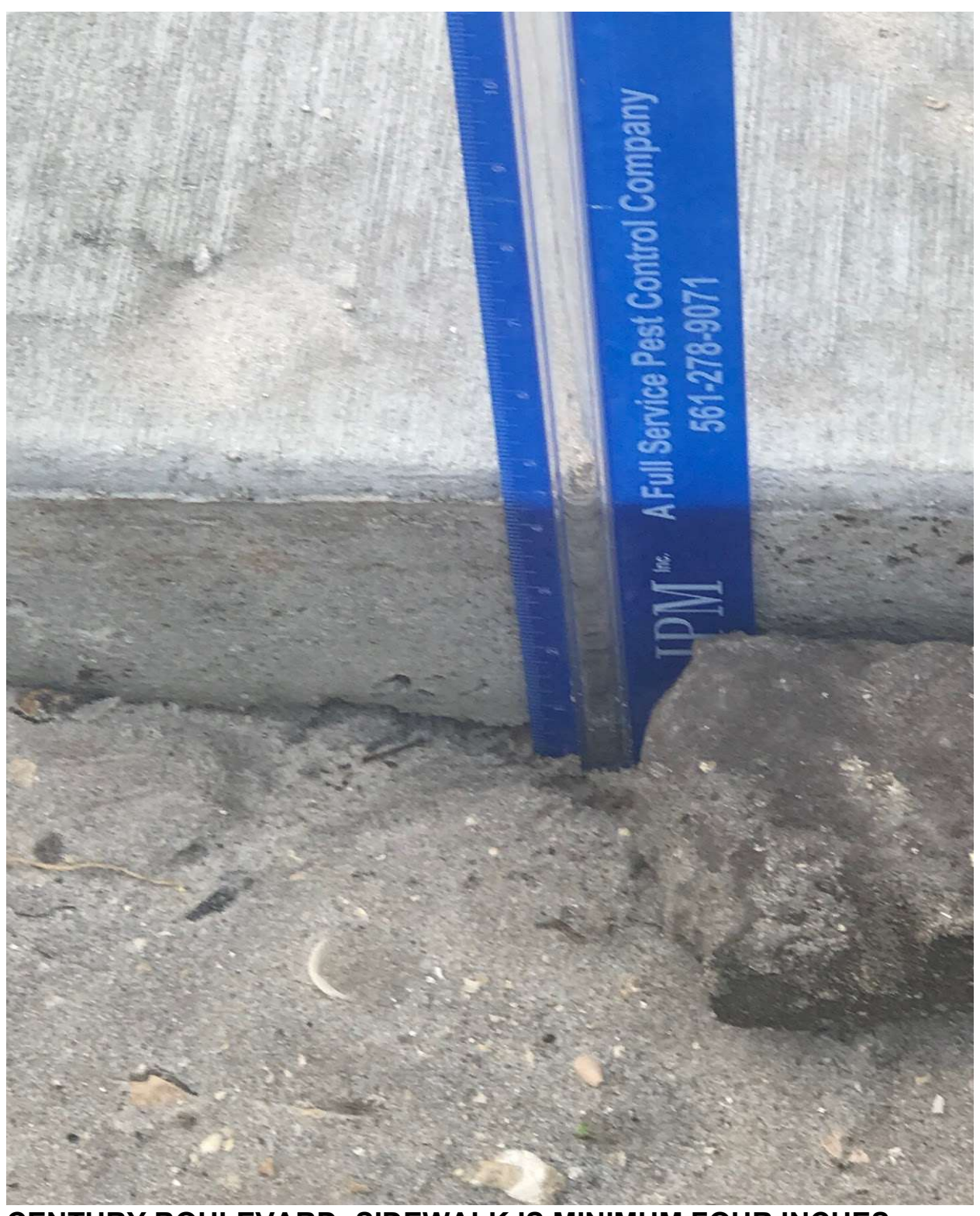
CENTURY BOULEVARD- SIDEWALK IS MINIMUM FOUR INCHES THICK, AS PER ENGINEER'S SPECIFICATIONS.