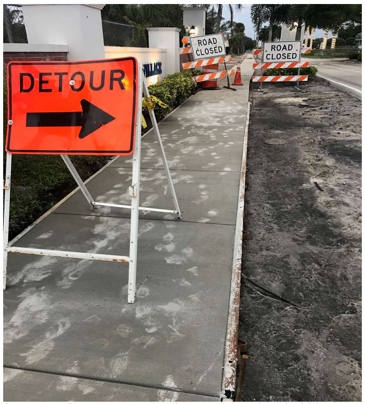
CENTURY BOULEVARD- TIE IN TO HAVERHILL ROAD CROSSWALK COMPLETE. PLEASE, STAY OFF THIS SIDEWALK AND USE TEMPORARY WALKWAY ON THE SOUTH SIDE OF CENTURY BOULEVARD (AVON STREET).