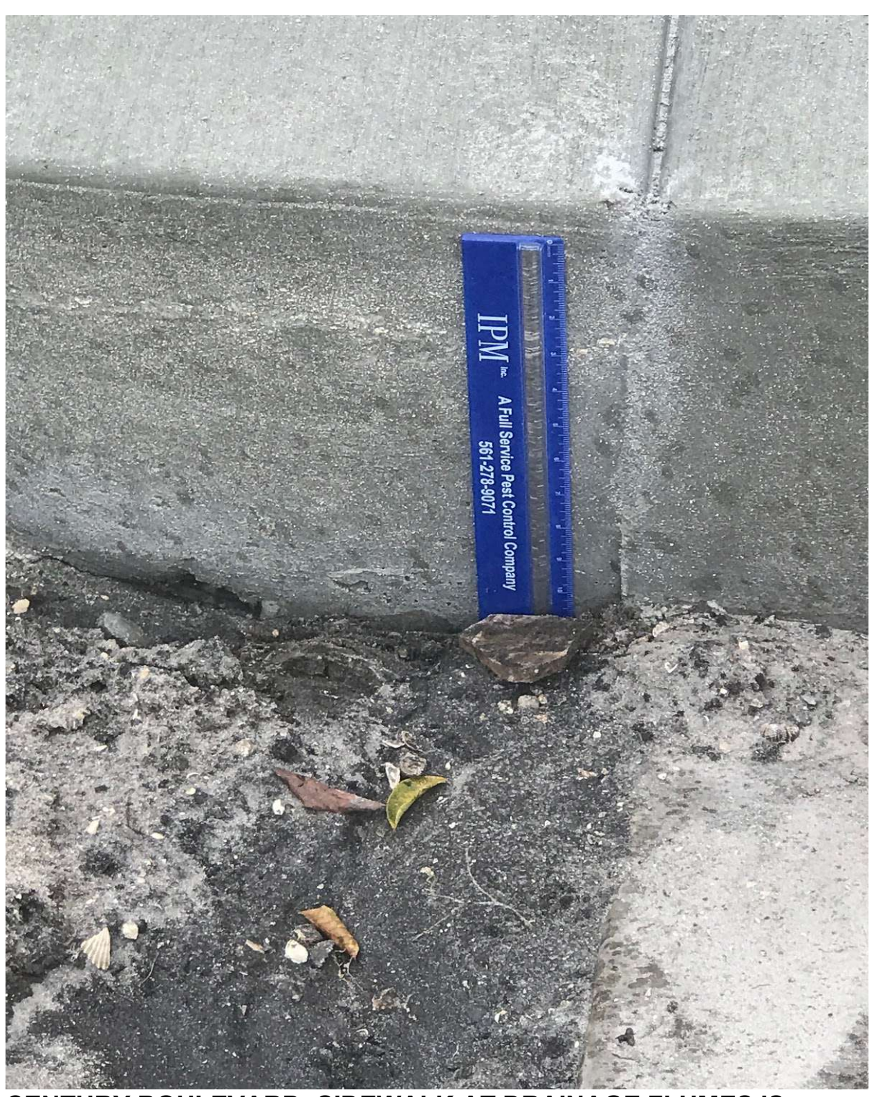
CENTURY BOULEVARD- SIDEWALK AT DRAINAGE FLUMES IS TWELVE INCHES THICK, AS PER ENGINEER'S SPECIFICATIONS.