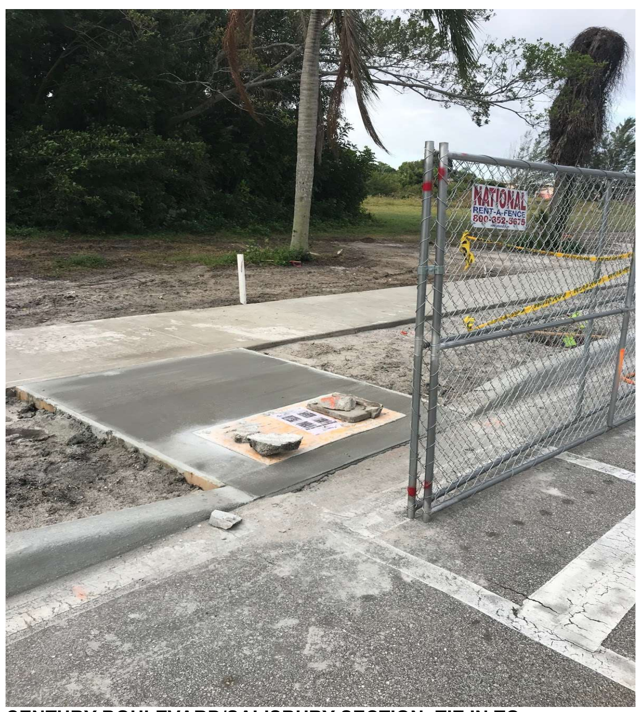
CENTURY BOULEVARD/SALISBURY SECTION- TIE IN TO CROSSWALK COMPLETE.