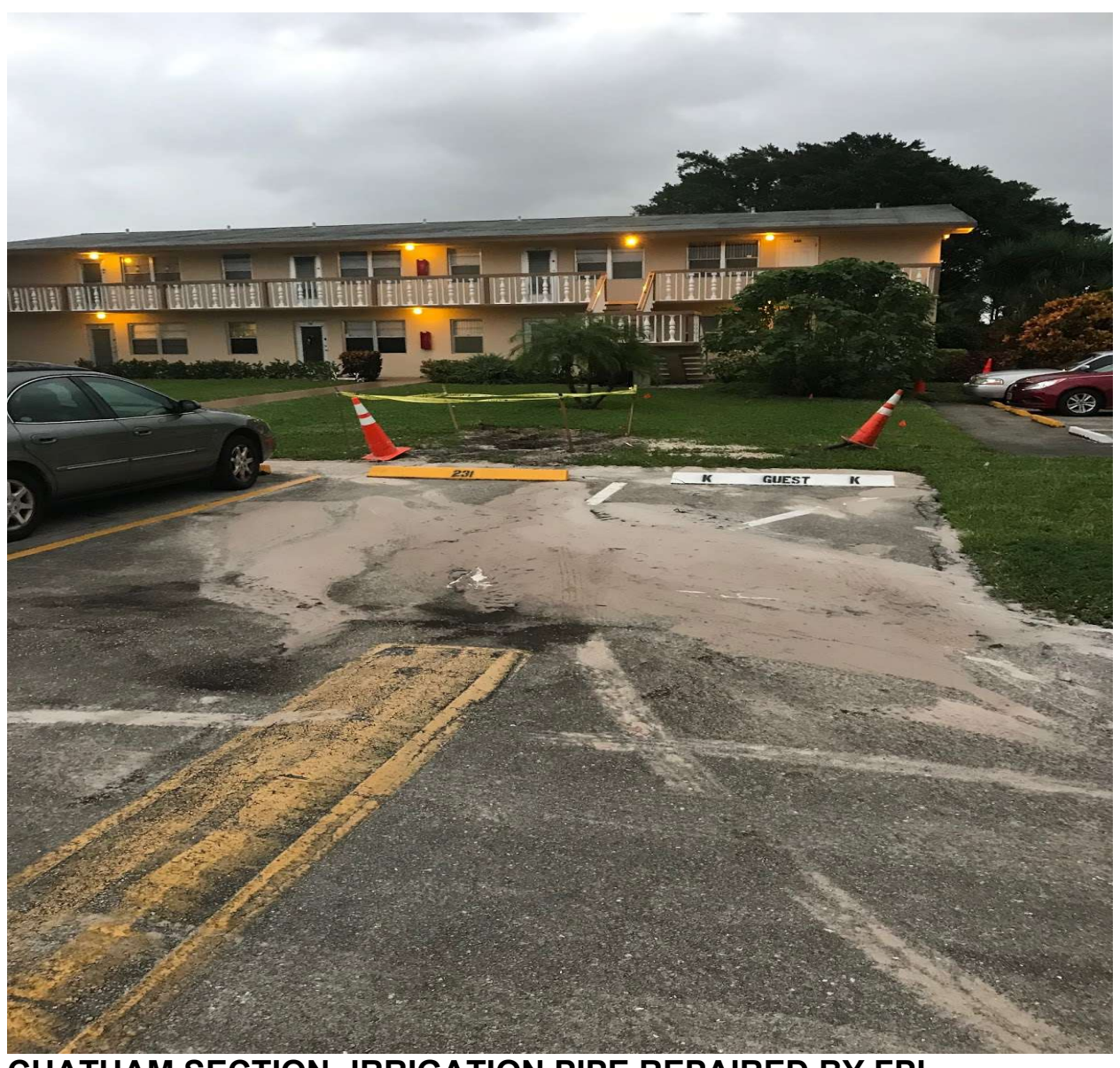
CHATHAM SECTION- IRRIGATION PIPE REPAIRED BY FPL CONTRACTOR. CONTRACTOR WILL NEED TO CLEAN UP SAND IN ROAD. COMPLAINT SENT TO FPL.