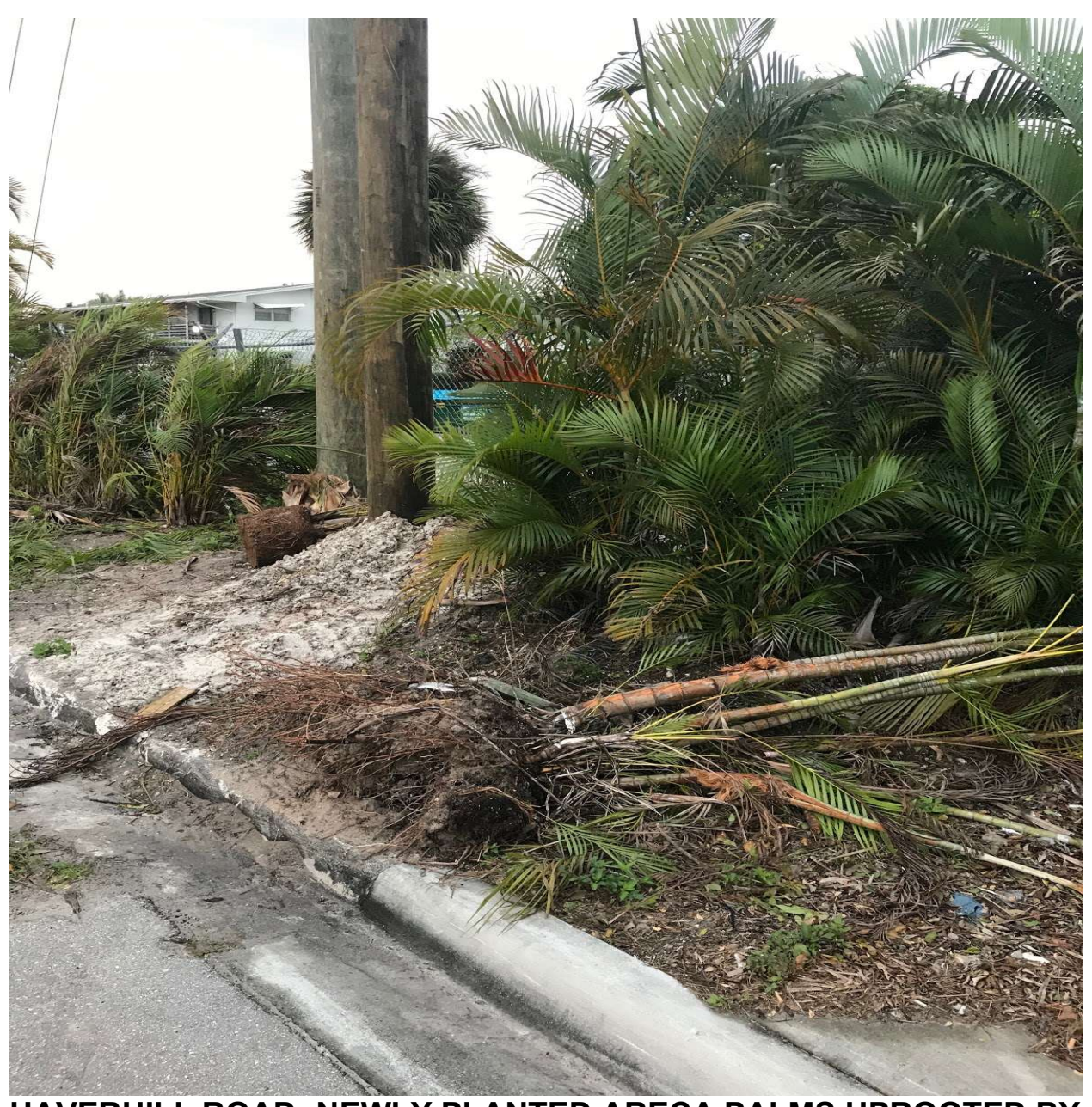
HAVERHILL ROAD- NEWLY PLANTED ARECA PALMS UPROOTED BY FPL CONTRACTOR INSTALLING NEW UTILITY POLE. SOME OF THESE PLANTS WILL BE REPLANTED, OTHERS TRASHED.