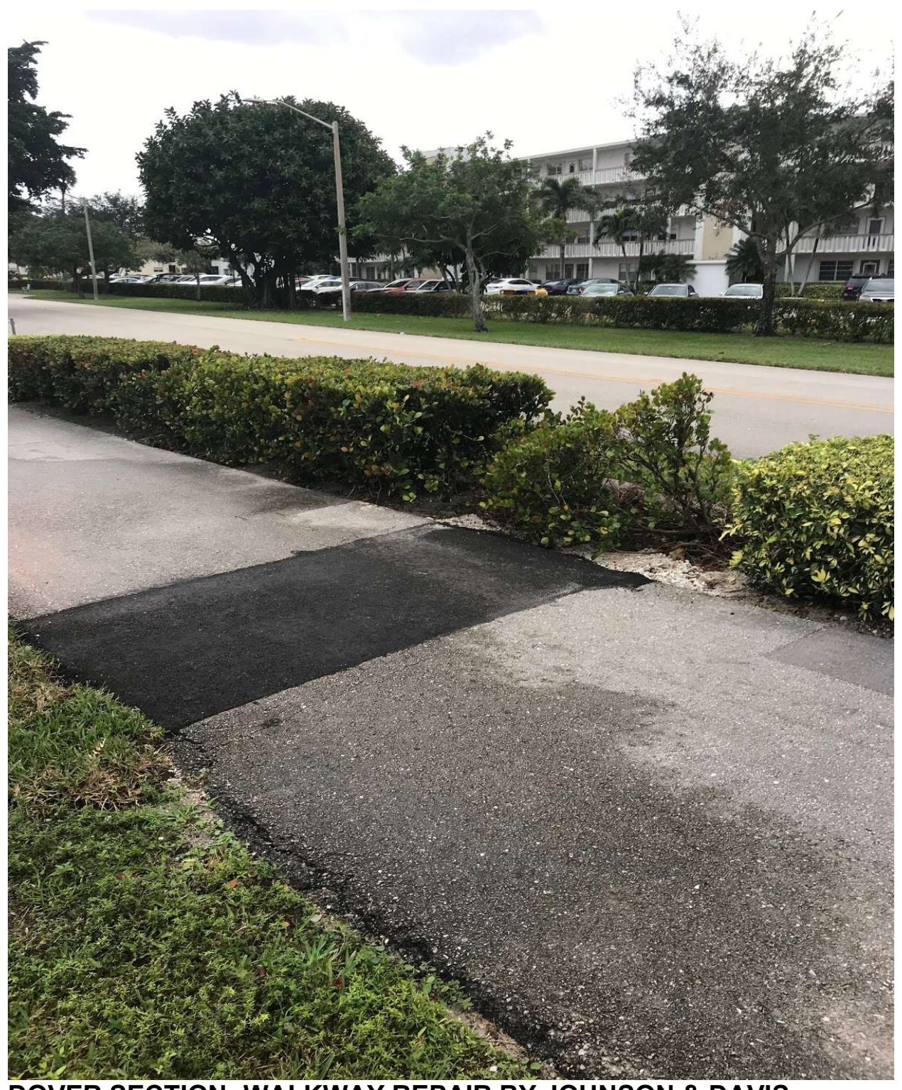
DOVER SECTION- WALKWAY REPAIR BY JOHNSON & DAVIS. CONTRACTOR WILL NEED TO REPLACE SHRUB.