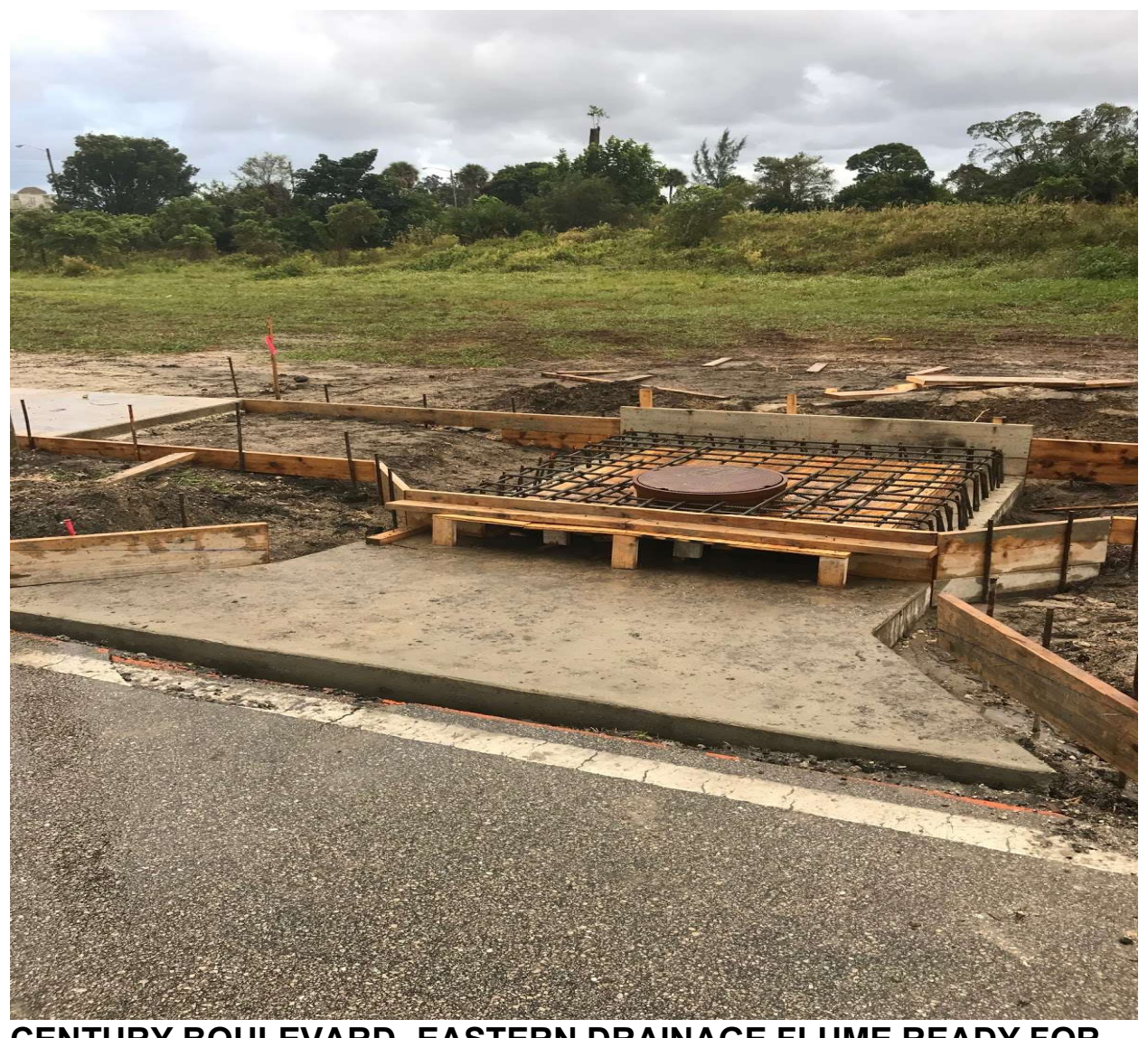
CENTURY BOULEVARD- EASTERN DRAINAGE FLUME READY FOR CONCRETE POUR.