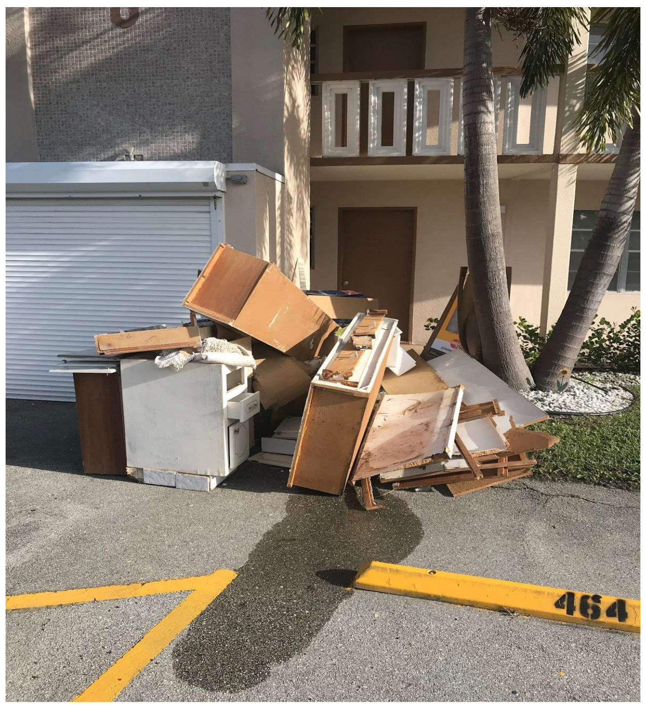
WELLINGTON SECTION- CONSTRUCTION DEBRIS IS NOT PICKED UP AS PART OF REGULAR BULK TRASH SERVICE. ASSOCIATION MUST ARRANGE FOR SPECIAL PICKUP, AT ADDITIONAL COST, OR REQUIRE UNIT OWNER TO ARRANGE FOR DISPOSAL.