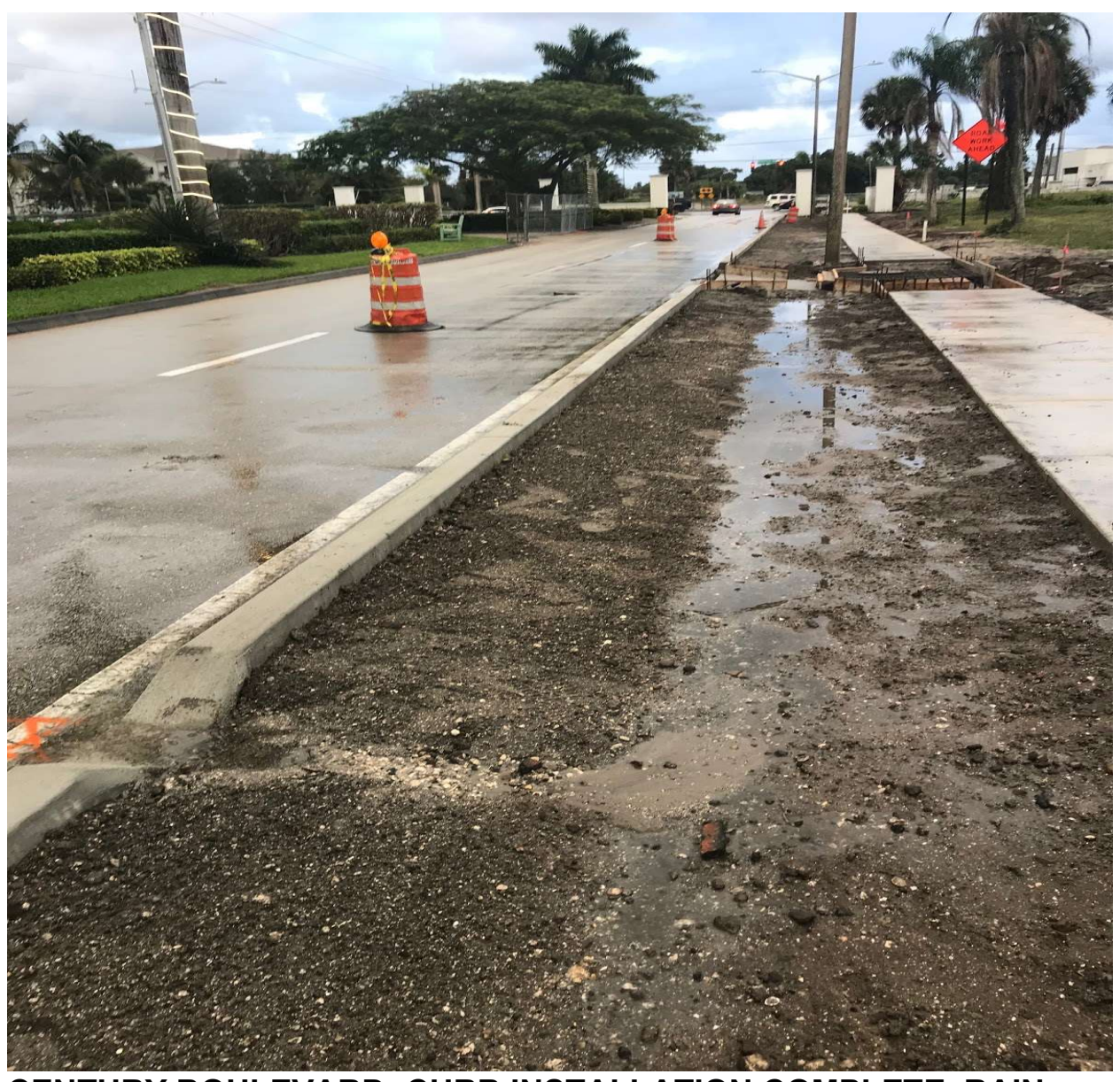
CENTURY BOULEVARD- CURB INSTALLATION COMPLETE, RAIN WATER FROM ROADWAY MOVING TO DRAINAGE SWALE BETWEEN SIDEWALK AND CURB.