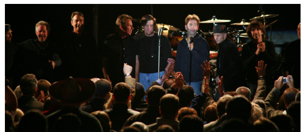
Huey Lewis & The News at the Resort at Squaw Creek, Olympic Village, California, with Chuck Hansen, 2006.