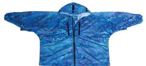
Youth and Petite Size!

Bib and Pants available in all WAV3 Colors!