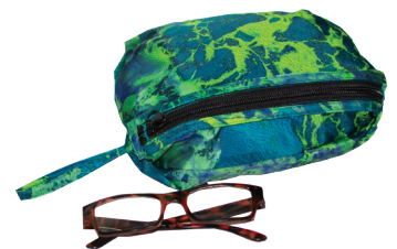
Packs into its pocket!