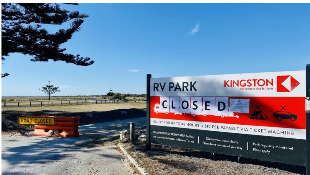
Photo: Kingston township RV Park, temporary closed to travellers.