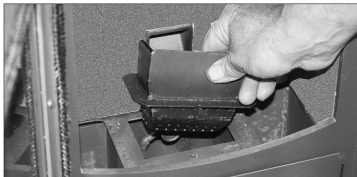
Figure 30 : Fire pot clean

HOT SURFACES CAN CAUSE BURNS. NEVER PERFORM CLEANING OR MAINTENANCE ON A HOT STOVE. ALLOW UNIT TO COOL FOR A MINIMUM OF TWO HOURS. NEVER PERFORM SERVICE WITH POWER SUPPLIED TO THE UNIT. INJURY TO PERSONEL OR DAMAGE TO EQUIPMENT CAN OCCUR.