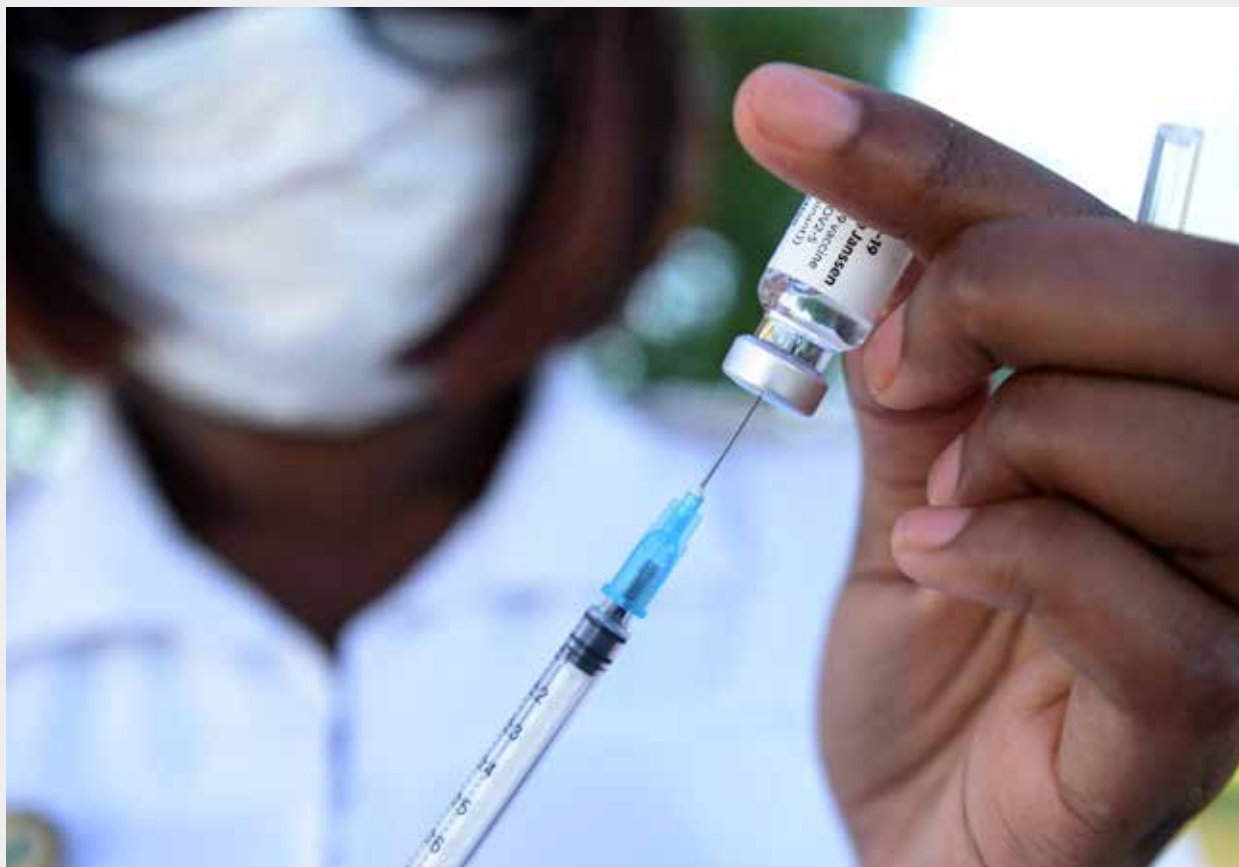
District Health Management Team (DHMT) started the drive through COVID-19 vaccine campaign in Gaborone on 12 October 2021.

Our lack of social acceptance of homosexuality can only aid divisions among us and cause unnecessary uneasiness in our nation. It should be the responsibility of both the government and LEGABIBO to prepare our society to accept that it is not wrong to be different. The two should reach out to all corners of the country to educate and sensitise Batswana to the reality that Lesbians, Gays and Bisexuals are here to stay and are as human as everybody else.