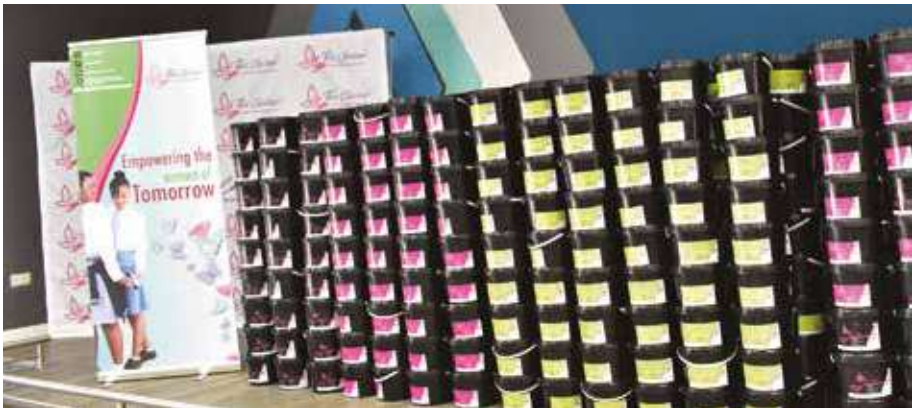
Re –usable sanitary pads come in a bucket hamper called the bucket of hope