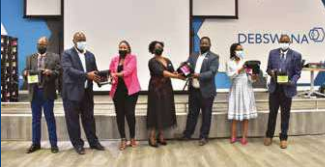
Education Coordinators accepted the donation of solar lamps on behalf of 28 schools based within Jwaneng zone of influence