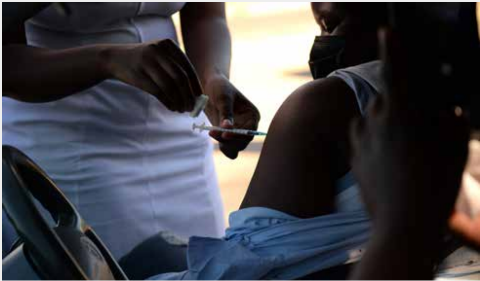
District Health Management Team (DHMT) started the drive through COVID-19 vaccine campaign in Gaborone