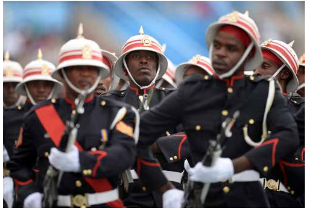
During the BDF day celebration.

During the send-off of the BDF contingent, Masisi disclosed that each SADC member contributing troops would pay its own costs to augment allowances from the SADC Secretariat.