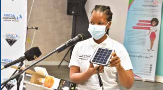
Capacity building on how solar lamps work and should be used