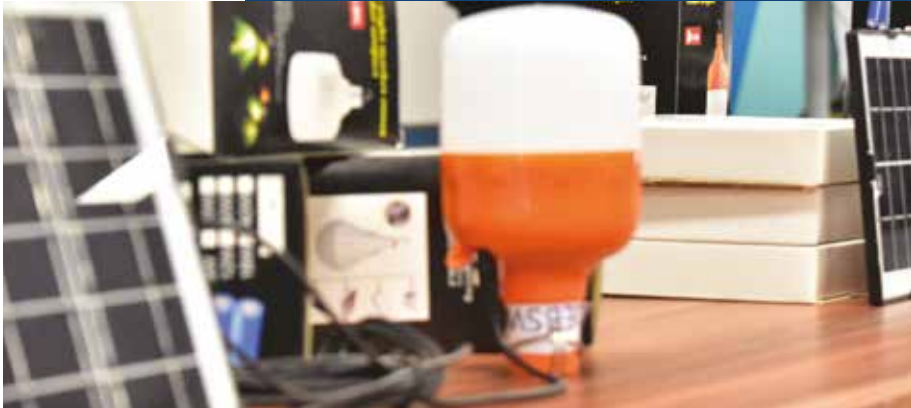
Solar lamps donated to 28 schools in the Jwaneng Zone of Influence