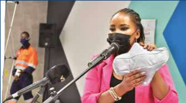
Demonstration on how re- usable sanitary pads should be used