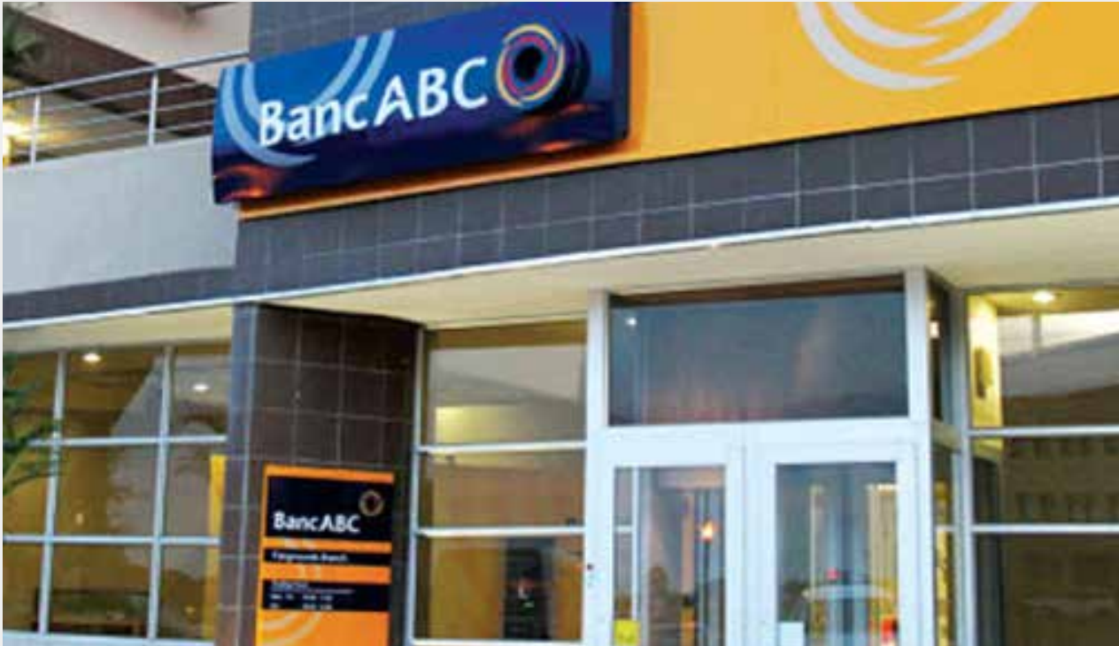
Access Bank acquired BancABC Botswana from ABC Holdings Limited (ABCH) earlier this year after the Competition and Consumer Authority (CCA) approved the merger.

Says Botswana will benefit from synergies of Access Bank's technological infrastructure and corporate and SME capabilities