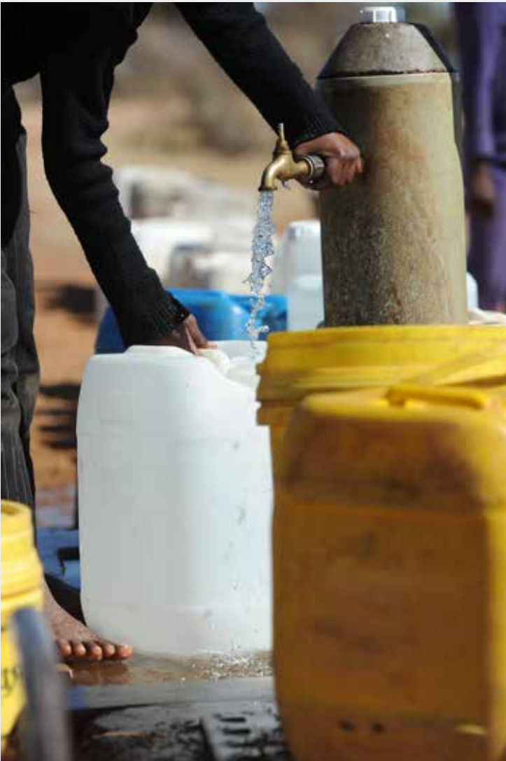
In a communique, the parastatal says a grace period of one month from 1 st October 2021 to 31 st October 2021 will be granted to allow debtors to make payment arrangements and re-apply for services.

However, he said accounts may be reconciled upon a client’s request. In the past, the government has said that WUC had no plans to introduce prepaid meters.