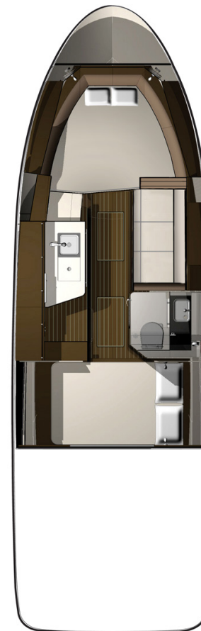
OPTIONAL LAYOUT V-BERTH W/FWD BED