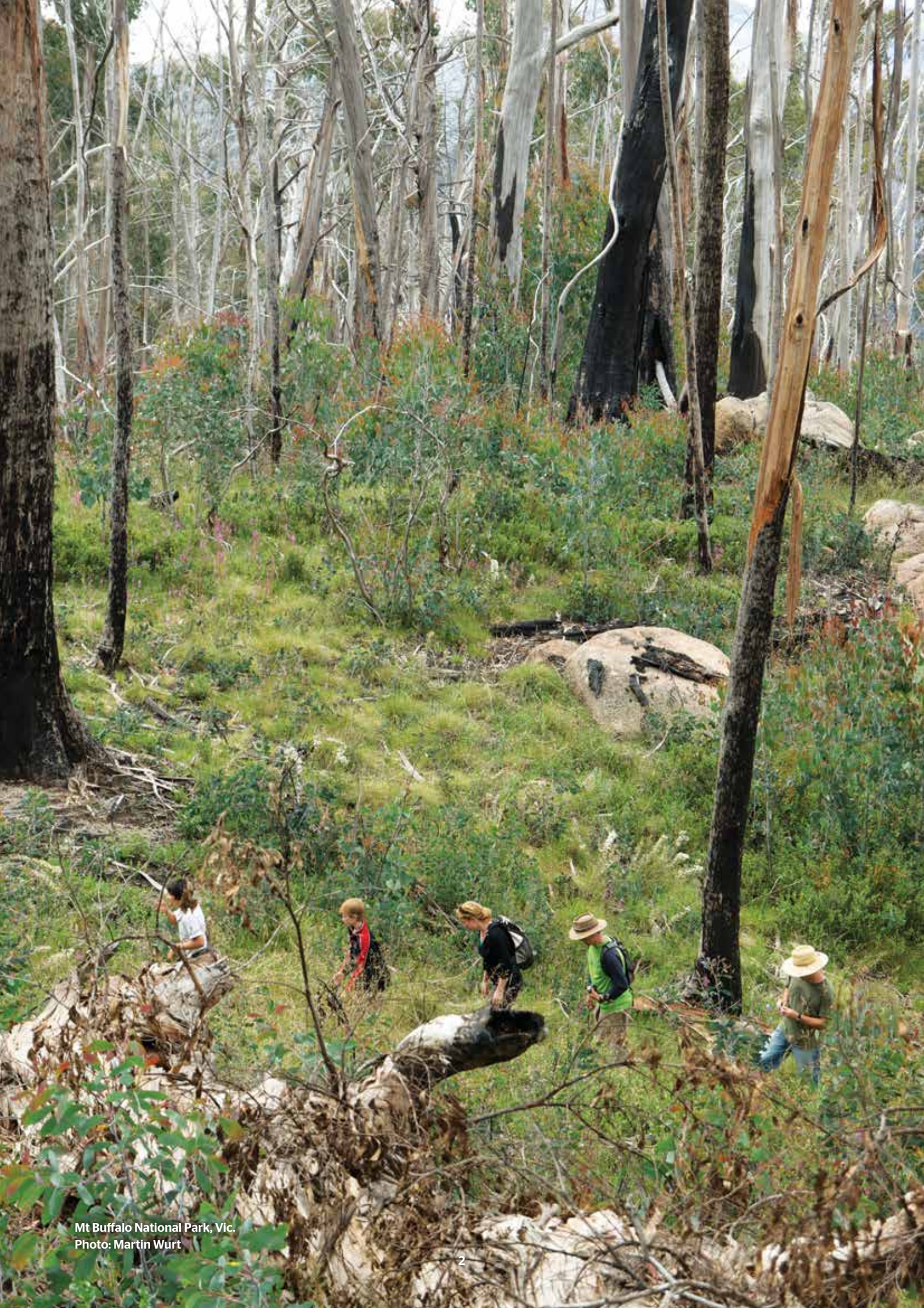
Mt Buffalo National Park, Vic.