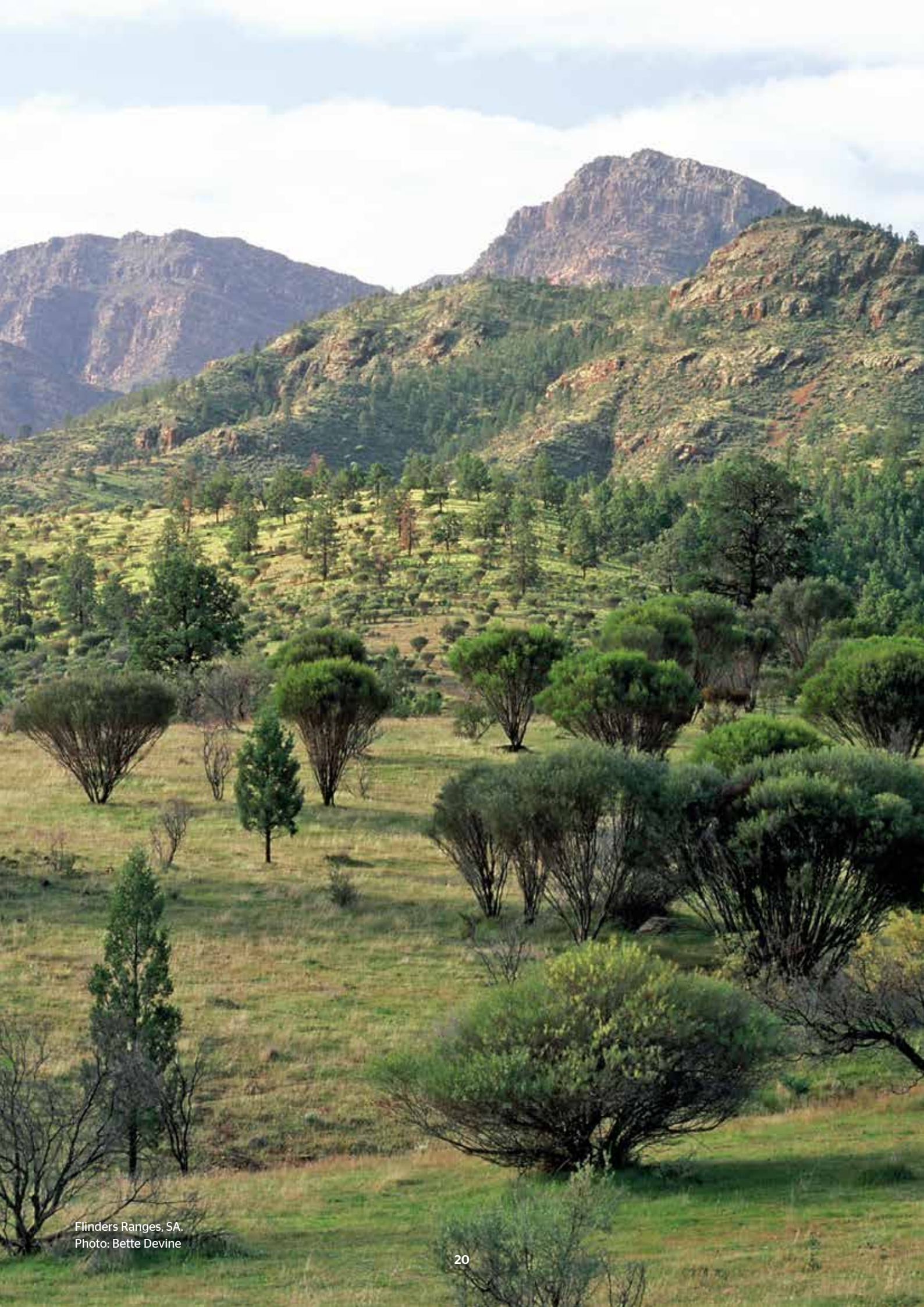
Flinders Ranges, SA.