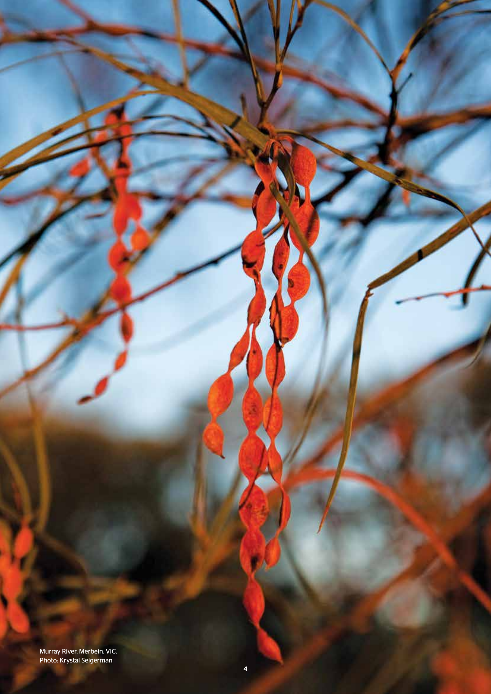
Murray River, Merbein, VIC.