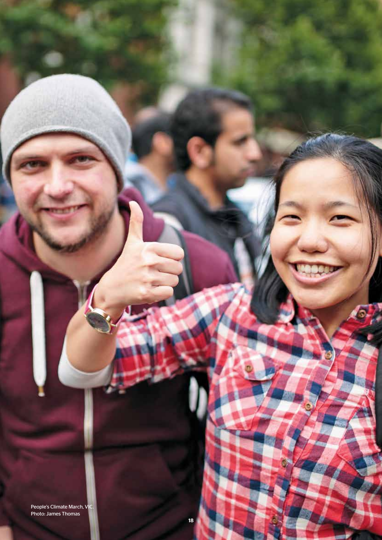
People's Climate March, VIC.