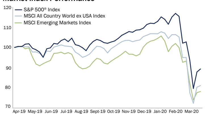
As of March 31, 2020.

Exacerbating the turmoil, major crude oil producers Saudi Arabia and Russia declared a price war. Having failed to agree on reduced production levels to address already weak global demand, the two countries announced their intentions to ramp up production in an attempt to drive higher-cost producers out of business (including prolific shale-oil-producing nations such as the US). The price of West Texas Intermediate crude oil dropped more than 65% in the quarter, to approximately $20 per barrel.