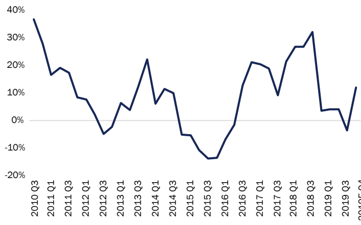
As of March 31, 2020. YoY = Year over Year. Source: FactSet.