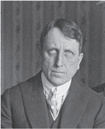
William Randolph Hearst