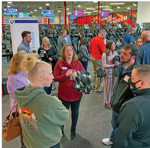
Members networking at our January Wednesday Wake-up event at Chiefs Fit .