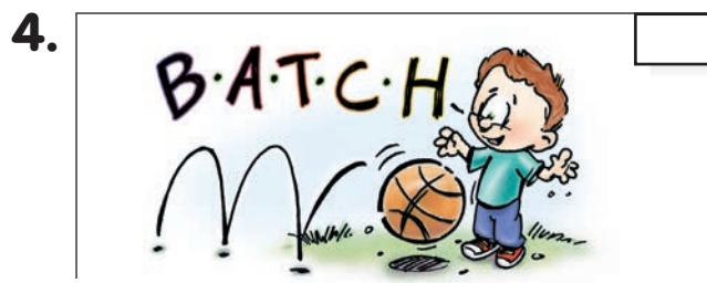
Bounce a ball as you spell your words.