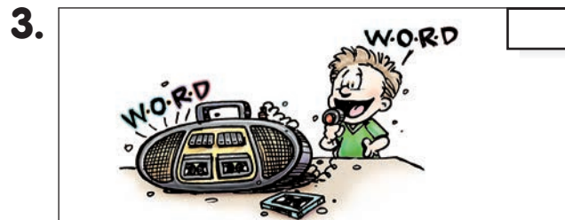
Spell your words on tape.