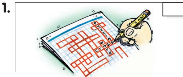
Create a crossword puzzle.

Initial the box of each activity you finish.