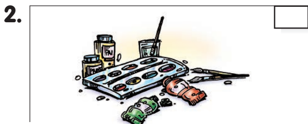
Spell your words with paint.