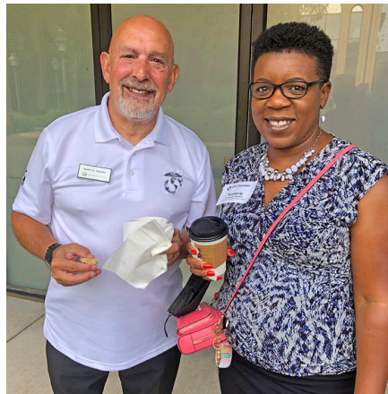
Members networking at our July Wednesday Wake-up event hosted by In The Zone Cryo + Health Upgrades , 7102 College Boulevard.