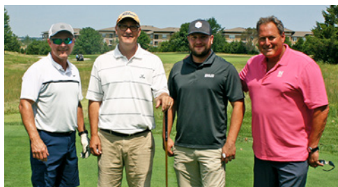
1st Place-Flight A: Black & Veatch

Congratulations to these winners (names not shown in order)