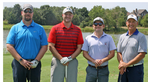
3rd Place-Flight A: AdventHealth