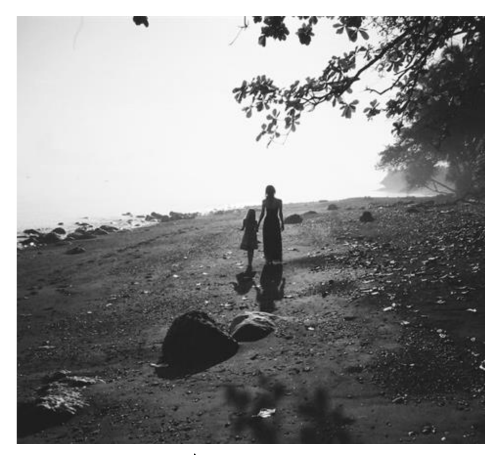
August 20, 2023 10:30a Twelfth Sunday after Pentecost Liturgy of the Word

"The Mission of Grace Episcopal Church is to promote an atmosphere for the expression of God's love through Jesus Christ, which calls each of us to know God by reaching out to others and inwardly to ourselves.