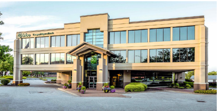
FNBO location at 4650 College Boulevard.