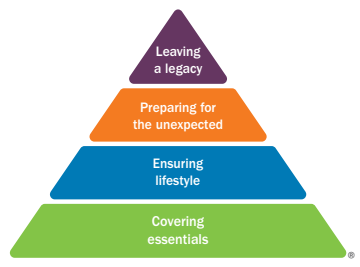
Confident Retirement® approach

If you're five or more years away from retirement, achieving financial confidence typically means finding the right balance between today's needs and desires and tomorrow's goals and dreams. It's about making choices in order to live a life on your terms beginning now and for years to come.