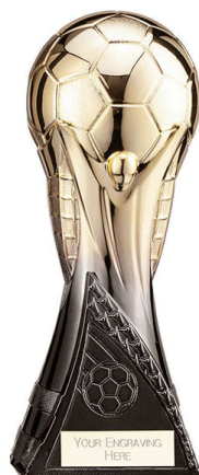
Class Football Champions 2024 2B, 4S and 6J

We supported Mental Health Week by taking part in these games because we all completed our 5 Steps. Every pupil was actively exercising, connected with their teams, took notice of others' feelings and respected opponents; learning to be both good winners and graceful losers by giving congratulations to the winners and support for their team. Most importantly they had fun!