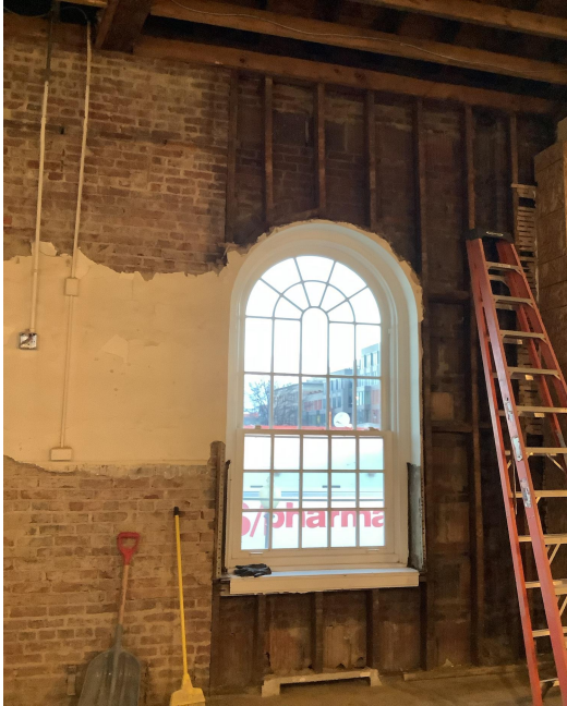
Ceiling Stripped Interior Walls Exposing Terracotta and Brick