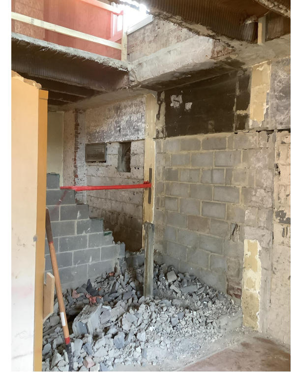
Demolition of Existing Elevator & Shaft