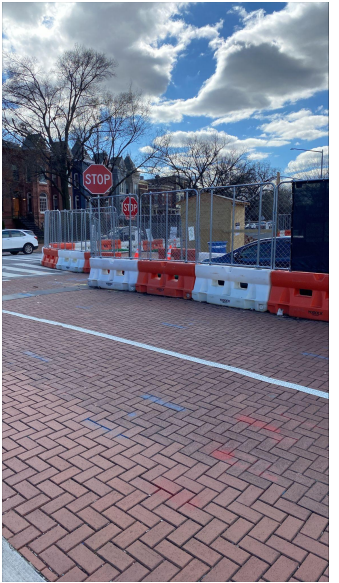
Scrim from 2 additional panels removed for pedestrian & vehicular safety on March 7, 2024