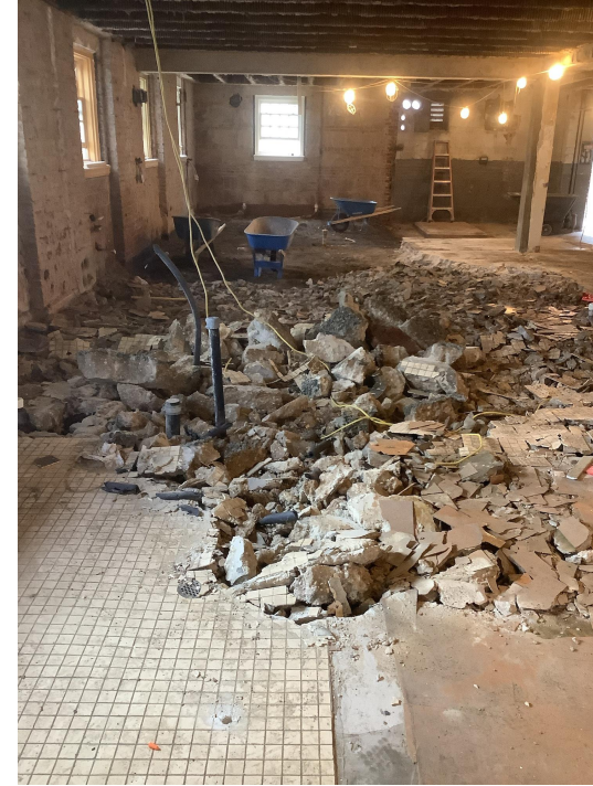
Demolition of Concrete Slab underway