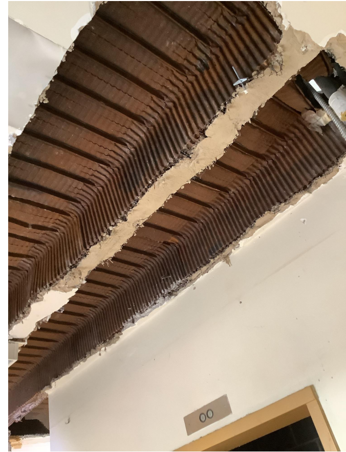
Plaster Ceiling Removed & Concrete Slab Exposed