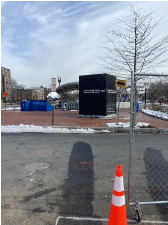
Safety mirror installed on 7th Street