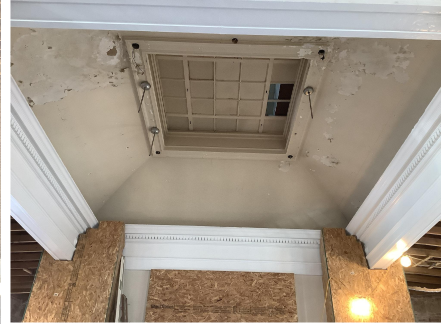
Demolition of Existing Plaster Ceiling to Expose Historic Laylight that will be Restored