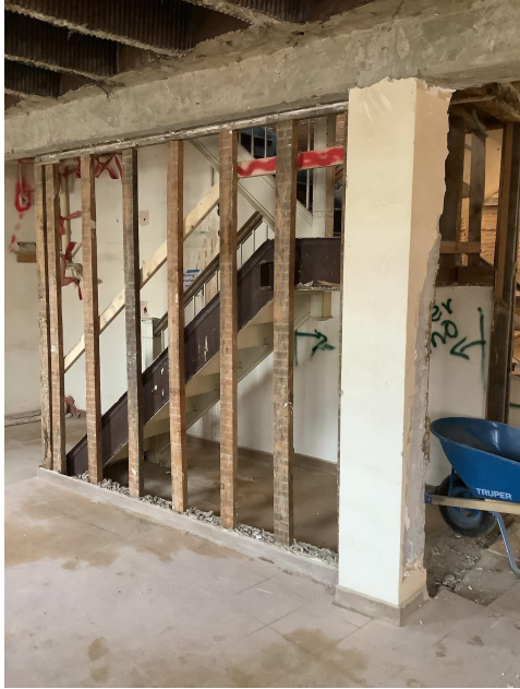
Demolition of Existing Walls underway