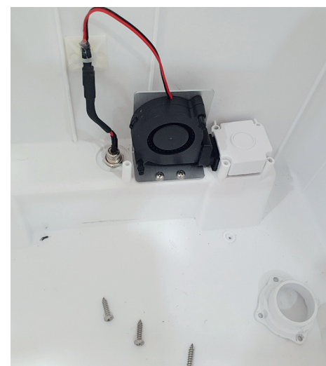
13 Turn the filter base over to vent the 12V fan to outside