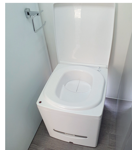
20 Toilet is ready for use