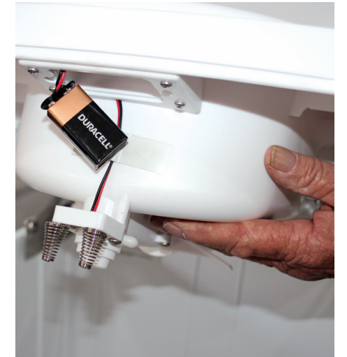
16 Connect 9V battery for liquids container indicator light