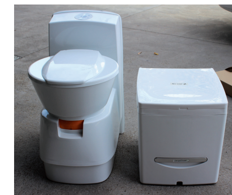
3 Shorter than a conventional cassette toilet