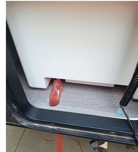
15 Slide vent hose through existing hole in floor