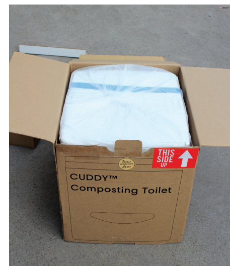
1 Opening the box

Before using the Cuddy, you must add a compost medium such as hydrated coco coir (available from Bunnings and the like), mini hemp or wood shavings to the solids bin just covering the bottom of the agitator arms which are used to incorporate the waste into the compost material, triggering the decomposition process. This composting waste is stored in its container and sealed underneath the bowl.