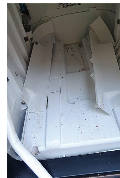
6 Unclip the cassette rails and remove the screws in floor