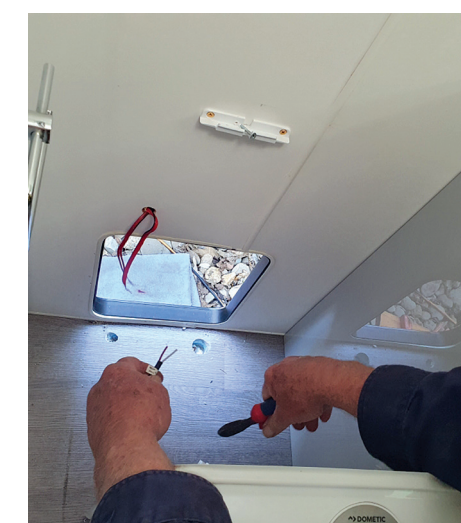
9 Disconnect the 12V power supply