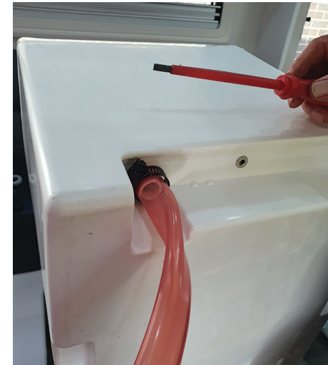
14 Fit vent hose to bottom of unit