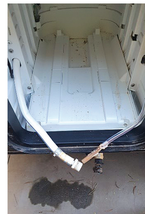
5 Remove the overflow pipe