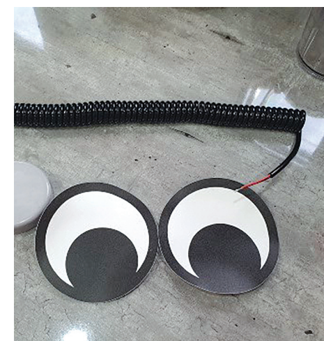
21 The Cuddy comes with eyes stickers if you want the front of your Cuddy to have a smiley face (the mouth is the agitator crank at the front) 😊