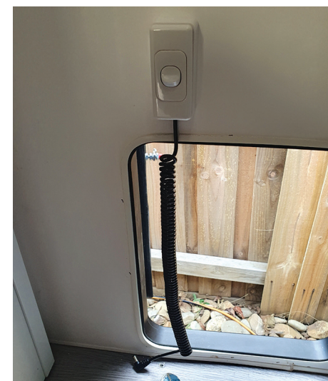
17 Install the on/off switch for 12V fan to existing cable