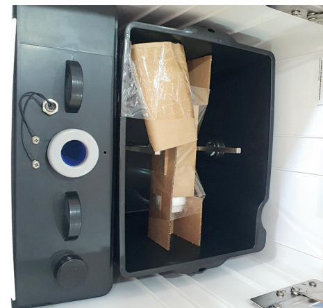
12 Remove the solid and liquid canisters from Cuddy