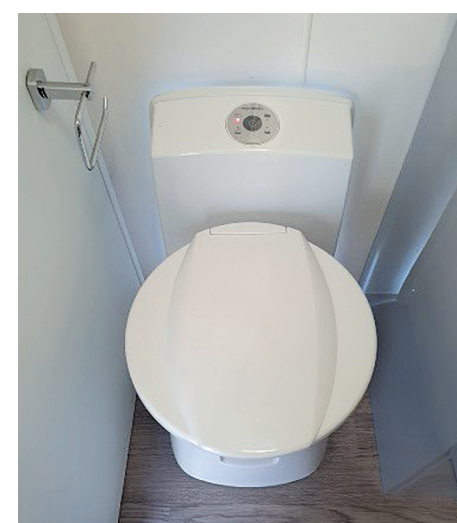
7 Lift and remove the toilet from inside