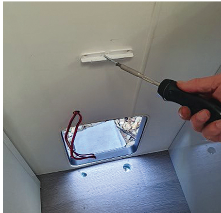
10 Unscrew the flush unit bracket from the wall

Keeping ones and twos separate does require some behaviour change. Menfolk are encouraged to sit to pee to ensure a more accurate aim into the small hole into the liquids container and to eliminate the inevitable 'splashing' which often occurs from great heights. And the ladies might have to adjust their seated position slightly too.