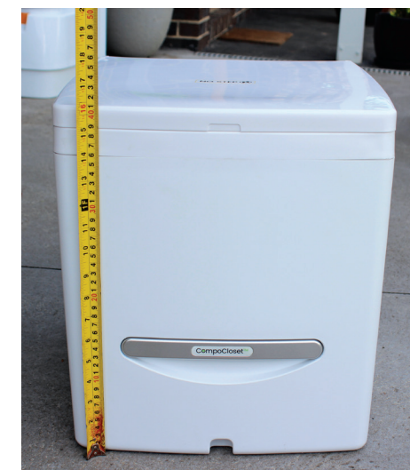
2 The Cuddy is a compact 41cm high