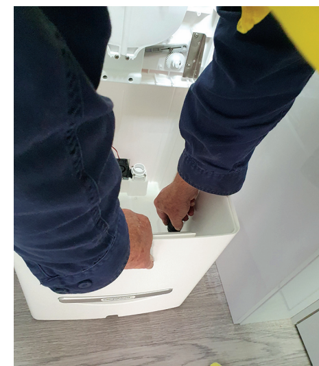
18 Place unit in position and screw to floor via reinforced points in the base