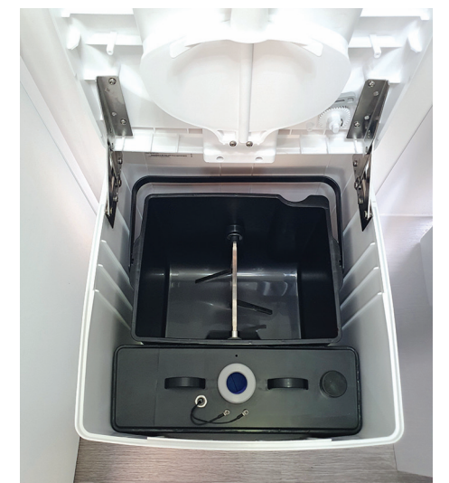
19 Reinsert the containers — add compost medium to the solids container as per the instructions before use