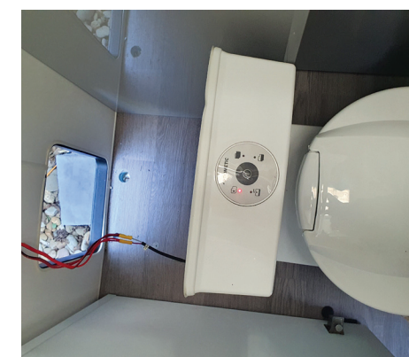
8 The toilet is still attached to the 12V power supply