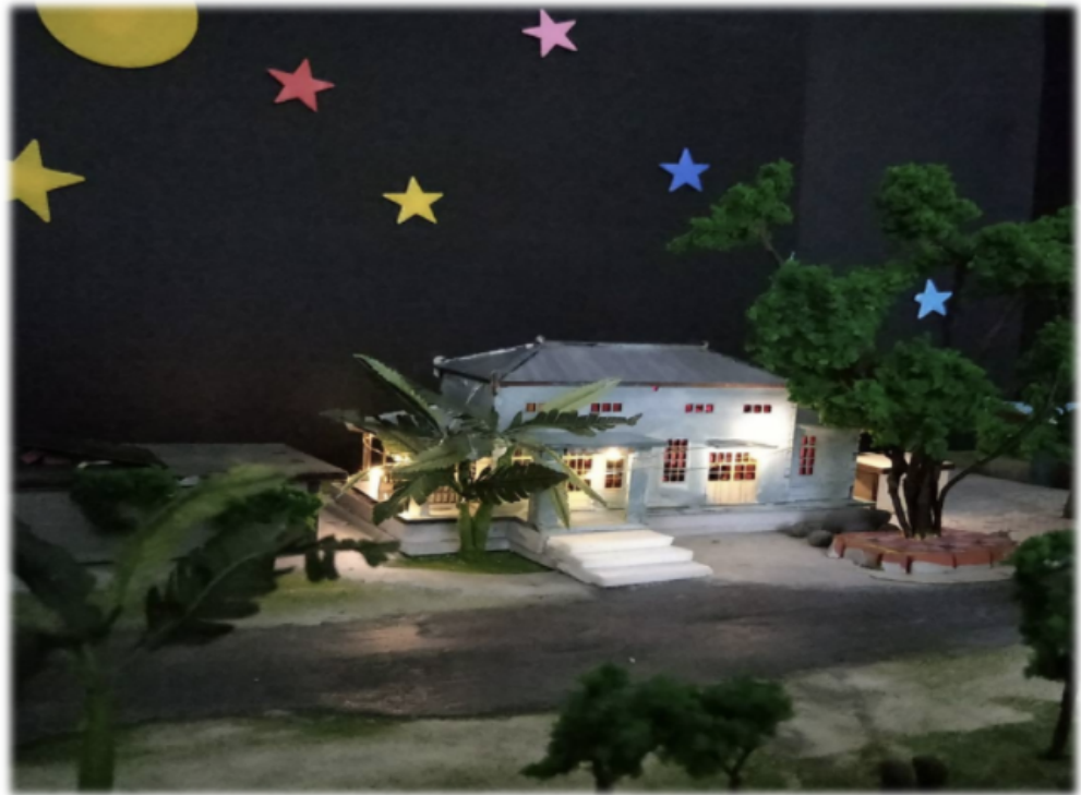
Picture 1. One of the LUOTS models made by a group of fifth graders.

1. Empathy: pupils are guided to conduct a field study in the local community and explore residents' needs.