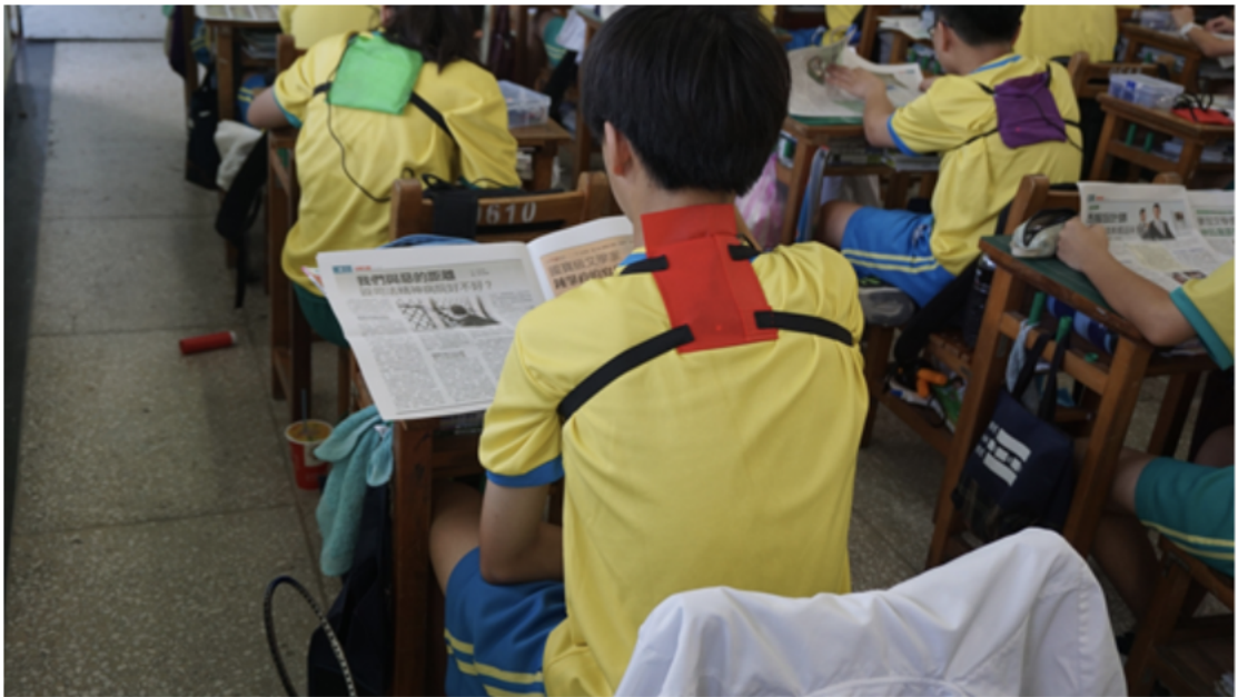
Picture 2. Three eighth graders wear Micro:bit enhanced devices to monitor sitting postures.

development of wearable devices to monitor sitting postures and then help maintain correct sitting postures.