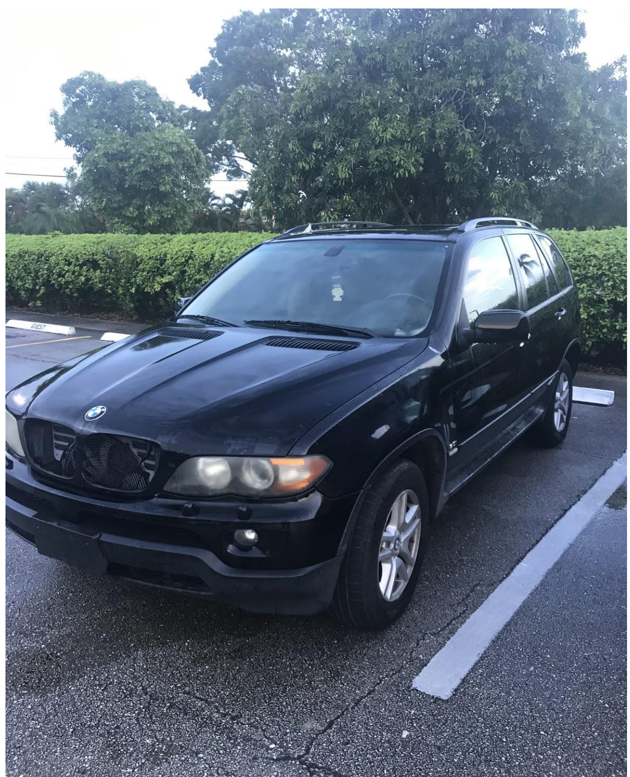
SOUTHAMPTON SECTION- DERELICT CAR, NO LICENSE PLATE OR BARCODE. THE ASSOCIATION ORDERED THIS CAR TO BE TOWED ON 7/23.