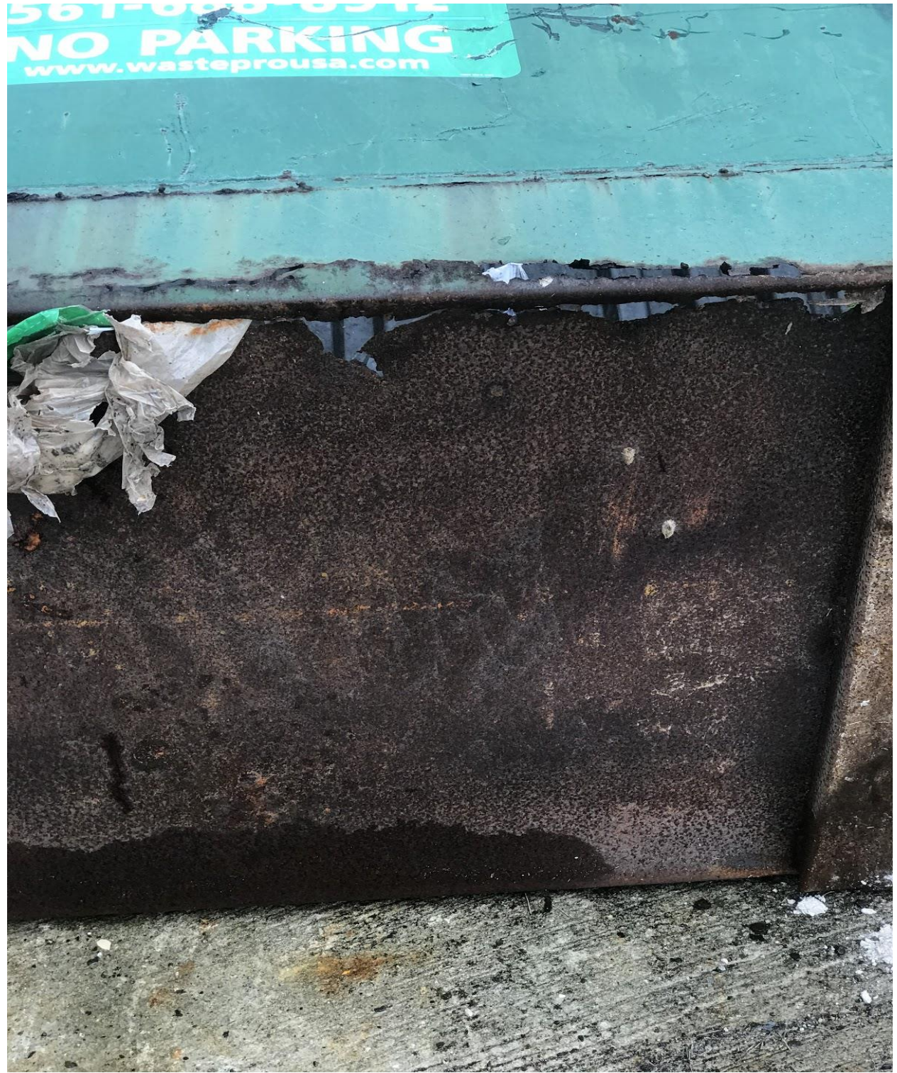
NORWICH SECTION- THIS DUMPSTER IS RUSTED OUT. REQUEST FOR REPLACEMENT SENT TO WASTE PRO. PLEASE SEND BUSTED DUMPSTER REPORTS TO <u>WWW.UCOGARBAGE.COM</u>.