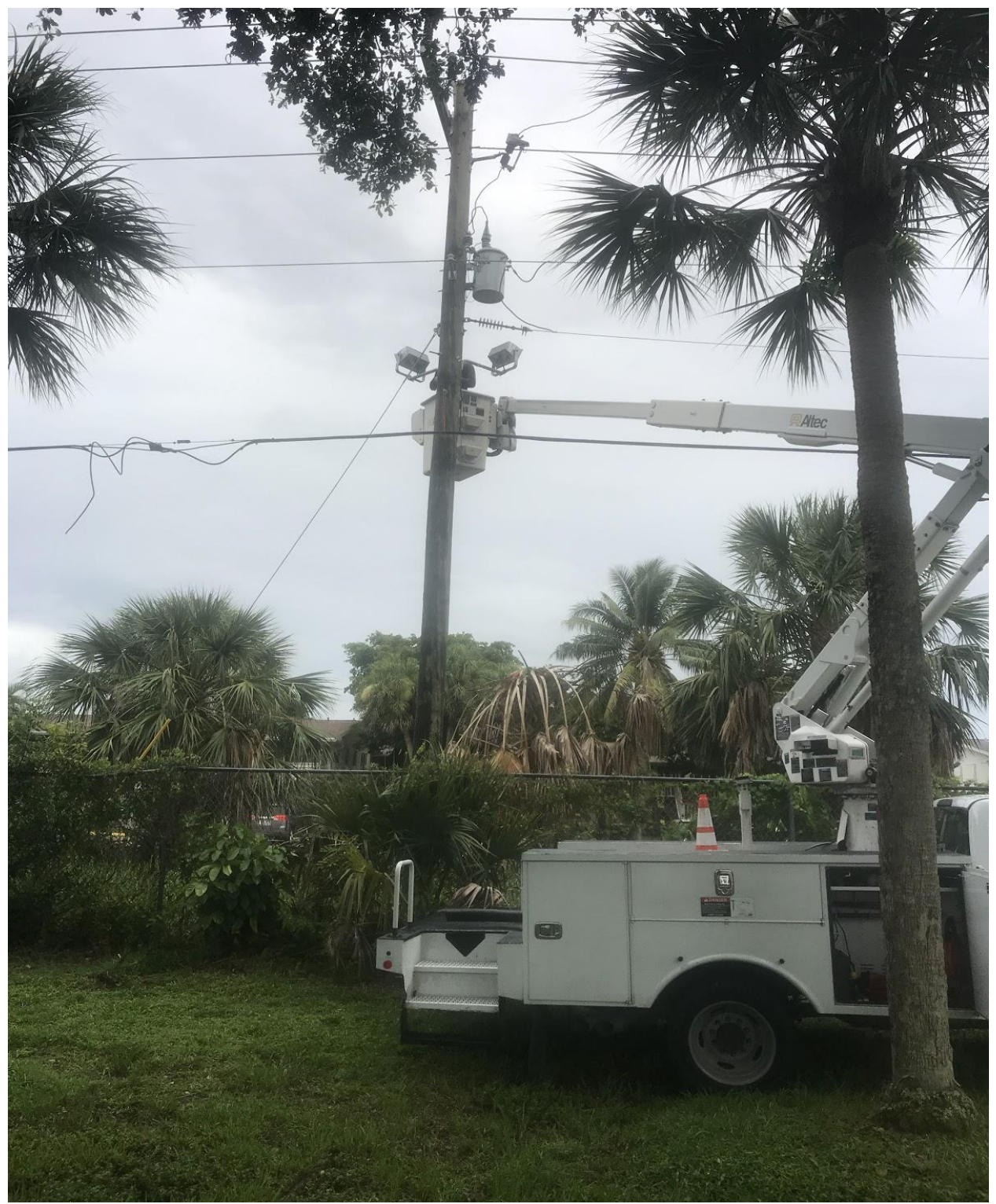
NORTH CANAL- FPL CONTRACTORS INSTALL LED FLOODLIGHTS TO LIGHT UP FALKIRK STREET ON 7/22.