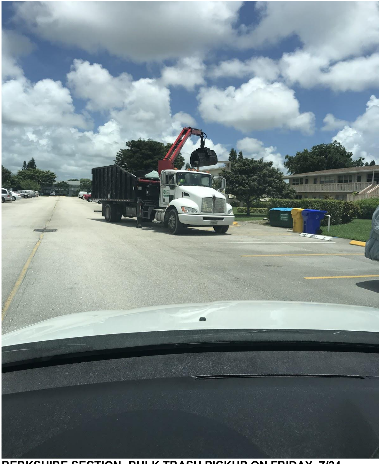
BERKSHIRE SECTION- BULK TRASH PICKUP ON FRIDAY, 7/24. PROPERTY WAS NEARLY EMPTY OF BULK TRASH ON FRIDAY AFTERNOON.