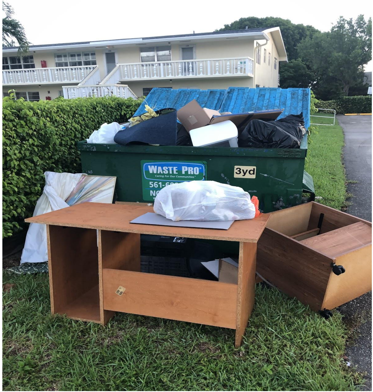
SHEFFIELD SECTION- A PLYMOUTH UNIT WAS EMPTIED OUT INTO A SHEFFIELD DUMPSTER ON SUNDAY, LEAVING NO ROOM FOR RESIDENTS TO PUT THEIR REGULAR TRASH. DISGUSTING. THE PLYMOUTH ASSOCIATION AND THEIR PROPERTY MANAGER WERE NOTIFIED. SPECIAL PICKUP WILL BE ORDERED.