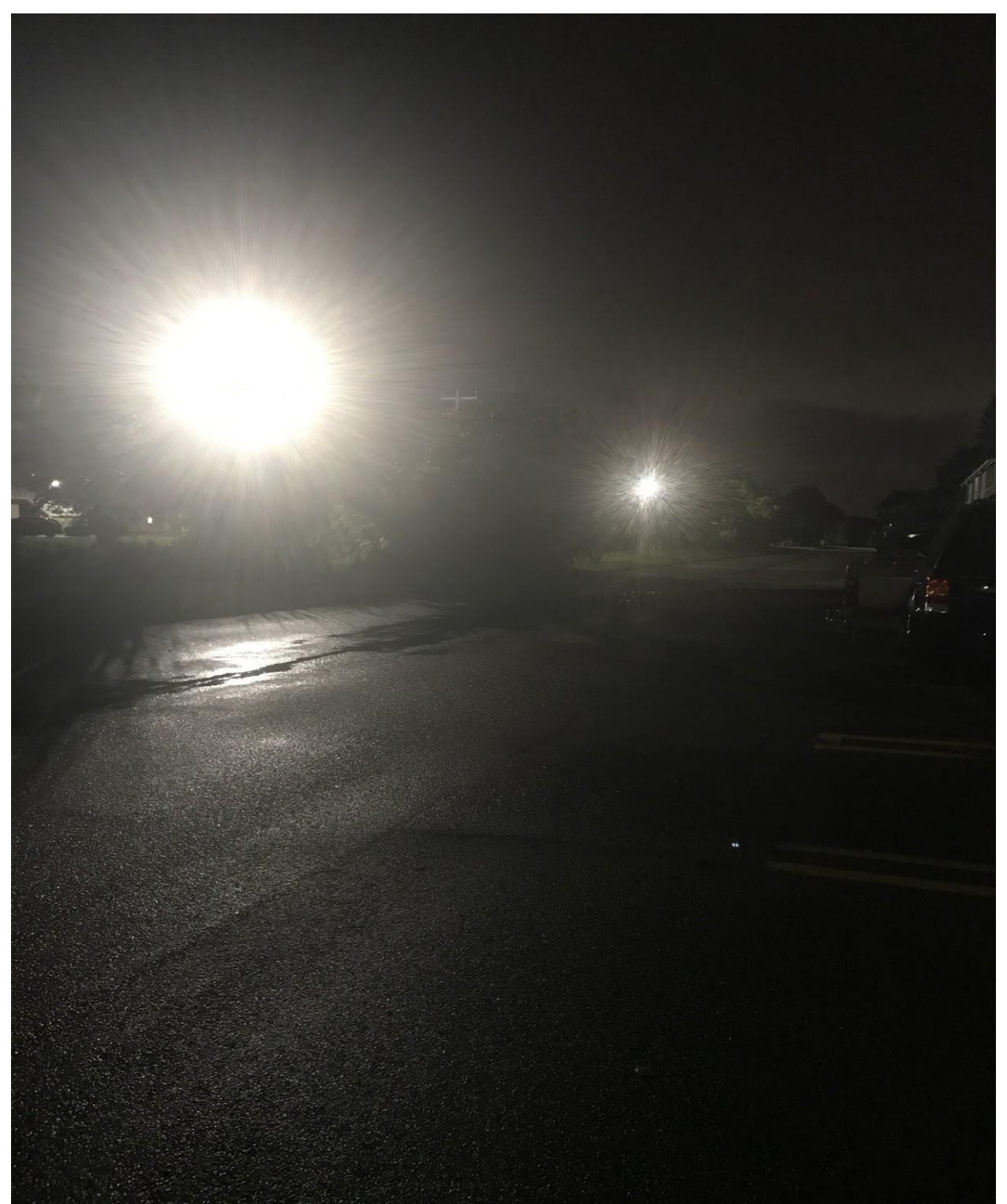
SHEFFIELD SECTION- THIS SECTION OF FALKIRK STREET IS NOW WELL LIT.