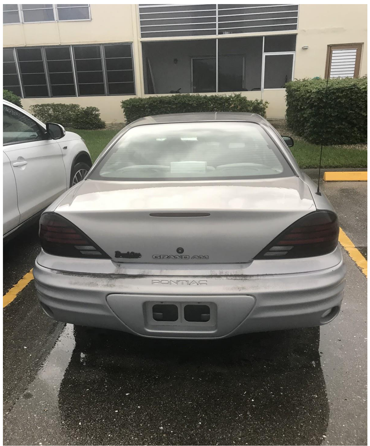
DORCHESTER SECTION- DERELICT CAR, NO LICENSE PLATE, FLAT TIRES. REMOVED FROM PROPERTY VOLUNTARILY BY OWNER.