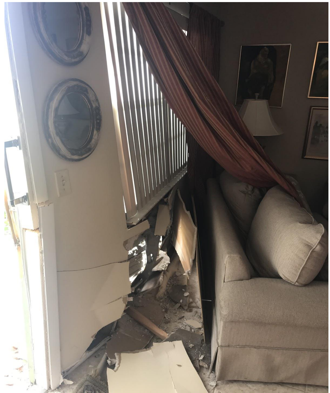
WELLINGTON SECTION- LUCKILY, NO ONE WAS SITTING ON THE COUCH.