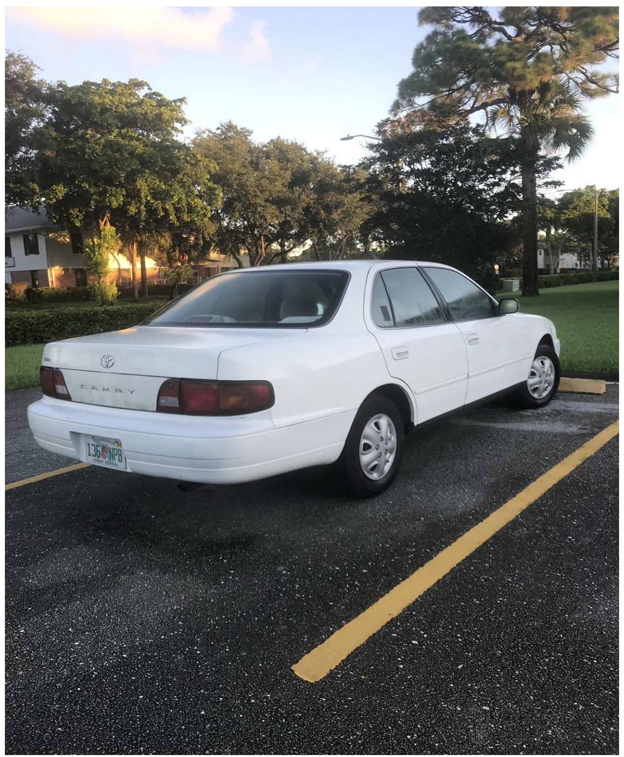
WALTHAM SECTION- CAR WITH LONG EXPIRED REGISTRATION TAG (2010!). THIS CAR WAS VOLUNTARILY REMOVED FROM PROPERTY BY OWNER THROUGH DONATION.