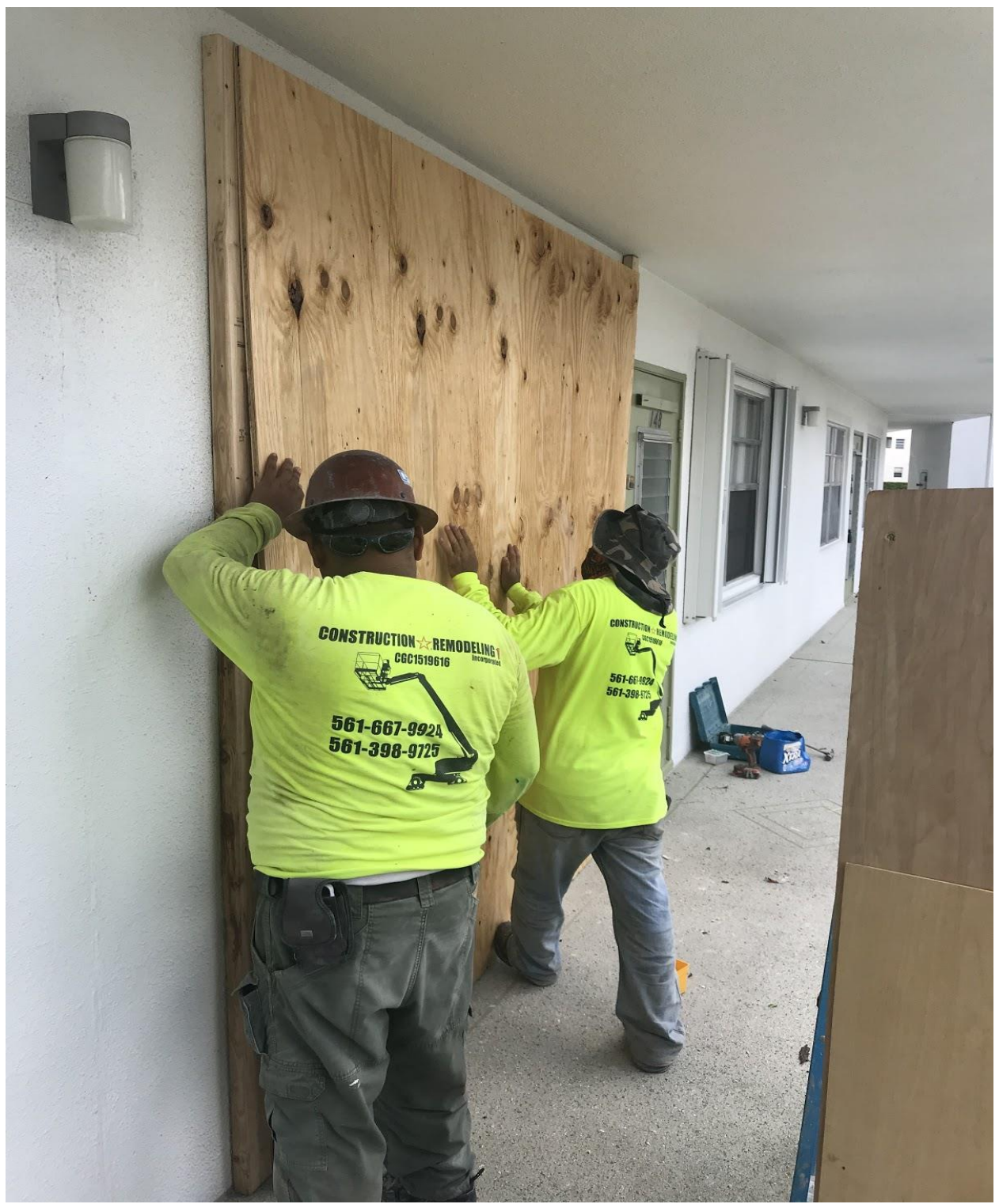
WELLINGTON SECTION- CONSTRUCTION AND REMODELING 1 MADE TEMPORARY REPAIRS TO WALL AND DOOR, ALLOWING THE UNIT OWNER TO REMAIN IN HER UNIT.