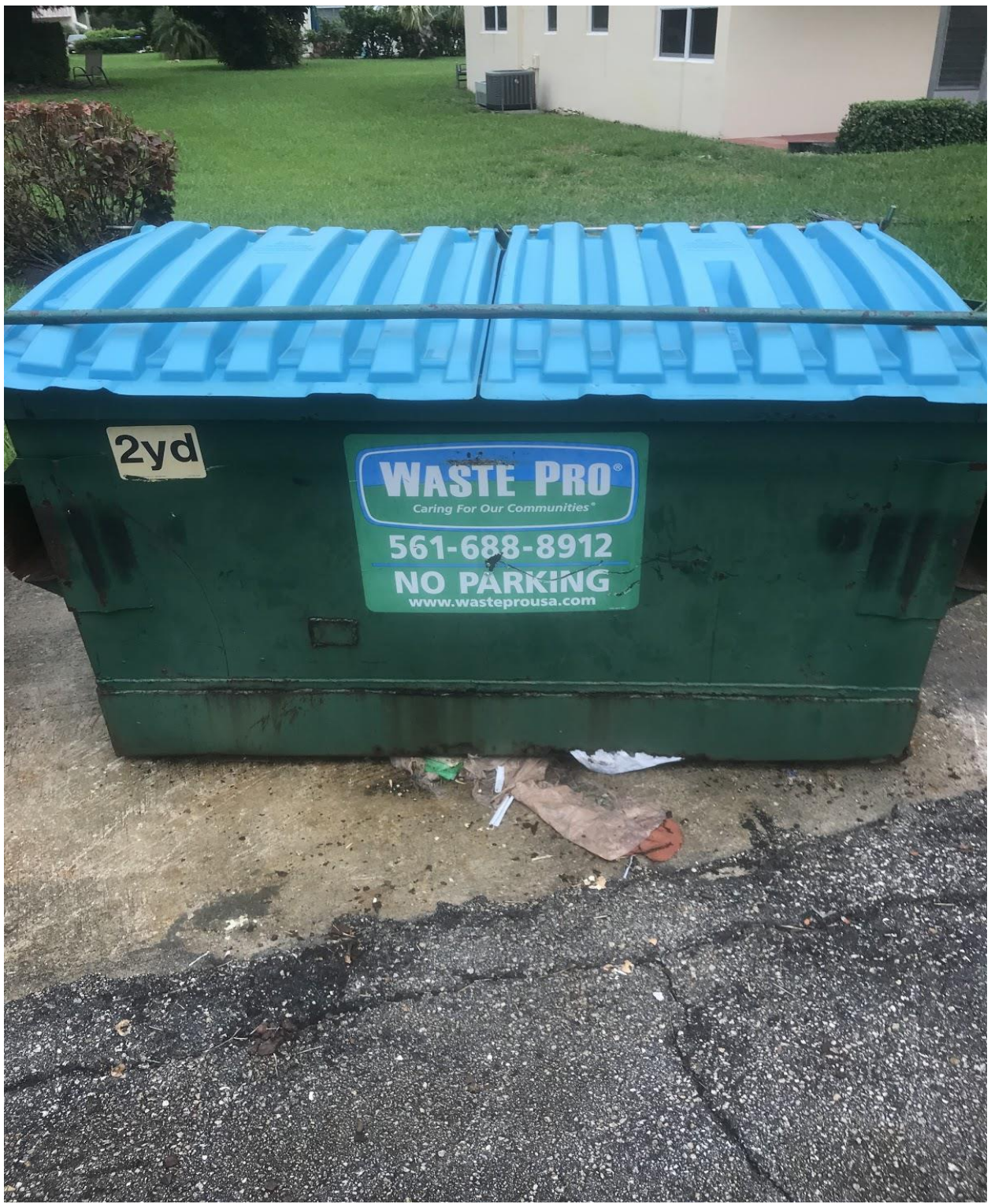
NORWICH SECTION- GARBAGE STICKING OUT FROM THE BOTTOM OF THE DUMPSTER IS A GOOD CLUE THAT THE CAN HAS HOLES.