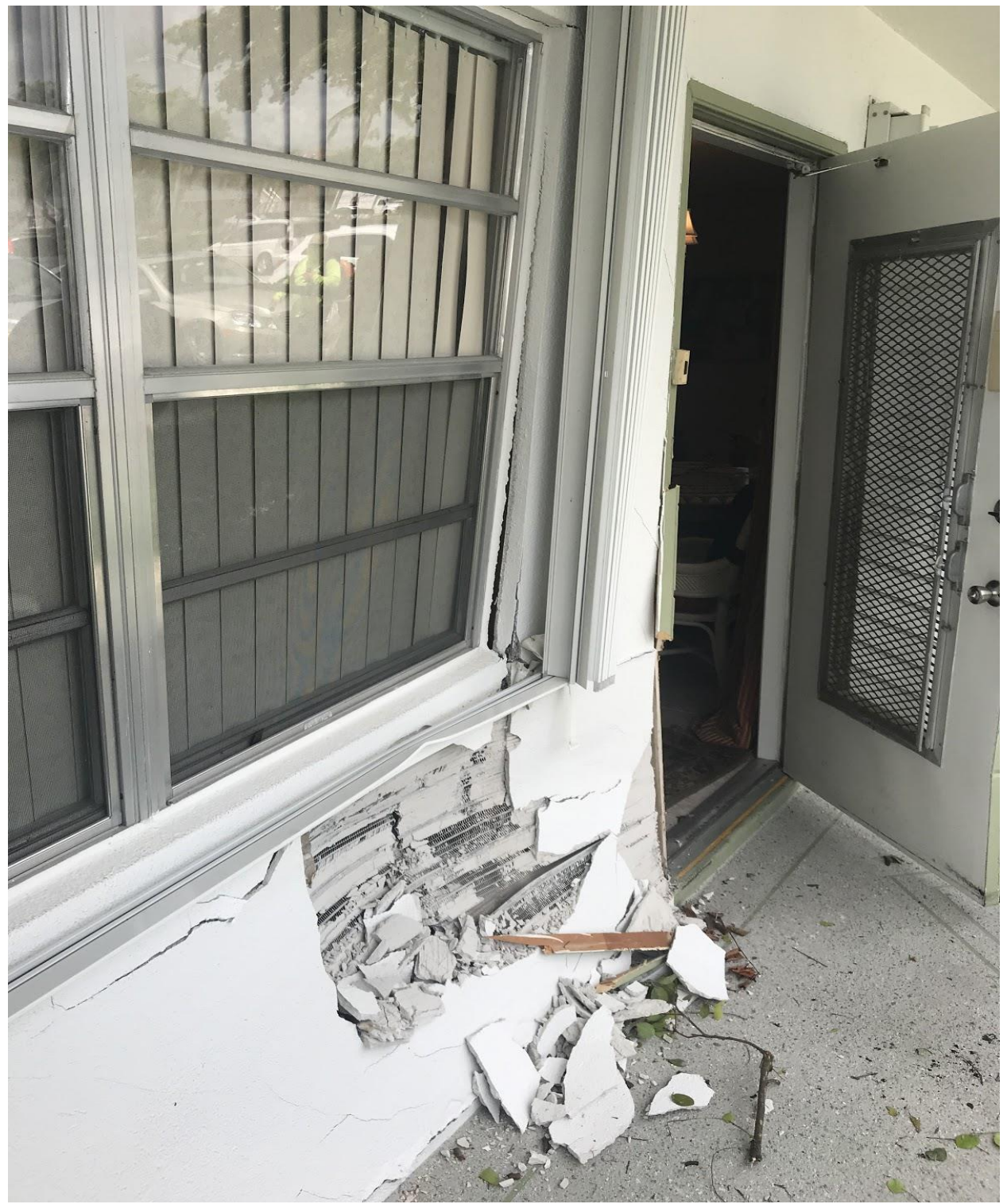
WELLINGTON SECTION- CAR CRASHES INTO BUILDING ON 7/24. NO INJURIES.